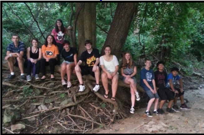
The Pennypack Teen Advisory Council, 2013

to allow Teen Advisory Council members a chance to be actively involved with Philadelphia Parks & Recreation programming and have a sense of responsibility and accomplishment while working alongside PPR staff.