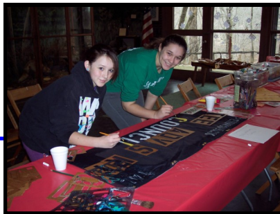
Members created a banner for TAC