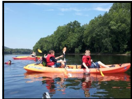
Kayaking along the Delaware for Teen Adventures Week

Founded in 2012, the Teen Advisory Council works alongside PPR staff to plan social and recreational programs for teens and families, and assists at special events and community service projects.