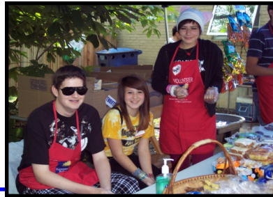
Teens provided food sales at PEC's 2013 Fall Festival