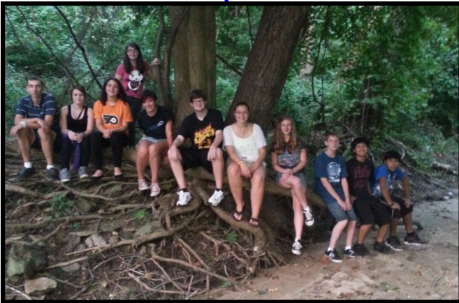
The Pennypack Teen Advisory Council, 2013

to allow Teen Advisory Council members a chance to be actively involved with Philadelphia Parks & Recreation programming and have a sense of responsibility and accomplishment while working alongside PPR staff.