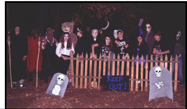
PEC Teen Advisory Council Halloween Campfire 2013