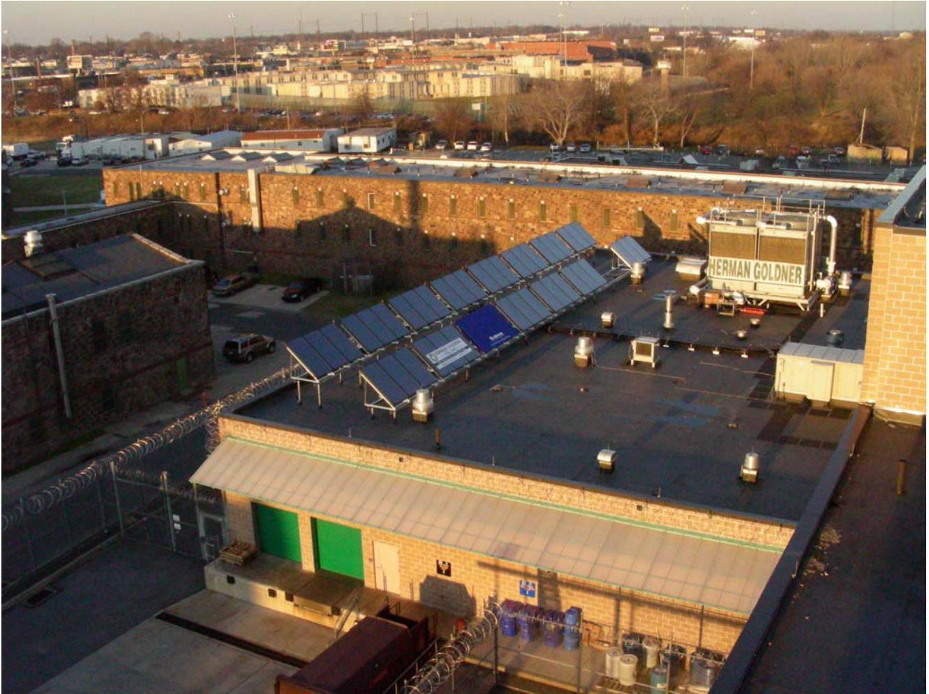
Completed Solar Panel Installation, top of RCF Gym Roof, December 4, 2008