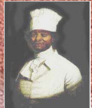
Presumed portrait of Washington's cook [Hercules], attr. to Gilbert Stuart Museo Thyssen-Bornemisza, Madrid.