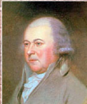
John Adams by Charles W. Peale