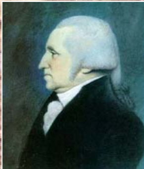
George Washington by Ellen Sharples Collections of Independence National Historical Park

Hercules, Washington's enslaved cook, presided in the kitchen and was considered one of the best chefs in America. In 1797, Hercules successfully seized his freedom. With the help of Philadelphia's large free African community, Oney Judge, Martha Washington's enslaved servant, escaped to freedom from here.