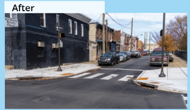
Speed cushions Topes segmentados