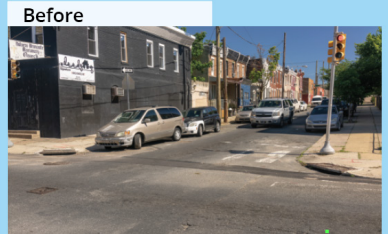
Concrete curb extension Extensión de banqueta de concreto