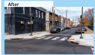
Speed cushions Topes segmentados