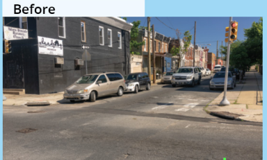
Concrete curb extension Extensión de banqueta de concreto