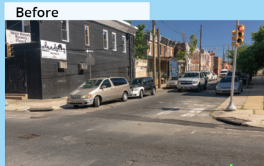
Concrete curb extension Extensión de banqueta de concreto