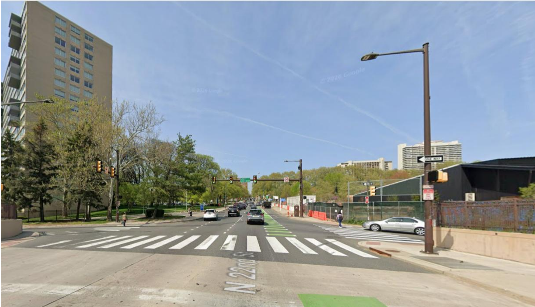
Surrounding area of Park Towne Place's East Tower on N 22 nd St