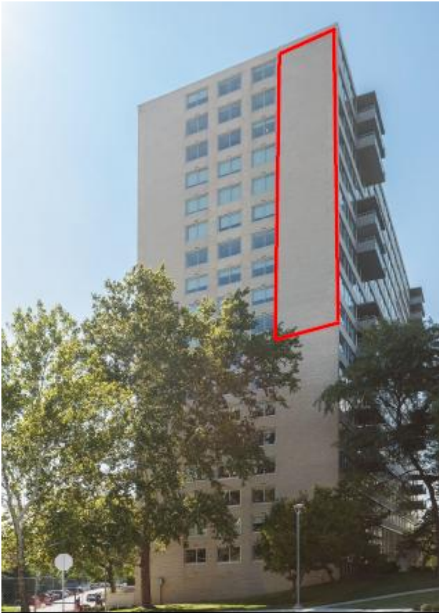
East Tower building – east façade / banner outline 16' x 100'