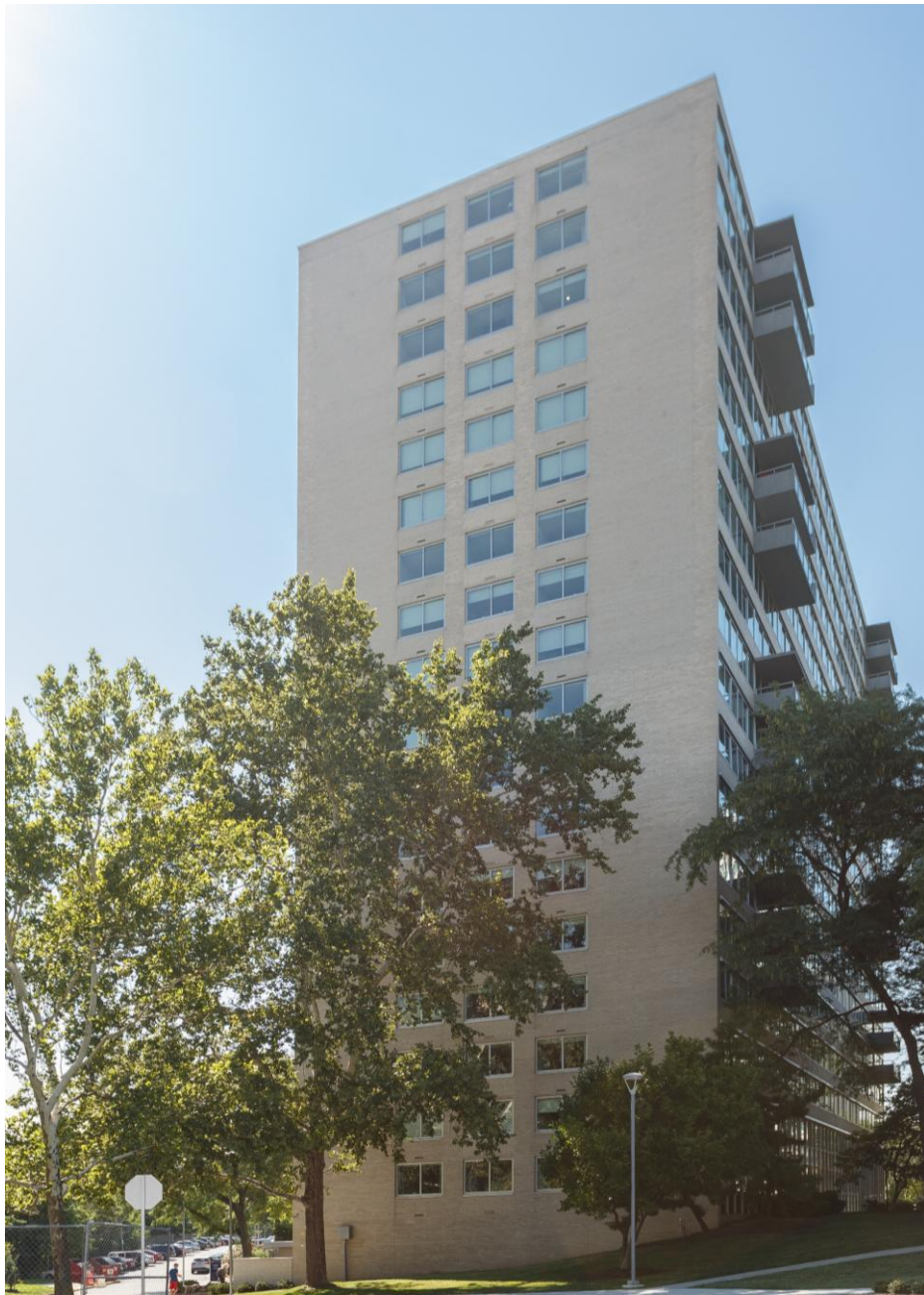
East Tower building – east façade / banner outline 16' x 100'