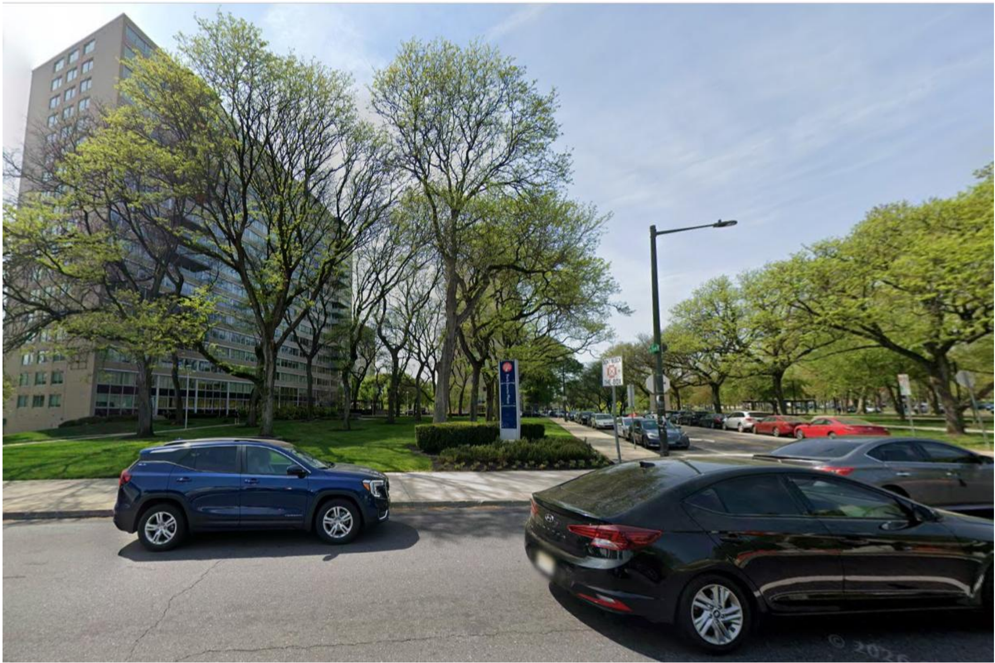
Surrounding area of Park Towne Place's East Tower adjacent to the Parkway