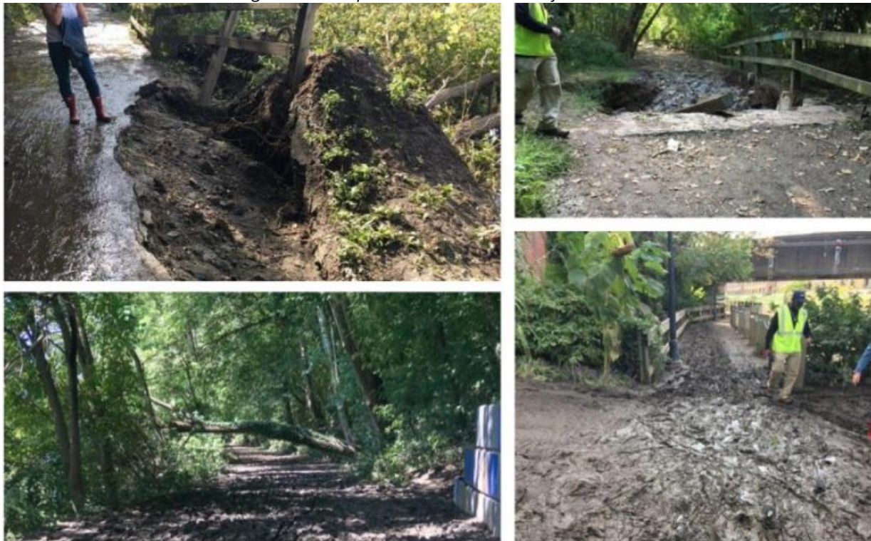
Figure 3: Ida-Impacted Trails and Parks Infrastructure