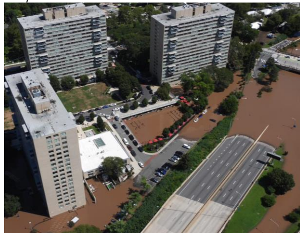
Schuylkill River flooding