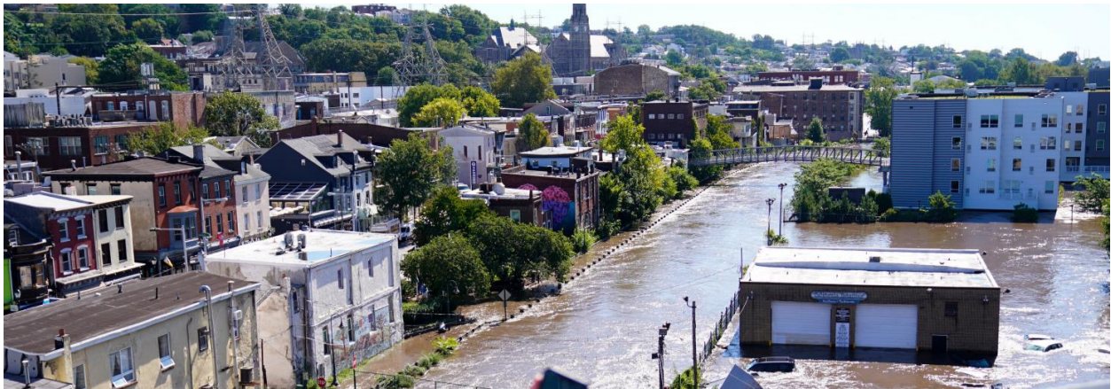
Figure 4: Manayunk after Ida

The aftermath of Hurricane Ida revealed needs tied to the City's preparedness and response to extreme weather events. One of these needs is studying potential resiliency and mitigation efforts to minimize the impact of future hurricanes and storm events. Another area for improvement is planning better evacuation procedures for occupants of subgrade spaces in the event of flash floods. It is also important to identify the location of vulnerable structures, especially residential structures, and explore solutions to better protect them from floods, storms, and other natural hazards. In addition, there is a need to enhance methods for forecasting, monitoring, tracking, and evaluating the impacts of extreme weather events. Addressing these areas of improvement can help the City and its partners better prepare for future extreme weather events.