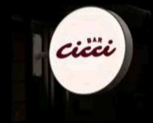
EXTERIOR SIGNAGE WITH NEW WORDING THAT REMOVES "COCKTAILS"