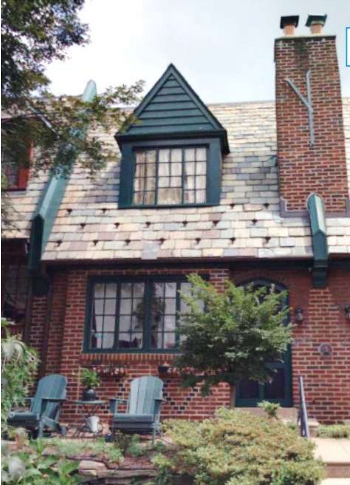
Image 1: 3440 W. Penn Street, showing original windows, July 7, 2025.