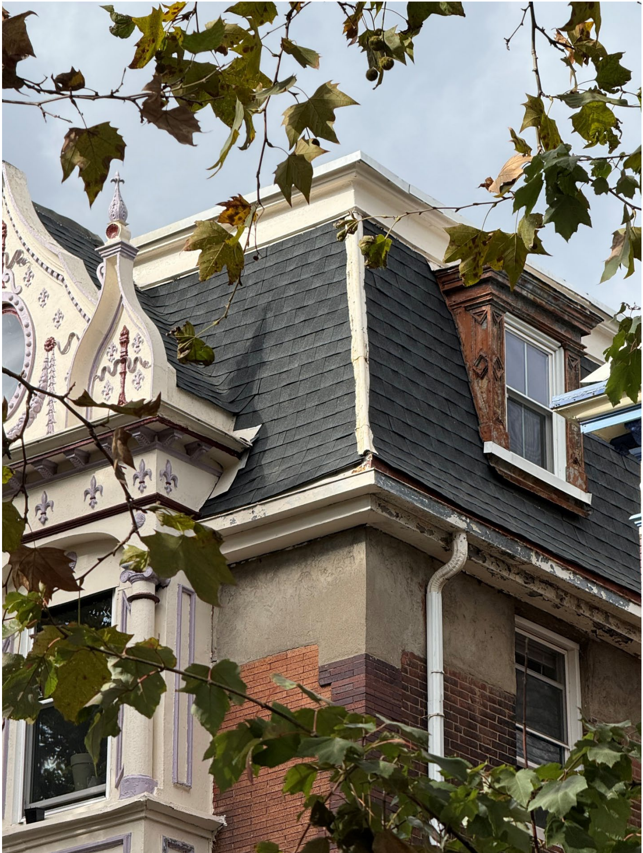
Figure 4. Completed work, October 2025.

4225 Pine Street Philadelphia Historical Commission March/April 2026