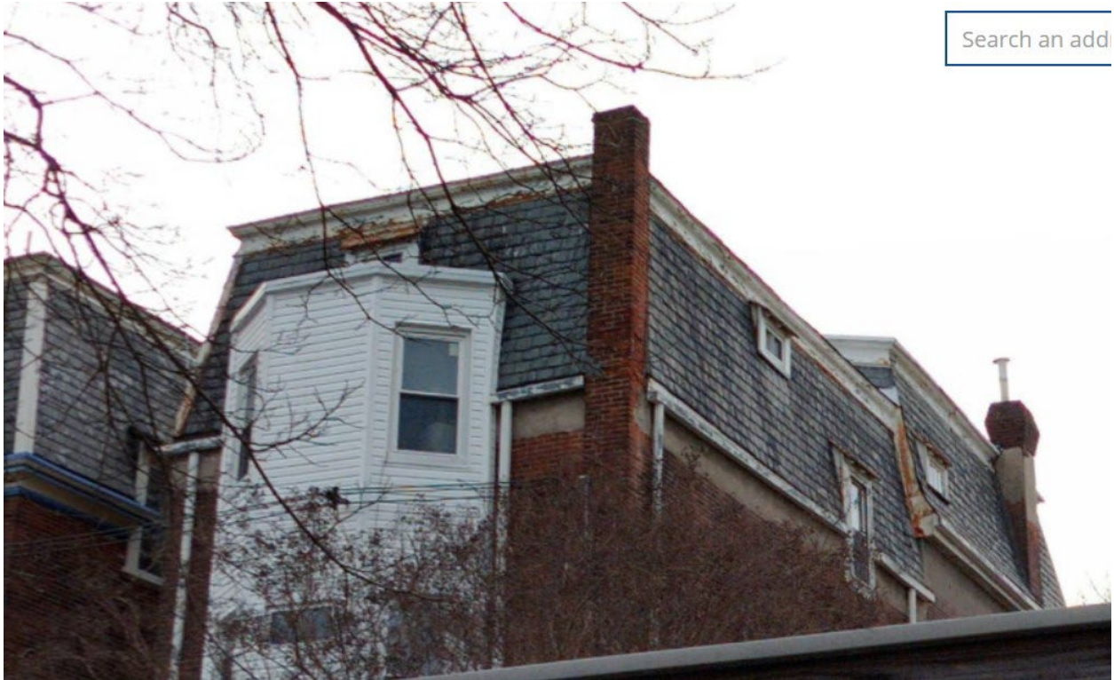
Figure 2. Rear of 4225 Pine Street with original slate mansard, December 2022.