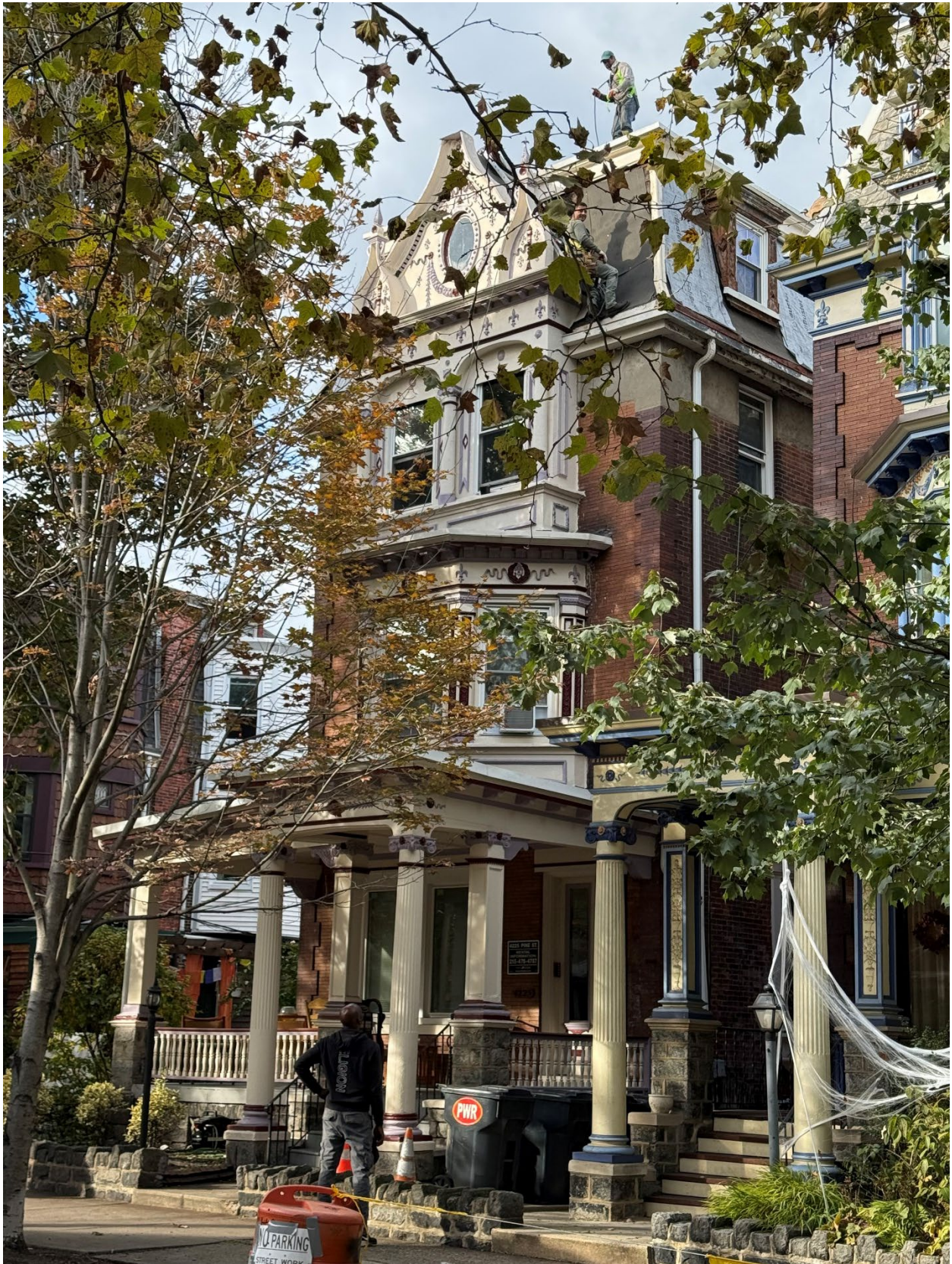
Figure 3. Slate replacement, October 2025. Provided by community member who requested violation.

4225 Pine Street Philadelphia Historical Commission March/April 2026