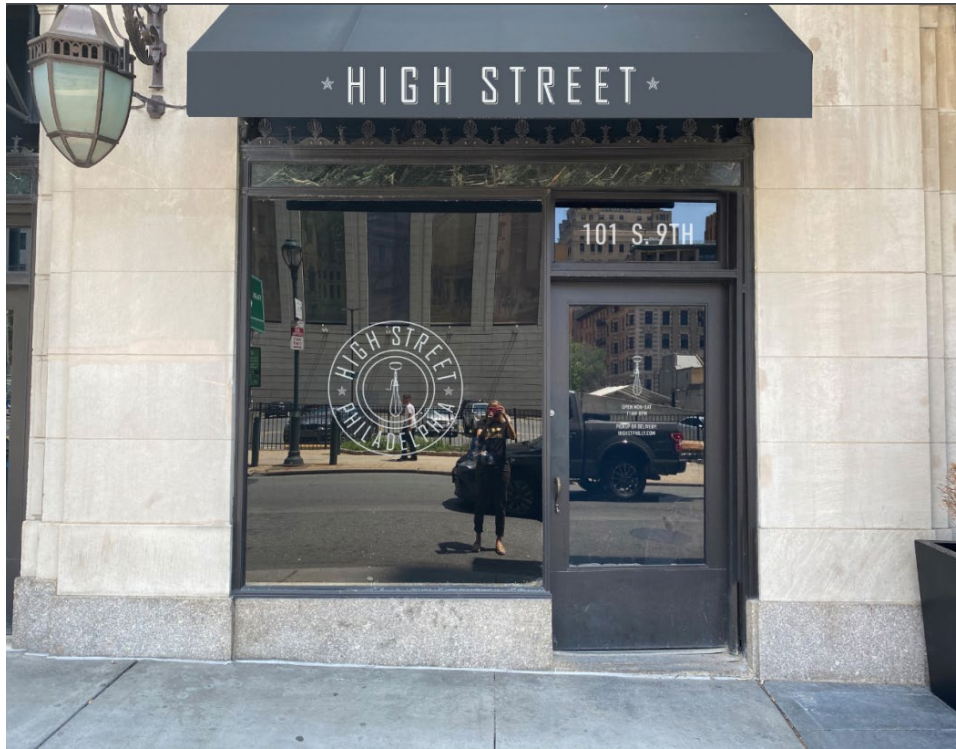
EXAMPLE OF CLEAR GLASS WINDOW AND DOOR