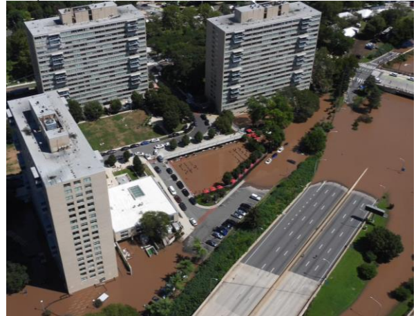
Schuylkill River flooding