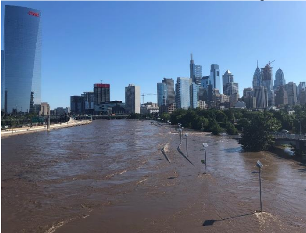
Schuylkill River looking north