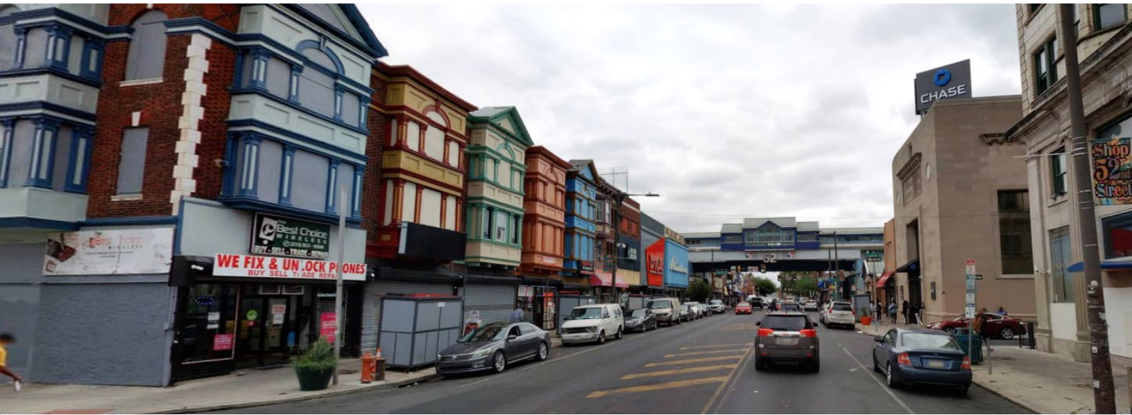
Above: 52nd Street Commercial Corridor

Complete Streets, Reduce Crashes, Pedestrian Safety, Transit Corridor Improvement