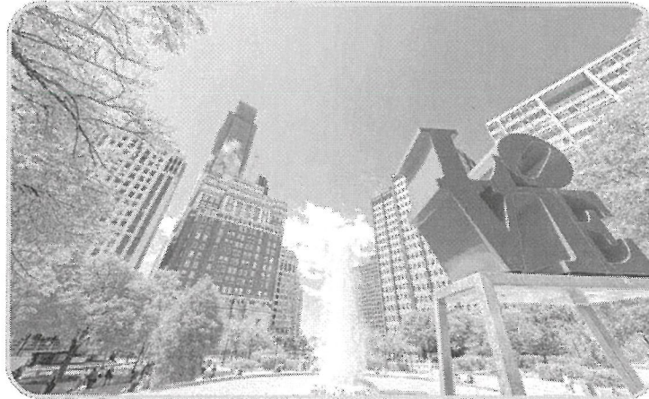
Love Park is one of Philly's most well-known sites.

On Saturday, the jam-packed schedule features stops all around the City of Brotherly Love. Locals can join in on a program honoring Revolutionary War