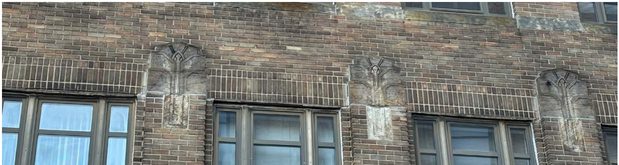
Figure 7. Detail of brick pilasters with stylized chevron sandstone caps, March 2025.

The Lombard Street elevation is comprised primarily of brown brick, which is organized into seven bays, but otherwise contains the same details and windows as on the S. 19 th Street elevation. The second bay historically contained an entrance into the building, and as such, it is altered slightly below the first floor window, and does not contain the same glass block basement windows found on all other bays. 3