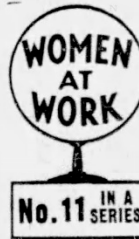
Figure 16. Left: Ledger Star, December 31, 1935, p. 9. Right: The Waco Times Herald, February 5, 1937, p. 9