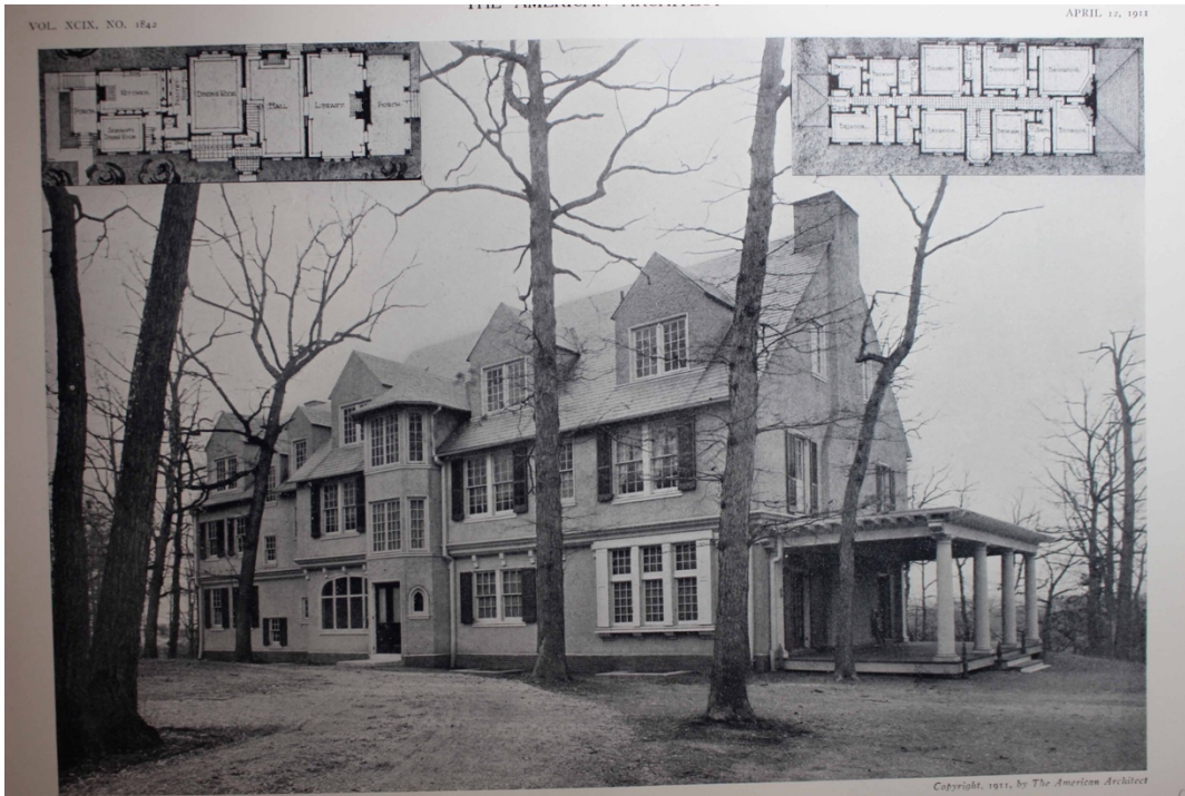
Figure 10. A photograph from the April 12, 1911 edition of American Architect , highlighting a house in Lebanon, Pennsylvania that had been designed by Bissell & Sinkler. It is a fine representation of the firm's early focus on residential architecture. Source: "Article/illustrations: A Country House, Lebanon, Pa Bissell & Sinkler, Architects." AbeBooks.com, https://www.abebooks.com/magazines-periodicals/Articleillustrations-Country-House-Lebanon-Bissell-Sinkler/30959084495/bd .