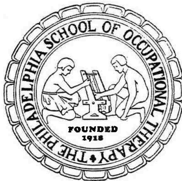
Figure 14. The seal of the Philadelphia School of Occupational Therapy. The same figures, seated in front of a loom, appear on the decorative iron panels underneath the first-story windows of the P.S.O.T. Building. Source: "A Brief History of the Philadelphia School of Occupational Therapy," addendum, page 1.

Over the course of its existence, the P.S.O.T. graduated 1,940 occupational therapists from the U.S. and at least six other nations (Canada, the United Kingdom, India, Australia, South Africa, and the Philippines); six P.S.O.T. graduates received the A.O.T.A.'s Award of Merit for outstanding contributions to the field of occupational therapy, and five the Eleanor Clarke Slagle Lectureship, its highest academic award. 83 20 P.S.O.T. graduates became the head of academic programs in occupational therapy in the U.S., the United Kingdom, and Israel. 84