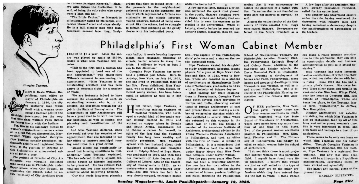
Figure 15. St. Louis Post Dispatch, January 12, 1936, p. 5.