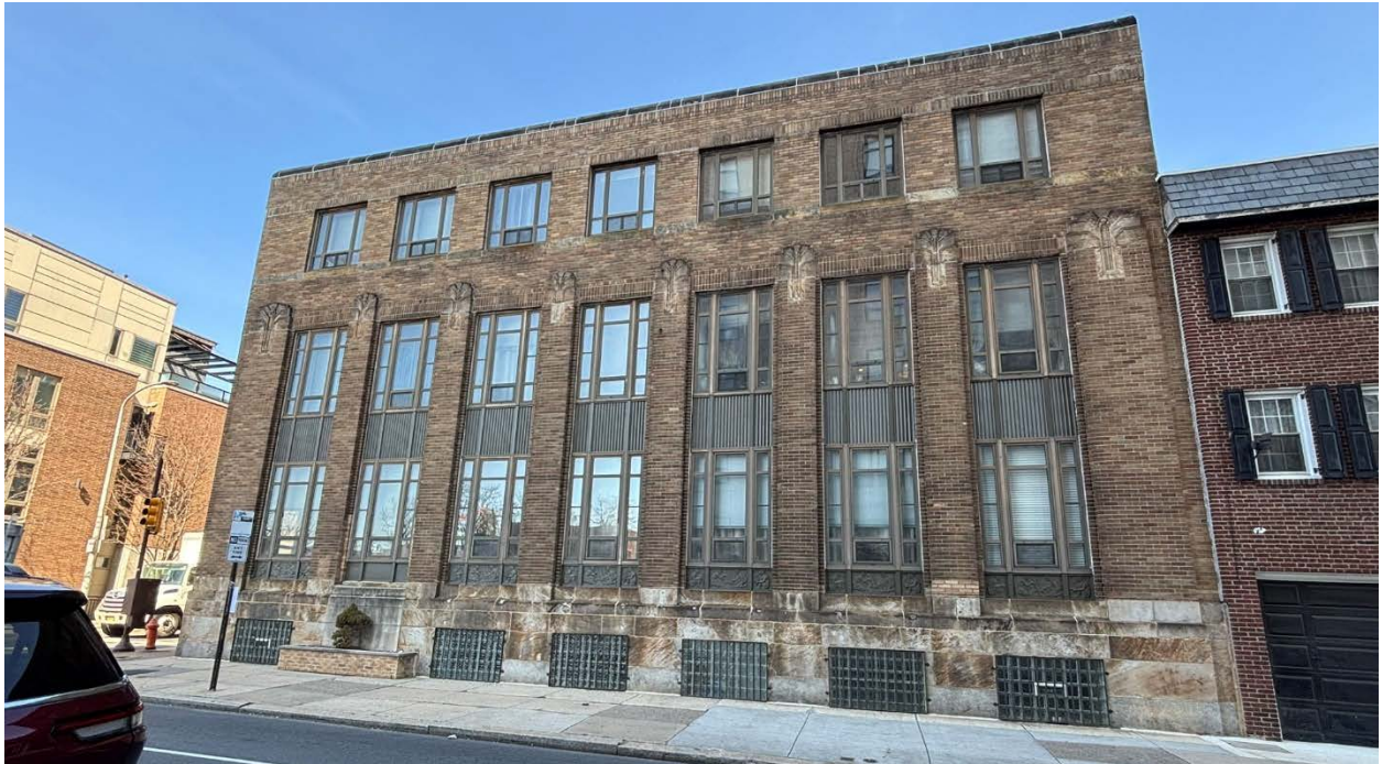
Figure 6. Lombard Street elevation, March 2025.

The Lombard Street elevation is comprised primarily of brown brick, which is organized into seven bays, but otherwise contains the same details and windows as on the S. 19 th Street elevation. The second bay historically contained an entrance into the building, and as such, it is altered slightly below the first floor window, and does not contain the same glass block basement windows found on all other bays. 3