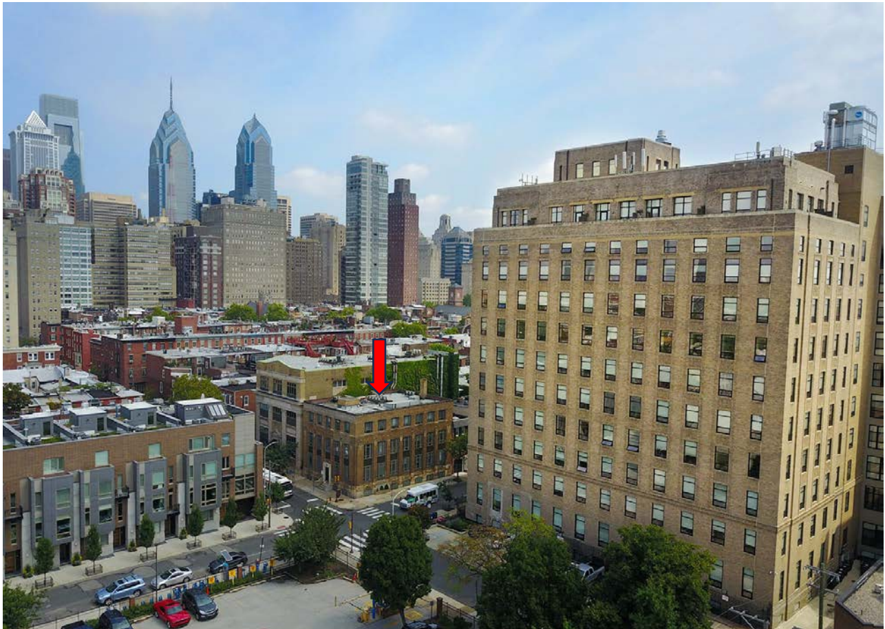
Figure 2. View of the intersection of South 19th and Lombard Streets, looking northeast, illustrating the diversity of architecture in the blocks surrounding the Philadelphia School of Occupational Therapy Building, which is diagonally across from the parking lot in the foreground. Image source: Orange Line Media, August 2017/Alterra Property Group. https://alterraproperty.com/portfolio-items/the-pepper-building/ .

The Philadelphia School of Occupational Therapy Building is a three-story, flat roofed, brown brick building. Its primary façade with entrance fronts S. 19 th Street, and a secondary façade fronts Lombard Street. A neighboring building, 1837 Lombard Street, abuts the east elevation, while the north elevation is an undecorated brown brick wall not easily visible to the public that faces a narrow alleyway between it and the building at 415 S. 19 th Street.