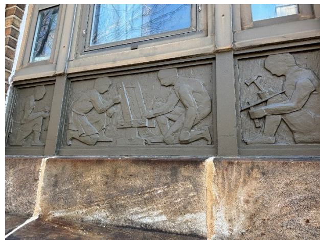
Figure 5. Left: S. 19 th Street entrance. March 2025. Right: Sculptural iron panels below first floor windows. March 2025.