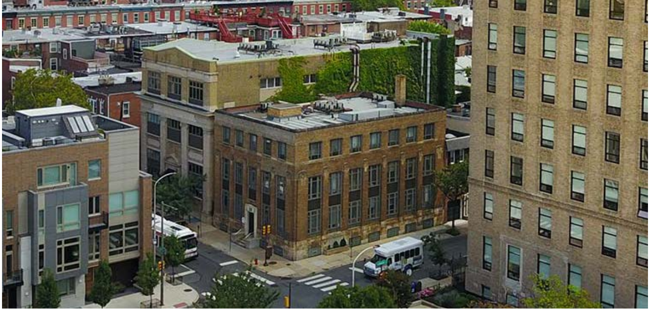
Figure 3. Close-up view from the previous photograph of the intersection of South 19th and Lombard Streets, looking northeast, focusing on the Philadelphia School of Occupational Therapy Building, displaying the building's main façades.