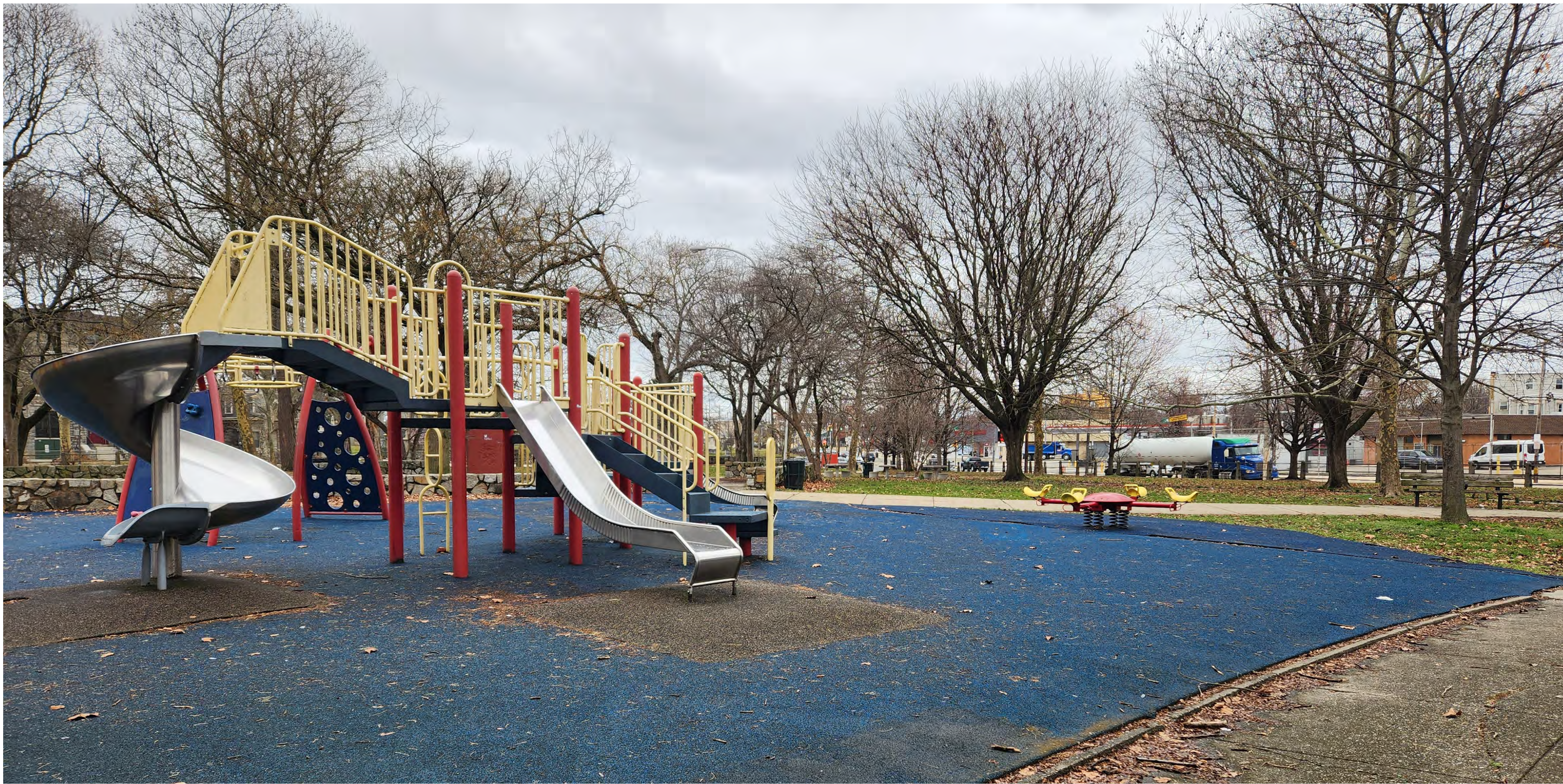
CLARA MUHAMMAD SQUARE PLAYGROUND 4700 LANCASTER AVE