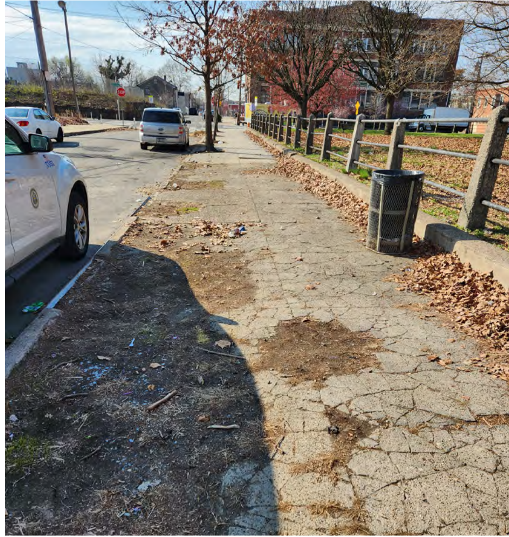
CLARA MUHAMMAD SQUARE PLAYGROUND 4700 LANCASTER AVE