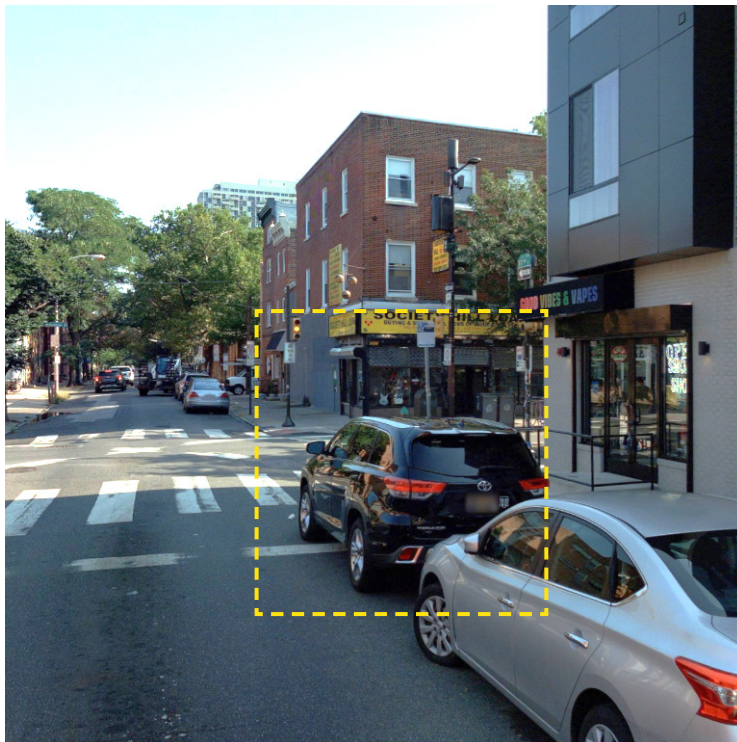
Existing Situation: Vehicles parked in bus stop zones.

Bump-outs improve pedestrian visibility and shorten crossing distances, especially for children and ADA users who are hard to see behind parked cars.