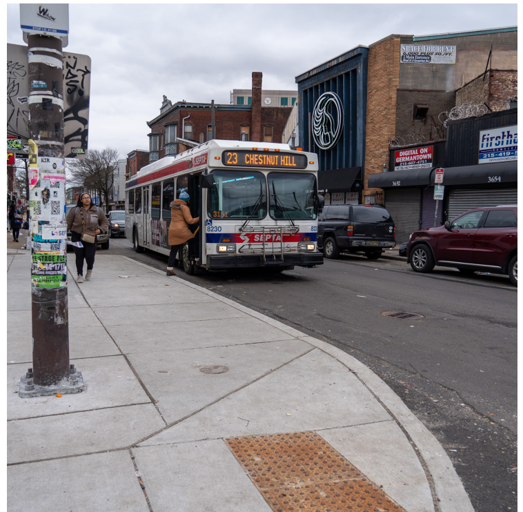
Proposed: A Bump-Out at Germantown Avenue