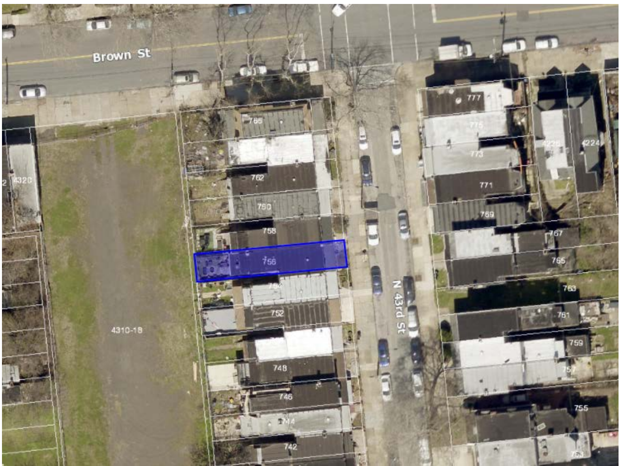
Figure 1. The boundary identifying the parcel at 756 N. 43rd Street.

All that certain lot or piece of ground with the brick messuage or tenement thereon erected. Situate on the West side of 43rd Street at the distance of 84 feet 4.5 inches Southward from the South side of Brown Street in the 60<sup>th</sup> (formerly part of the 24<sup>th</sup>) Ward of the city of Philadelphia, County of Philadelphia and the commonwealth of Pennsylvania. Containing in front or breadth on the said 43rd Street 16 feet 1.5 inches and extending in length or depth Westward of that width between lines at right angles with the said 43rd Street 90 feet to a certain three feet wide alley extending Northward into the said Brown Street.<sup>1</sup>