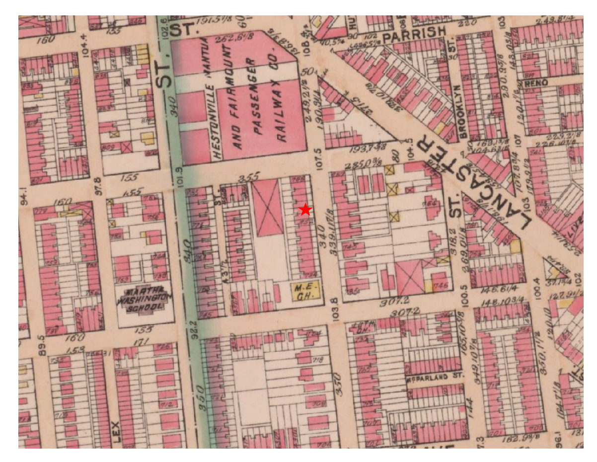
Figure 5: Detail of an 1895 atlas showing property after the row was built. Bromley, G. W., Atlas of the City of Philadelphia . North at top of image.