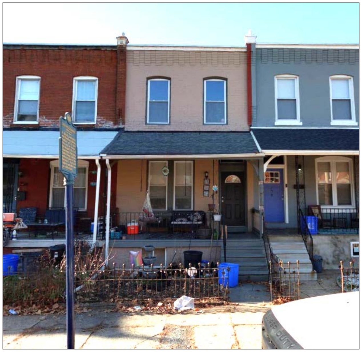
Figure 2. Front façade of 756 N. 43<sup>rd</sup> Street.

The property at 756 N. 43<sup>rd</sup> Street is a two-story Queen Anne-style brick rowhouse located in the Belmont neighborhood of West Philadelphia between Brown Street to the north and Aspen Street to the south. The building shares party walls with similar two-story brick row houses on either side.