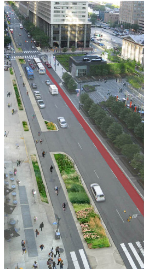
Center City District Rendering/Example from 2011 Report