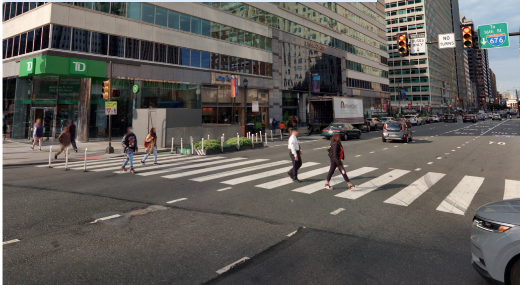
JFK Blvd & 16th St, 2023

The image on the right shows an idea of what the this corridor could look like in the future.