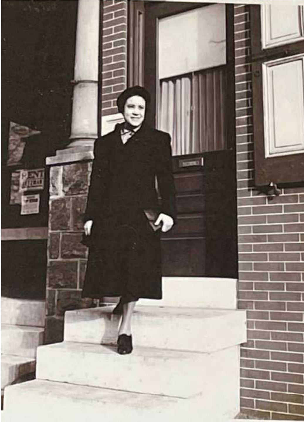
Figure 8. Crystal Bird Fauset at 5401-03 Vine Street on Election Day, November 1938.