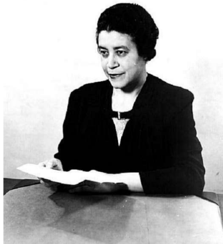
Figure 10. Crystal Bird Fauset, c. 1938.

Building on her platform of affordable housing, fair employment legislation, and clearance of slum areas, Crystal won the Democratic Party's nomination for the Pennsylvania State Legislature in 1938. 24 The Philadelphia Tribune credited Fauset's ability as a public speaker as an asset to both her campaign and larger political career. 25 This, combined with the staunch support of women and an innovative telephone appeal, won Fauset the election in a district where two-thirds of the voters were white. 26