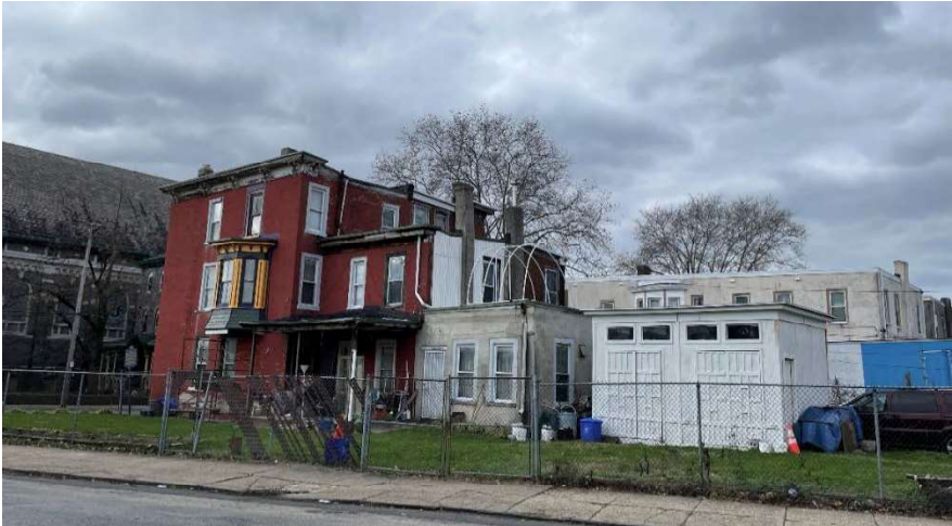
Figure 4. Northeast corner of 5401-03 Vine Street, Philadelphia, PA.