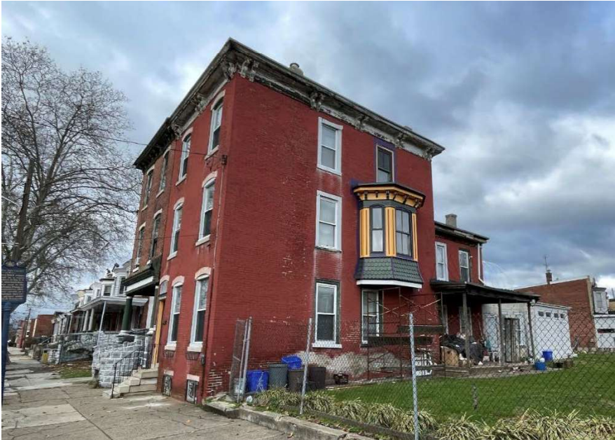
Figure 3. Southeast corner of 5401-03 Vine Street, Philadelphia, December 2022.

The cornice continues to the east façade of the house. The bay window facing east was built styled with inset wooden panels, corner boards, and bracket details similar to the main roof cornice. A skirt of shaped shingles was added to update its style. The east porch that overlooks the garden would have had elaborate moldings and brackets complimenting the style of the period. Over the years, the rear decorative elements have largely been lost, either through lack of maintenance or remodeling. The lower half of the east bay window was at one point repaired with stucco but recently has had the scalloped-shaped shingles restored. A carriage house that was at the rear of the property has since been demolished and today a small garage sits at the rear of the lot.