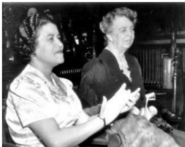
Figure 11. Crystal Bird Fauset and Eleanor Roosevelt, c. 1942.

I do think that the men of this House (as they sit around and smoke their cigars, and as they get a great sense of well-being from doing so), should think what their ideas would be if some day their own economical status should change and their wives for some reason or other should be compelled to work, whether or not they would be willing to see their wives go out of their homes at four o'clock in the afternoon, with the knowledge that they would not return [home] until one or two o'clock the following morning. Certainly, a group of women, for the sake of bringing a few industries into the state of Pennsylvania, should not be subjected to the thing which we, as perfectly normal human beings, think of as being abnormal. 29