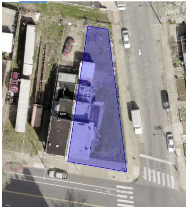
Figure 1. Aerial photo of 5401-03 Vine Street, Philadelphia, PA showing the lot boundaries. Vine Street appears at the bottom of the image and 54 th Street to the right.