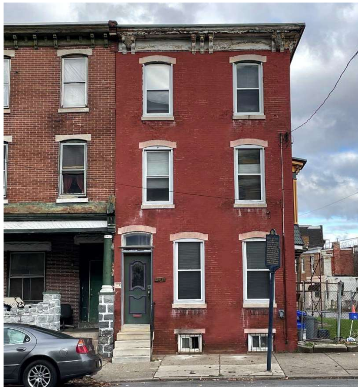
Figure 2. South façade of 5401-03 Vine Street, Philadelphia, December 2022.

The house demonstrates the typical features of the Victorian Italianate style that was popular between 1850 and 1890: flat roofs, wide cornices with single and paired decorative brackets, and narrow one over one double-hung shuttered windows with curved window caps. The entrance steps on the south side of the building are marble, typical of the Victorian Italianate style. The simple style of the brick twin features bracket detailing at the cornice line with pronounced masonry window head trim on the north side of the building. The south side also features two basement windows with identical masonry window trims.