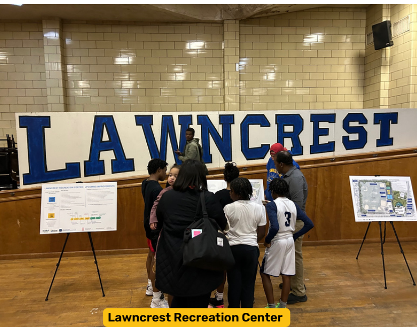
Lawncrest Recreation Center