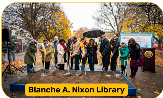
Blanche A. Nixon Library

Construction began at Lawncrest and Blanche A. Nixon Libraries. Both are undergoing major renovations - a total Rebuild investment of $13 million.