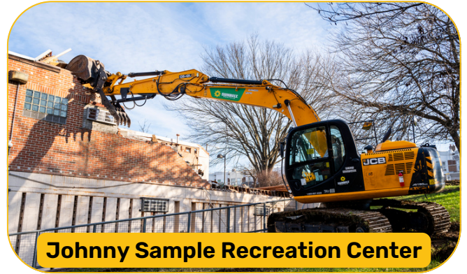
Johnny Sample Recreation Center

Synthetic turf for the new multisport field is laid at Murphy Recreation Center in South Philadelphia, while demolition on the roof at Johnny Sample Recreation Center in West Philadelphia is the first step of Rebuild's $15 million investment.