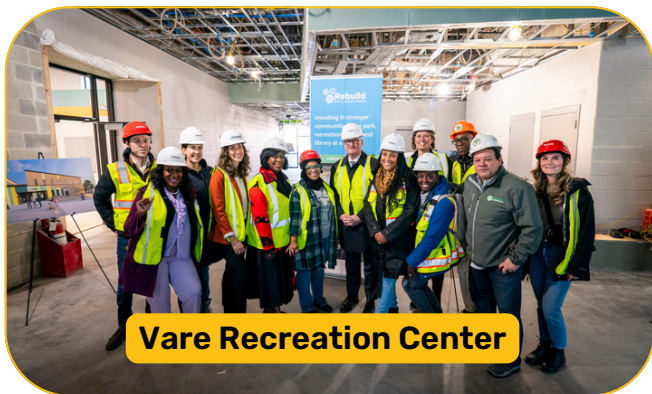
Vare Recreation Center

Synthetic turf for the new multisport field is laid at Murphy Recreation Center in South Philadelphia, while demolition on the roof at Johnny Sample Recreation Center in West Philadelphia is the first step of Rebuild's $15 million investment.