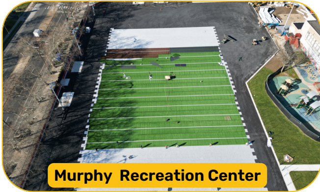
Murphy Recreation Center

With 21 sites under or preparing for construction, tangible results of the Rebuild initiative are being felt throughout the city.