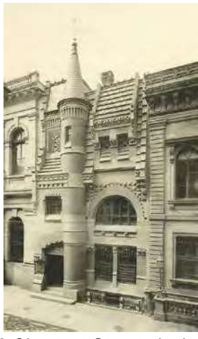
Figure 5 (left) - The Guarantee Trust Company at 316-20 Chestnut Street, designed by Frank Furness and built 1873-75. Demolished.