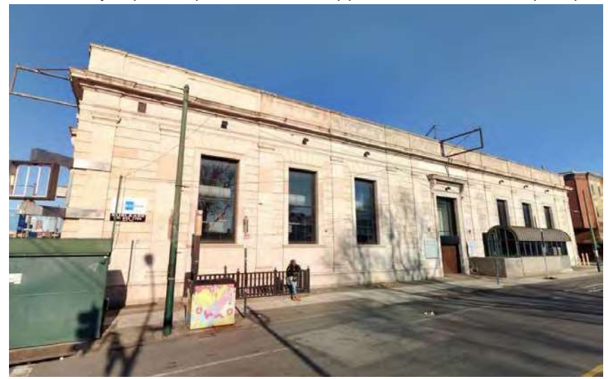
Figure 3: South elevation, looking northeast from Snyder Avenue.

sidelights rather than unglazed hollow metal doors. The three bays to the west and east of the entrance each contain non-historical, double-hung aluminum windows within architrave surrounds that sit atop a limestone water table. At the top of each window, there are modern vinyl awnings. Each window is framed by a pair of pilasters that support the cornice and parapet wall above.