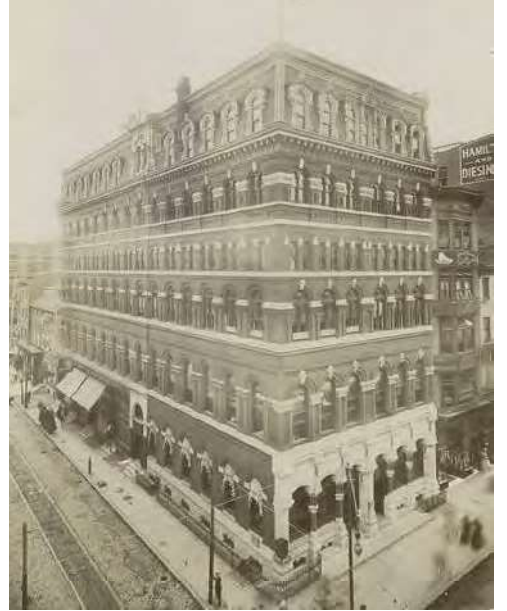
Figure 1 - The Beneficial Saving Fund Society building as it appeared in 1880, and after the 1887 additions and alterations (Free Library of Philadelphia).

The ever-growing ranks of Beneficial customers led the institution to dramatically expand its headquarters several times beginning in 1880. That year, Beneficial demolished its relatively