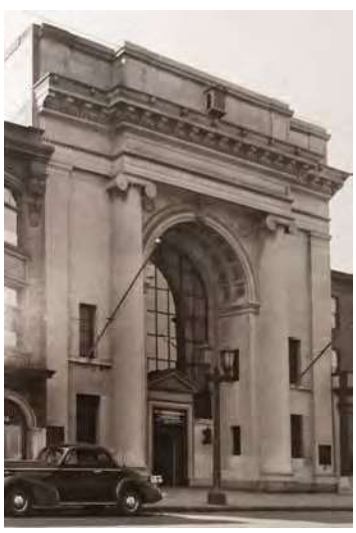
Figure 18 (left) - The Hamilton Trust Company at 40th and Market, designed by the firm of Horace Trumbauer and built 1906-07 ( AIA/T-Square Club Yearbook, 1907 ). Demolished.

Figure 19 (right) - The Excelsior Trust Company at 1006 E. Lehigh Avenue, designed by the firm of Horace Trumbauer and built in 1925 (Mutual Assurance Collection, Athenaeum of Philadelphia). Extant.