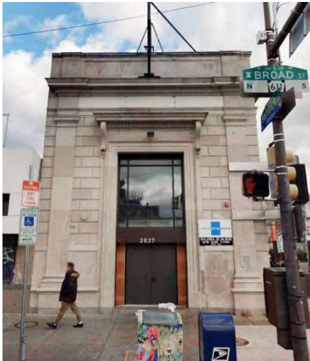
Figure 1 (left): West and south elevations, looking northeast from Broad and Snyder.