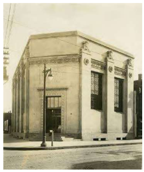
Figure 16 (left) - The Integrity Trust Company at 719 Chestnut Street, designed by Paul Cret and built 1927-29. Extant.