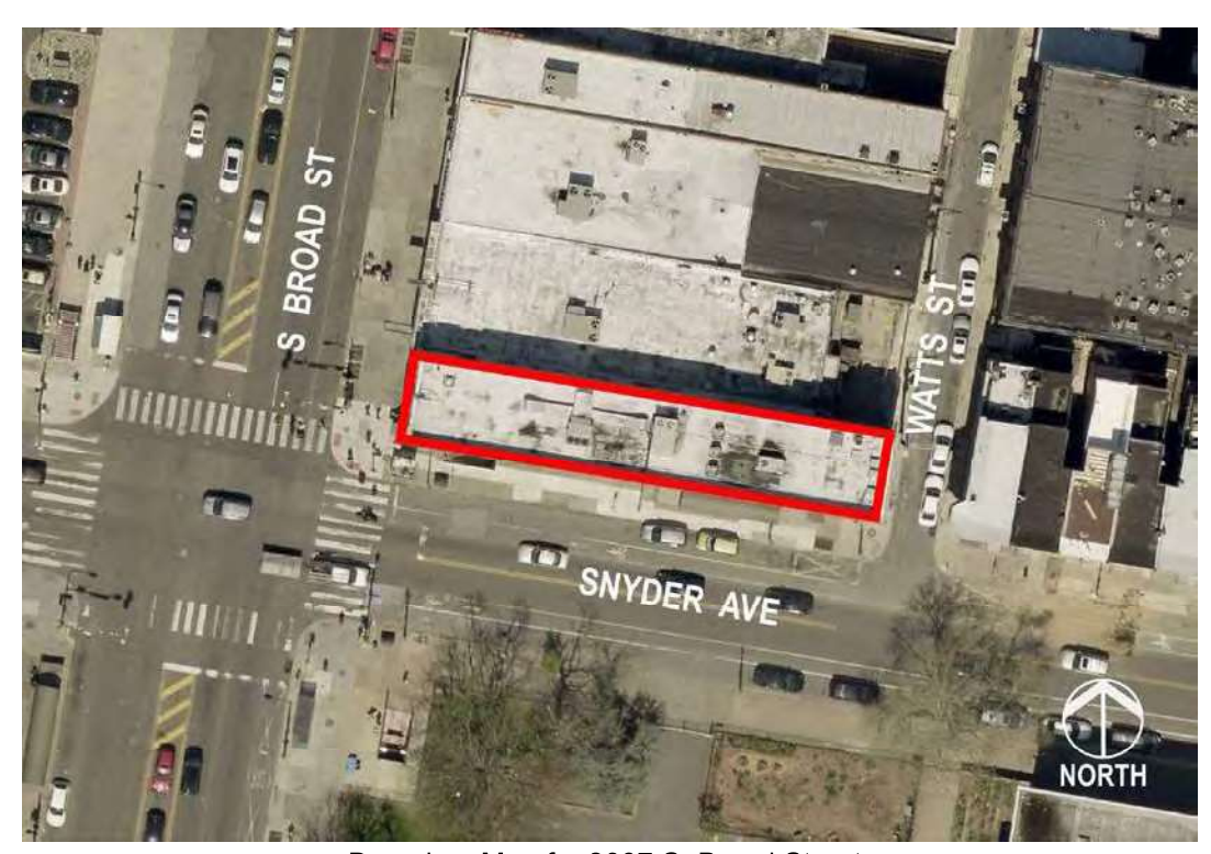
Boundary Map for 2037 S. Broad Street.

The property is located at the northeast corner of South Broad Street and Snyder Avenue, containing in front or breadth on the said Broad Street twenty-seven feet two and one-half inches and extending in length or depth eastward along the north side of Snyder Avenue one hundred and fifty feet to the west side of Watts Street.