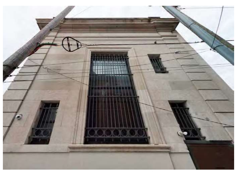
Figure 5: East elevation, looking west from Watts Street.

On the north elevation, the bank abuts an adjacent one-story building that fronts on Broad Street. Above the one-story building, the north elevation of the bank has stucco walls except at the easternmost end, where the walls are red brick and have slightly projecting piers.