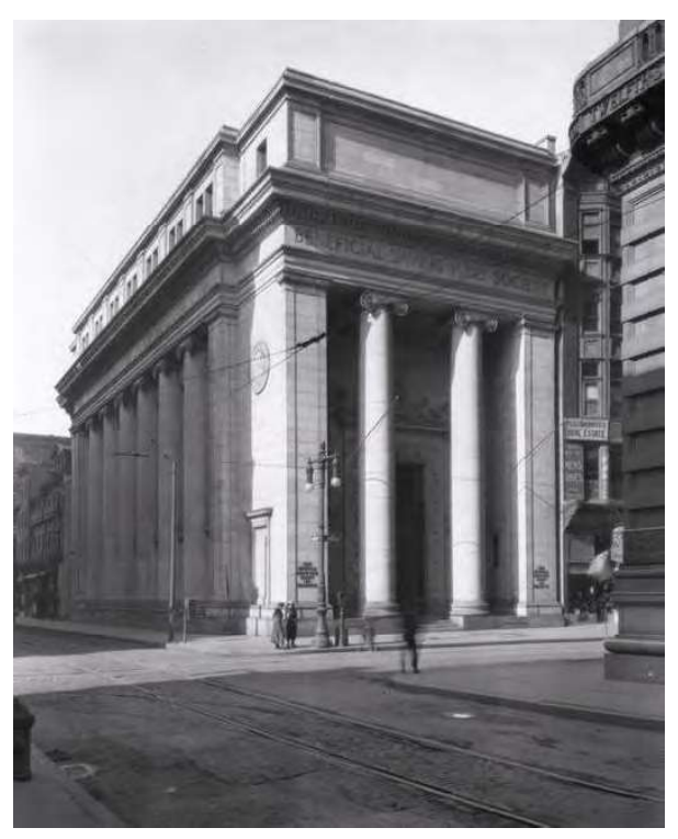
Figure 2 - The new Beneficial Saving Fund Society building as designed by the firm of Horace Trumbauer and completed in 1918.

small, three-story home and replaced it with a four-story building designed by leading Catholic architect Edwin Forrest Durang in a High Victorian version of the Renaissance Revival style (Figure 1). And in 1887, after having acquired the adjacent property at 1202 Chestnut Street in 1885, Beneficial built a 6-story addition and added two stories, including a mansard roof, to the 1880 building to create a unified though overbearing whole (Figure 1). Much of this building was devoted to tenant office space, with Beneficial occupying only a portion of the first floor. By 1915, this space had proven inadequate for the still growing business, and Beneficial began planning for a new building that year. The 1880/1887 building was subsequently demolished and replaced by the Classical Revival-style building, designed by the firm of Horace Trumbauer, that still exists at 12th and Chestnut today (Figure 2). The building was completed in 1918.