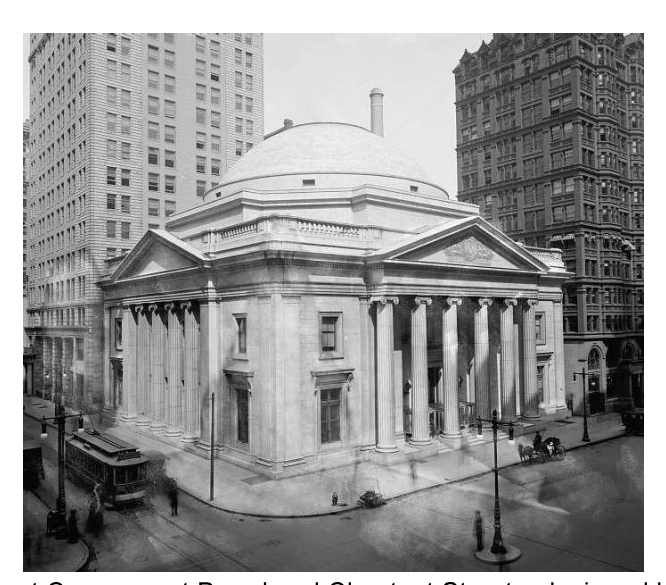
Figure 9 - The Girard Trust Company at Broad and Chestnut Streets, designed by Furness & Evans with McKim, Mead & White and built in 1907. Extant.

As the third largest city in the United States and a major financial center, Philadelphia would witness a wealth of bank construction between about 1900 and 1930. During this period, both the