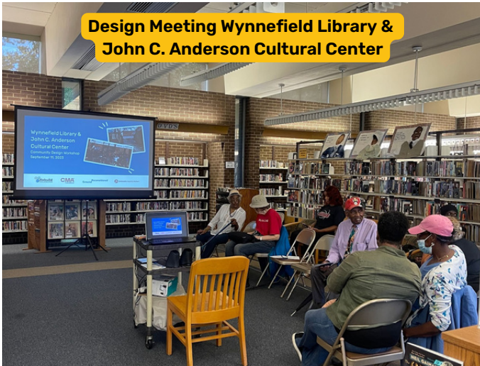
Design Meeting Wynnefield Library & John C. Anderson Cultural Center

Rebuild connects with residents and staff to host a variety of community engagement events at project sites and in surrounding neighborhoods to hear their ideas for designed improvements.