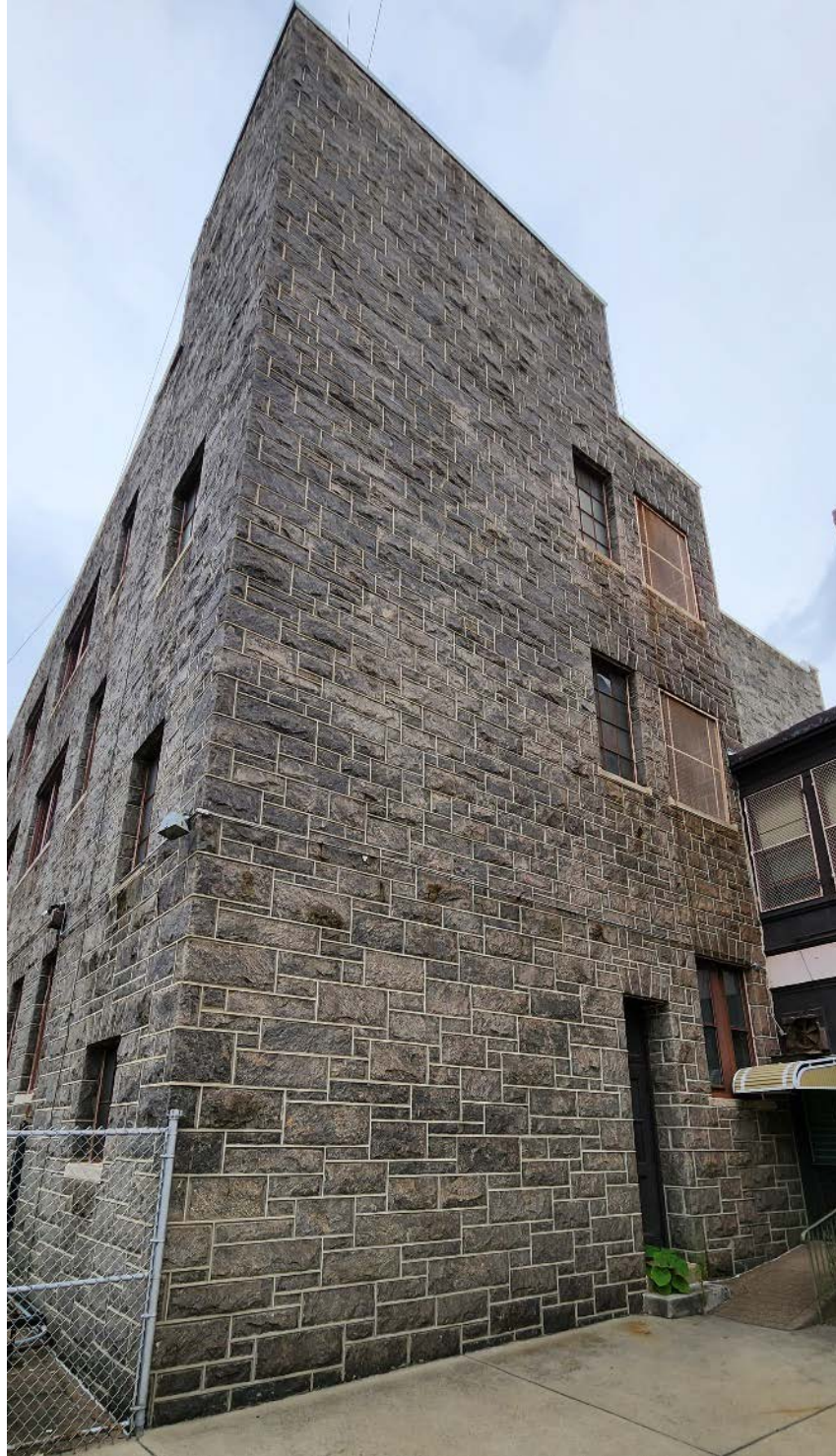
Figure 5: North Elevation facing courtyard.

The North Elevation, also facing a concrete courtyard, consists of the fire tower of the building. It has one window and one opening (enclosed with wire mesh) on the second and third floors. The first floor has an entryway and a two-part mullion window. All the windows and the door have splayed granite lintels with keystones. This area is also not accessible from the Right of Way.