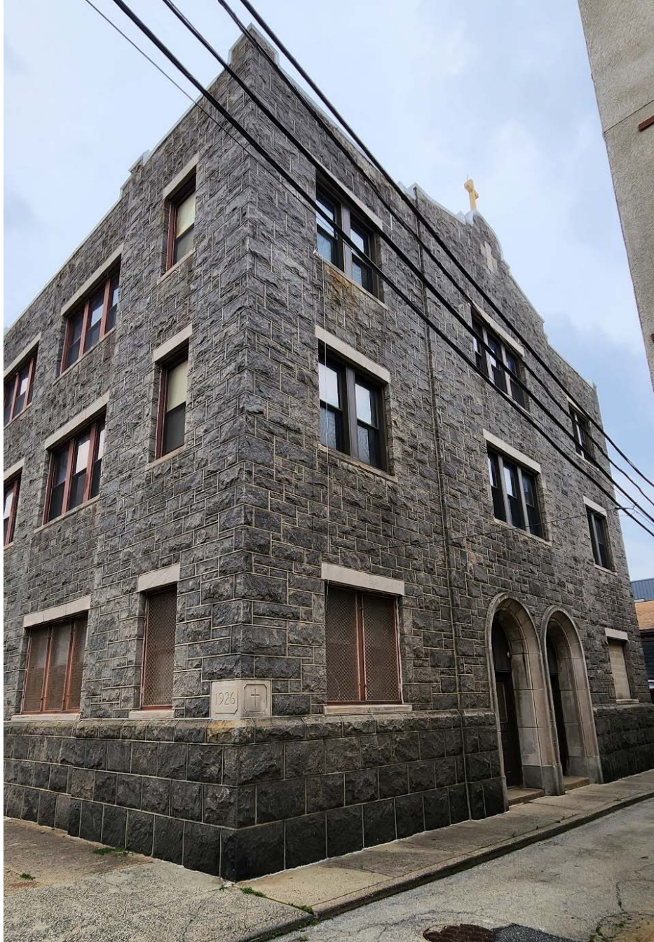
Figure 3: North Elevation facing Reno Street.

The North Elevation, facing Reno Street, consists of three sections: starting from the east, the first and third sections have three sets of two-part mullion windows, but the first floor window in the third section has been filled in with concrete masonry units. The first section has the north side of the cornerstone, which is inscribed with a cross. The second section in the middle has two sets of three-part mullion windows above two entryways. This section has another Mission-style parapet, simple stone cross on the façade, and is also topped by a gold-colored cross. As with the east elevation, the windows have simple granite rectangular lintels and sills, the entry doors have granite molding, and the façade stone has a course ashlar pattern along the base.