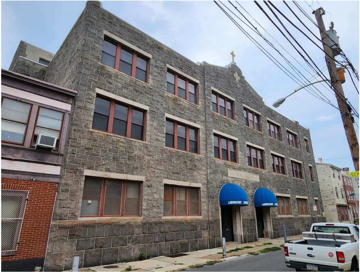
Figure 2: East Elevation facing Orianna Street.

The Saint Agnes Roman Catholic School is a three-story institutional building at the southwest corner of Orianna and Reno Streets. On all four sides, it has a façade of rusticated granite in a random ashlar pattern. The entire building's roof line has stone coping.