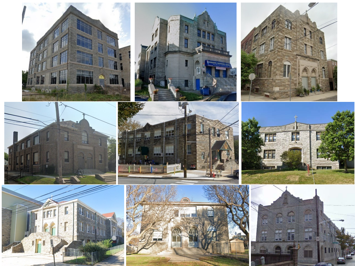
Figure 8: Left to Right, 1 st Row: Most Blessed Sacrament School Annex, 5600 Chester Avenue, Philadelphia, PA, 1925. Holy Name School, 700 Gaul Street, Philadelphia, PA, 1927. Saint Benedict School, 1919 Medary Avenue, Philadelphia, PA, 1925. 2 nd Row: Our Lady of Peace School Millmont Avenue, Ridley, PA, 1928. Saint Francis of Assisi School, 112 Saxer Avenue, Springfield, PA, 1929. Saint Thomas of Villanova School, 1225 E Lancaster Avenue, Bryn Mawr, PA, 1925. 3 rd Row: Saint Alice School, 150 Hampden Road, Upper Darby, PA, 1924. Demolished. Saint Charles Borromeo School, 1731 Hulmeville Road, Bensalem, PA, 1926. Saint Anne School, 2301 E Tucker Street, Philadelphia, PA, 1926.