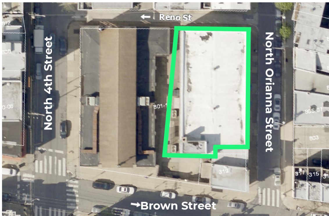
Figure 1: Aerial Photo: Philadelphia Atlas

THENCE, extending SOUTH 78 DEGREES 33 MINUTES 33 SECONDS EAST, along the said southerly side of Reno Street, a distance of 60 feet to point of intersection with the said westerly side of Orianna Street, being the first mentioned point and place of beginning.