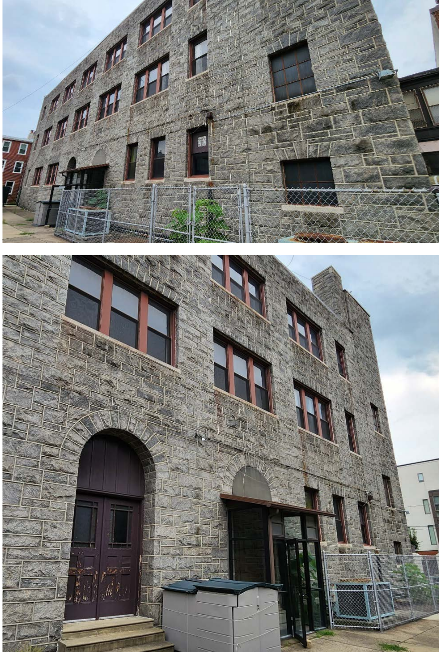
Figure 4: West Elevation facing interior courtyard.

The West Elevation, facing a concrete courtyard, is similar to the East elevation, but with some notable differences. The façade is not delineated into sections, does not have a course ashlar pattern at its base, nor does it have a parapet. The windows have splayed rusticated granite lintels with keystones. The arched entryways have rusticated granite molding. The second and third floors have five sets of three-part mullion windows and two single windows on either side. The first floor has two sets of three-part mullion windows, two arched entryways, and four single windows, one on the north end of the building (filled in with concrete masonry units) and three on the south end of the building. The fire stair on the south side of this elevation has three single windows, offset in alignment with others. This area is not accessible from the Right of Way.