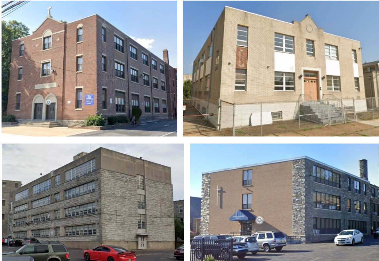
Figure 9: Left to Right, 1 st Row: Saint Bernadette School, 1001 Turner Road, Drexel Hill, PA, 1948. Immaculate Conception School, 811 N 8 th Street, Philadelphia, PA, 1951. 2 nd Row: Saint Martin School Annex, 5400 E Roosevelt Boulevard, Philadelphia, PA, 1956. Annunciation B.V.M. School Addition, 421 Brookline Boulevard, Havertown, PA, 1958.