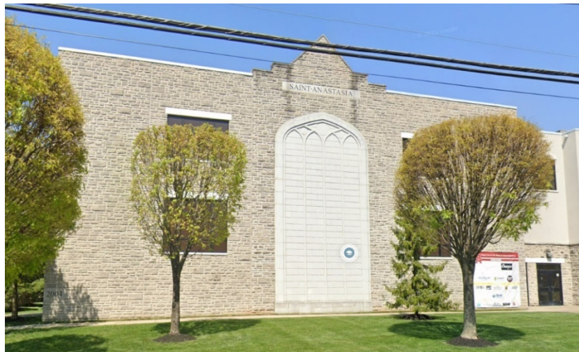
Figure 11: Portion of the 2004-built Saint Anastasia School.