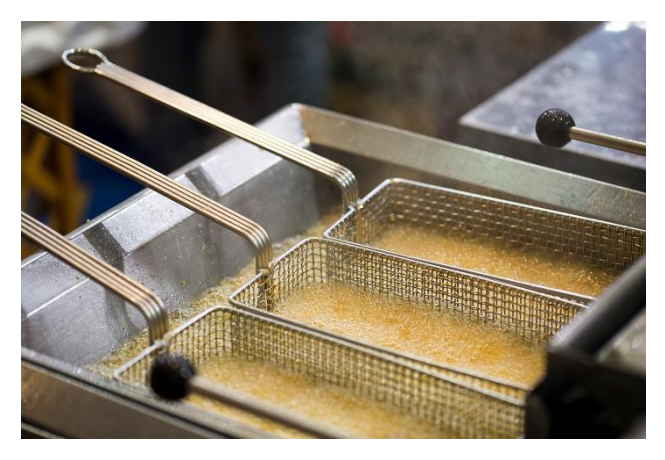
Must be ENERGY STAR certified