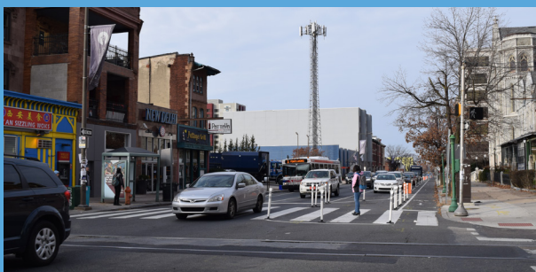
People walking have less exposure to moving vehicles. People driving have a defined driving space along Chestnut Street.

How did traffic safety change on Chestnut Street with the parking separated bikeway layout? This same layout is planned for Walnut Street.