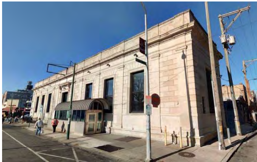
Figure 4: South elevation, looking northwest from Snyder Avenue.

The east elevation, which faces Watts Street, is one bay-wide, has flat limestone walls framed by rusticated pilasters supporting a cornice and parapet wall, and has a large central rectangular window flanked by three smaller rectangular windows (one to the south and two to the north). The central window is a non-historic double-hung aluminum unit behind an original iron security grate. The three smaller windows are also double-hung and each have original iron grates. Below the lower of the two smaller windows to the north of the central window is a hollow metal door.