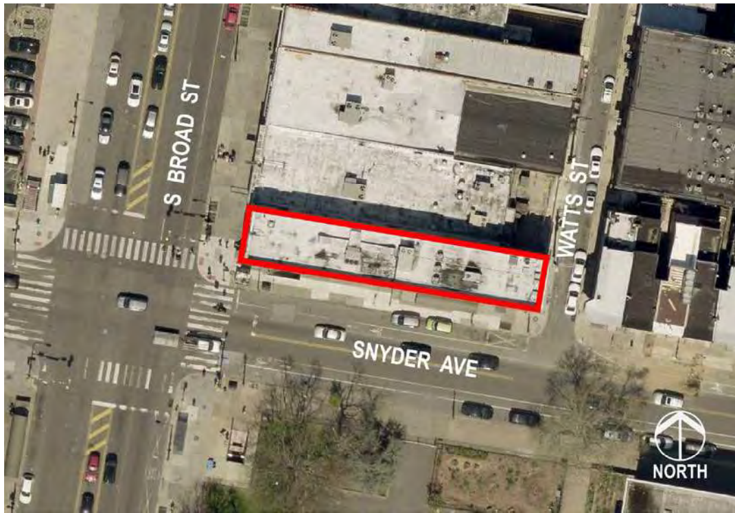
Boundary Map for 2037 S. Broad Street.

The property is located at the northeast corner of South Broad Street and Snyder Avenue, containing in front or breadth on the said Broad Street twenty-seven feet two and one-half inches and extending in length or depth eastward along the north side of Snyder Avenue one hundred and fifty feet to the west side of Watts Street.