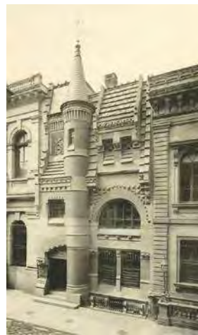
Figure 5 (left) - The Guarantee Trust Company at 316-20 Chestnut Street, designed by Frank Furness and built 1873-75. Demolished.