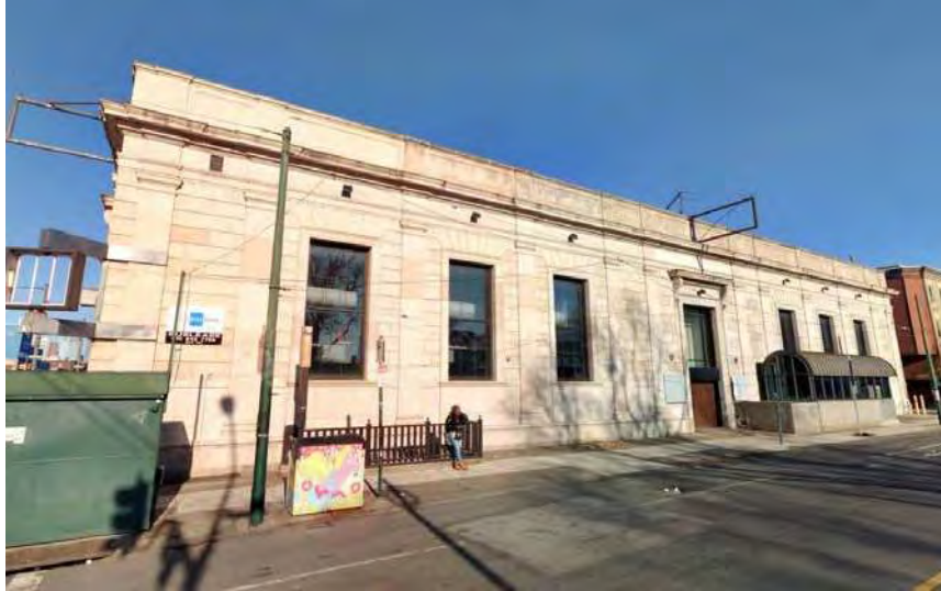
Figure 3: South elevation, looking northeast from Snyder Avenue.

sidelights rather than unglazed hollow metal doors. The three bays to the west and east of the entrance each contain non-historical, double-hung aluminum windows within architrave surrounds that sit atop a limestone water table. At the top of each window, there are modern vinyl awnings. Each window is framed by a pair of pilasters that support the cornice and parapet wall above.