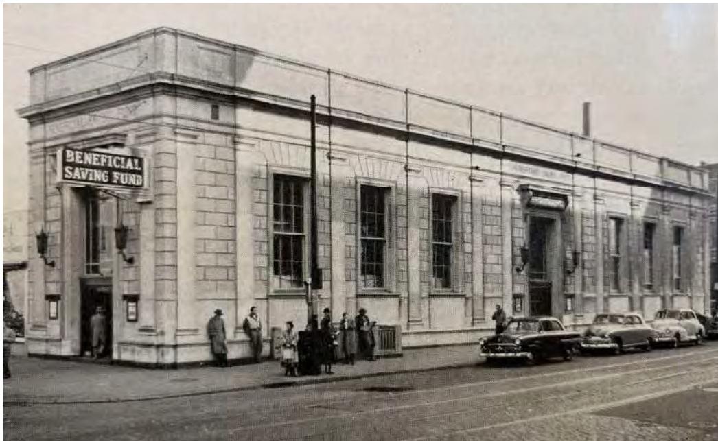
Figure 15 - The Beneficial Saving Fund Society, South Philadelphia Branch at 2037 S. Broad Street, designed by the firm of Horace Trumbauer and built in 1928 (from One Hundred Beneficial Years, 1853-1953 ).