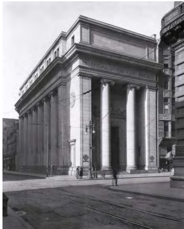
Figure 2 - The new Beneficial Saving Fund Society building as designed by the firm of Horace Trumbauer and completed in 1918.

small, three-story home and replaced it with a four-story building designed by leading Catholic architect Edwin Forrest Durang in a High Victorian version of the Renaissance Revival style ( Figure 1 ). And in 1887, after having acquired the adjacent property at 1202 Chestnut Street in 1885, Beneficial built a 6-story addition and added two stories, including a mansard roof, to the 1880 building to create a unified though overbearing whole ( Figure 1 ). 4 Much of this building was devoted to tenant office space, with Beneficial occupying only a portion of the first floor. By 1915, this space had proven inadequate for the still growing business, and Beneficial began planning for a new building that year. The 1880/1887 building was subsequently demolished and replaced by the Classical Revival-style building, designed by the firm of Horace Trumbauer, that still exists at 12th and Chestnut today ( Figure 2 ). The building was completed in 1918.