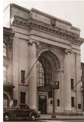
Figure 19 (right) - The Excelsior Trust Company at 1006 E. Lehigh Avenue, designed by the firm of Horace Trumbauer and built in 1925. Extant.