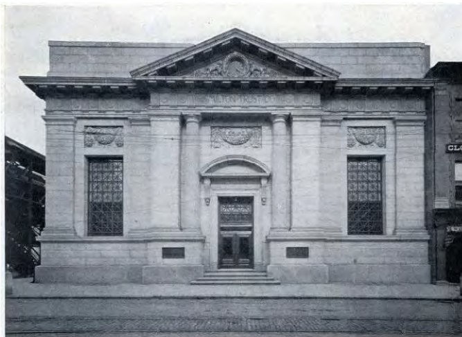
Figure 18 (left) - The Hamilton Trust Company at 40th and Market, designed by the firm of Horace Trumbauer and built 1906-07. Demolished.