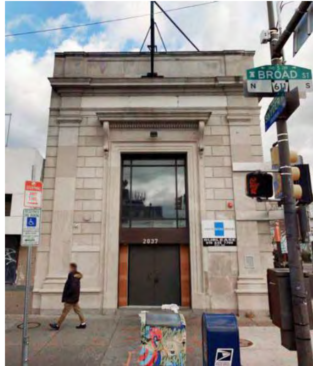
Figure 2 (right): West elevation, looking east from Broad Street.

The south elevation, which faces Snyder Avenue, is similar in treatment to the west elevation, with rusticated limestone walls and Doric order pilasters between the bays and at each end of the building. At seven bays-wide, however, the south elevation is much longer than the west elevation. The center bay contains an entrance with an architrave surround matching the one on Broad Street and is also framed by pilasters, but it has an aluminum-framed glass door with