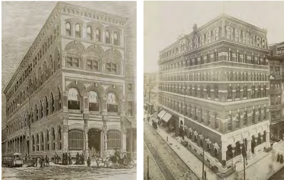
Figure 1 - The Beneficial Saving Fund Society building as it appeared in 1880, and after the 1887 additions and alterations (Free Library of Philadelphia).

Similar to the Philadelphia Savings Fund Society, which was founded in 1816 as the first mutual savings bank in the United States, Beneficial "assisted people of modest means in achieving long-term financial goals by promoting habits of systematic savings and mutual cooperation," in the words of historian David L. Mason. 2 Beneficial's customers, Mason continues, "made weekly or monthly deposits that the managers accumulated and invested for their benefit," typically in "low-risk securities like government bonds in order to preserve capital and earn steady income." Following its opening in 1854, the Beneficial Saving Fund Society quickly became one of the leading banks among Philadelphia's immigrant and working-class communities, attracting hundreds of customers in its first decade. At the end of its first year of business, Beneficial reported deposits of about $60,000. Ten years later deposits had grown more than five-fold to $307,000, and this figure would double about every ten years for the next half century. 3