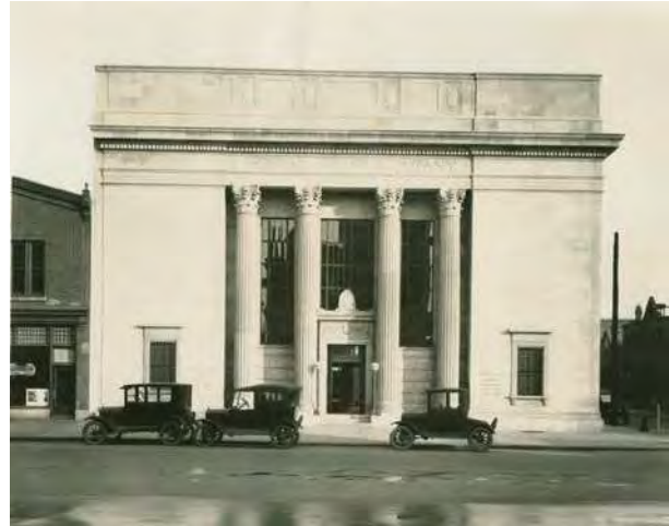
Figure 12 (left) - The Northwestern National Bank at North Broad Street and Fairmount Avenue, designed by Philip Merz and built 1917-18 (Indiana University Bloomington). Extant.