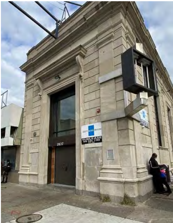
Figure 1 (left): West and south elevations, looking northeast from Broad and Snyder (photo by Eve Miller).

The bank is a long, rectangular building with the narrow end fronting on Broad Street. On this side, the west elevation, which is one bay-wide, the building has walls of rusticated limestone and is framed by two tall, Tuscan order pilasters that support a cornice and parapet wall above. Between the pilasters, there is a tall door and window opening with an architrave surround topped by a denticulated cornice with corbels at each end. The lower part of the opening currently contains non-historic, unglazed, hollow metal double doors with wood-grained metal panels on the sides. Above the doors, there is a wide aluminum transom bar and a large, multi-light metal window.