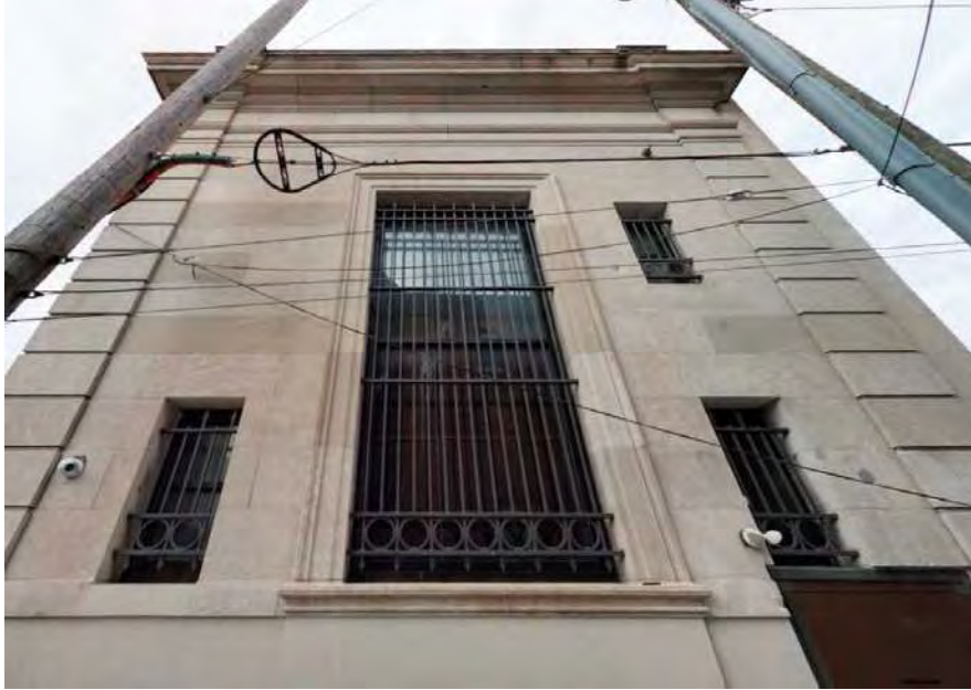
Figure 5: East elevation, looking west from Watts Street.

On the north elevation, the bank abuts an adjacent one-story building that fronts on Broad Street. Above the one-story building, the north elevation of the bank has stucco walls except at the easternmost end, where the walls are red brick and have slightly projecting piers.