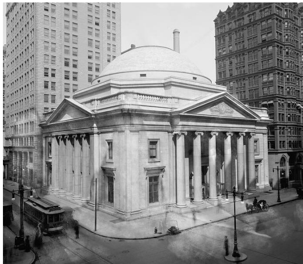
Figure 9 - The Girard Trust Company at Broad and Chestnut Streets, designed by Furness & Evans with McKim, Mead & White and built in 1907. Extant.

As the third largest city in the United States and a major financial center, Philadelphia would witness a wealth of bank construction between about 1900 and 1930. During this period, both the