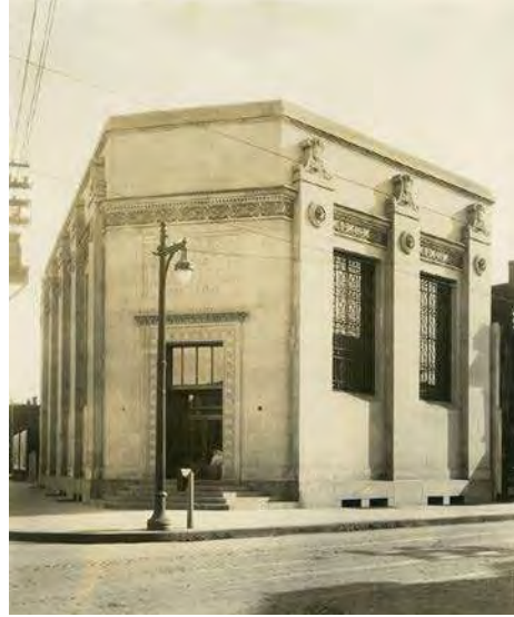
Figure 16 (left) - The Integrity Trust Company at 719 Chestnut Street, designed by Paul Cret and built 1927-29. Extant.