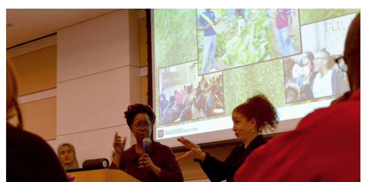
With an American Sign Language translator, the planning team presented the Plan's historical context and data review