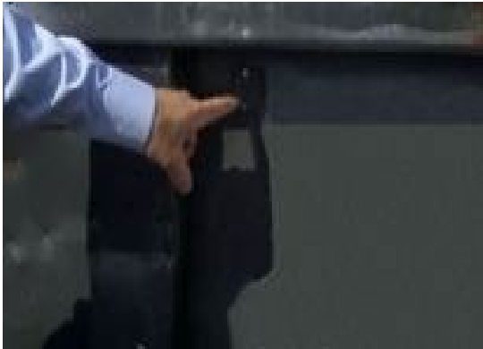
<20 cu. yd. construction dumpster