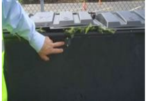
6 cu. yd. front load dumpster