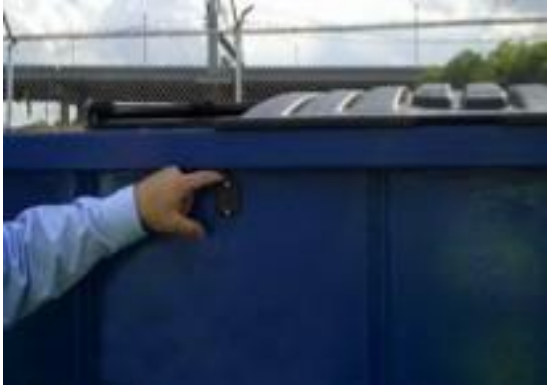
1 cu. yd. dumpster