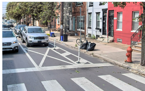
(Example) 22nd Street

1/2 Mile of parking separated bike lanes will be installed with an additional 1/2 Mile of green painted conventional bike lane.