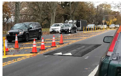
(Example) Cobbs Creek

4th to 11th includes Corner Wedges and Speed Slots to slow traffic and protect pedestrians. Nearby 5th and 12th Streets include Speed Cushions.