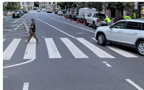
(Example) Market at 16th Street

Shorter crossing distances improve pedestrian safety on blocks designed with 3 or 4 vehicle lanes.