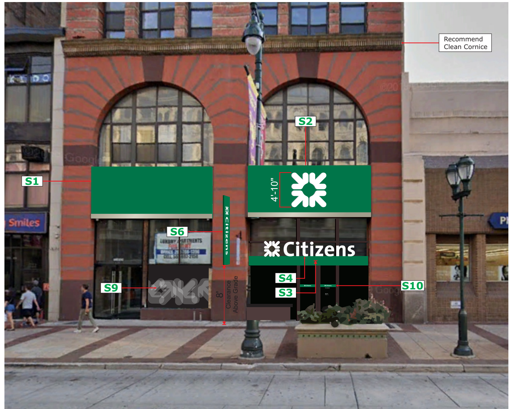
Approx. Scale: 3/32"=1'-0"