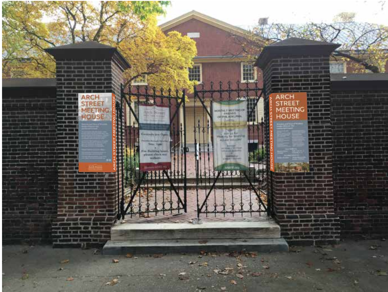
Main panels are 24" wide x 58" high. Side panels are 4" wide x 58" high.