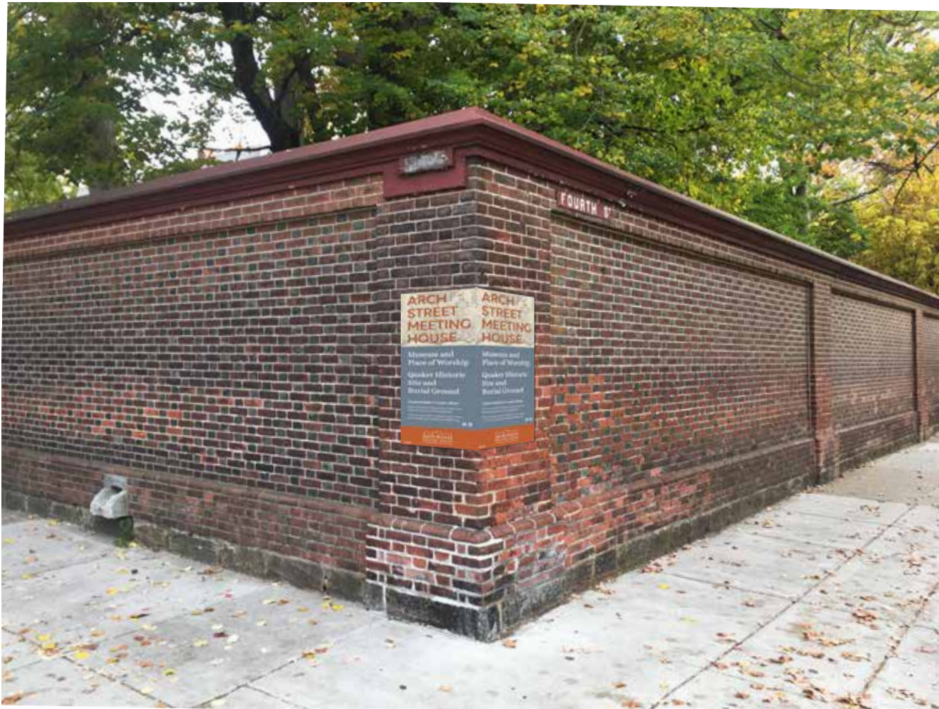
Panels are 24" wide x 58" high.