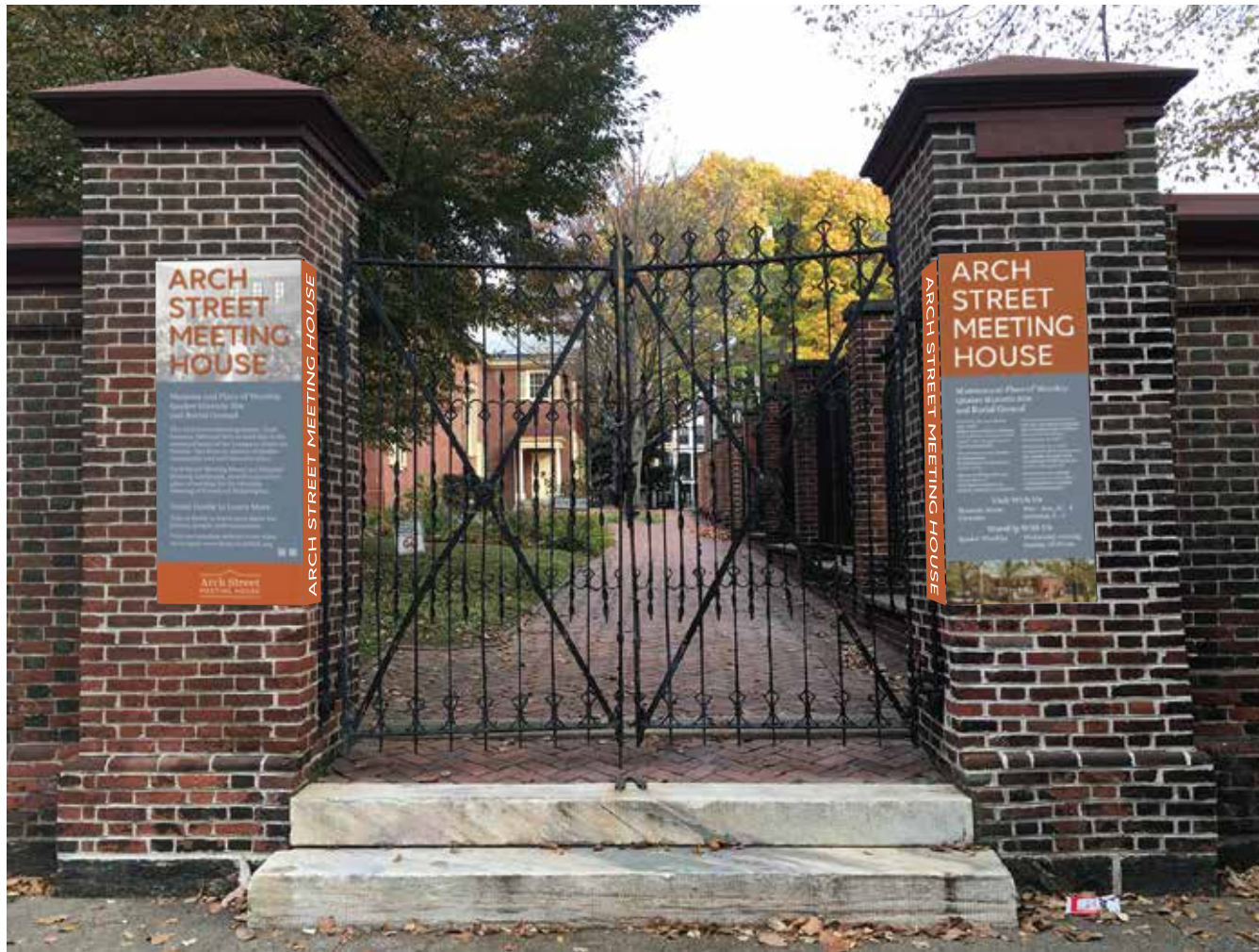
Main panels are 24" wide x 58" high. Side panels are 4" wide x 58" high.