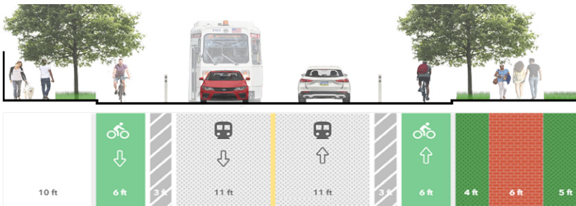
Woodland Ave between Chester Ave and 40th St Trolley Portal