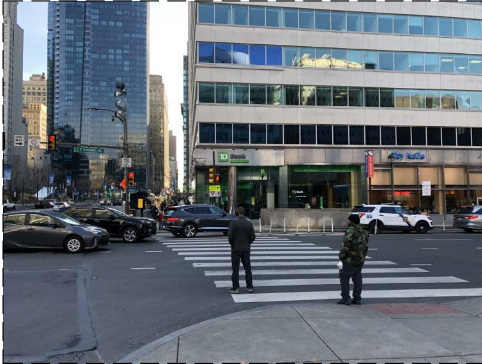
MAIN ENTRANCE FROM ACROSS THE STREET