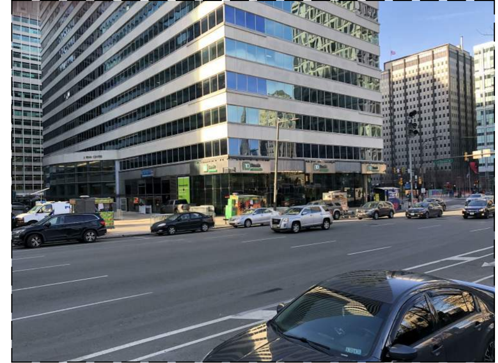
15TH ST LOOKING NORTHWEST