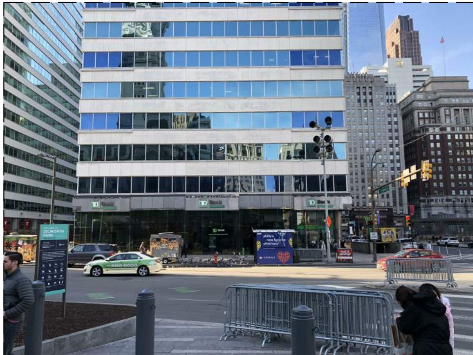
15TH ST LOOKING WEST