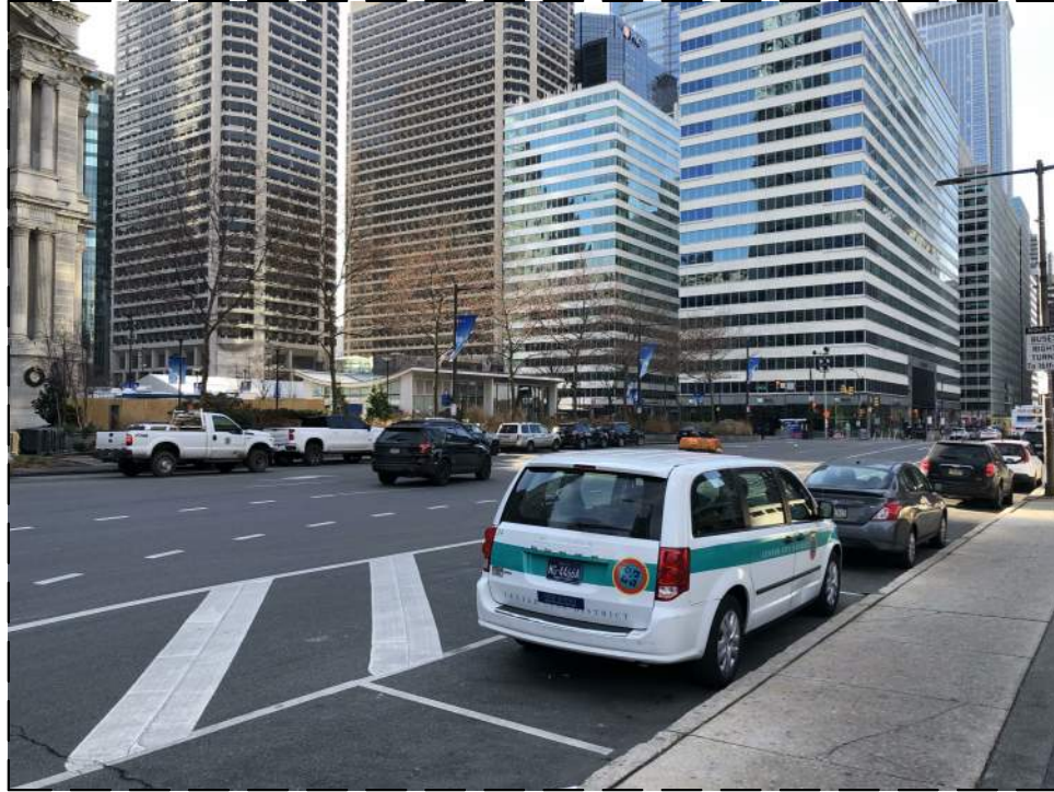
JFK BLVD LOOKING WEST