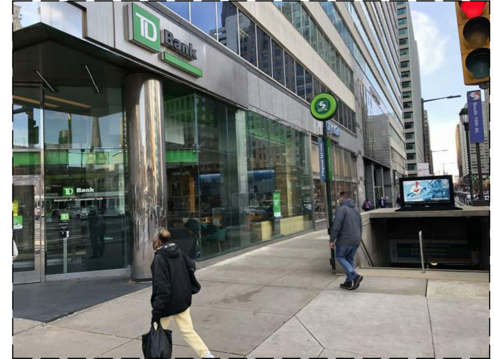
JFK BLVD FACADE/ELEVATION