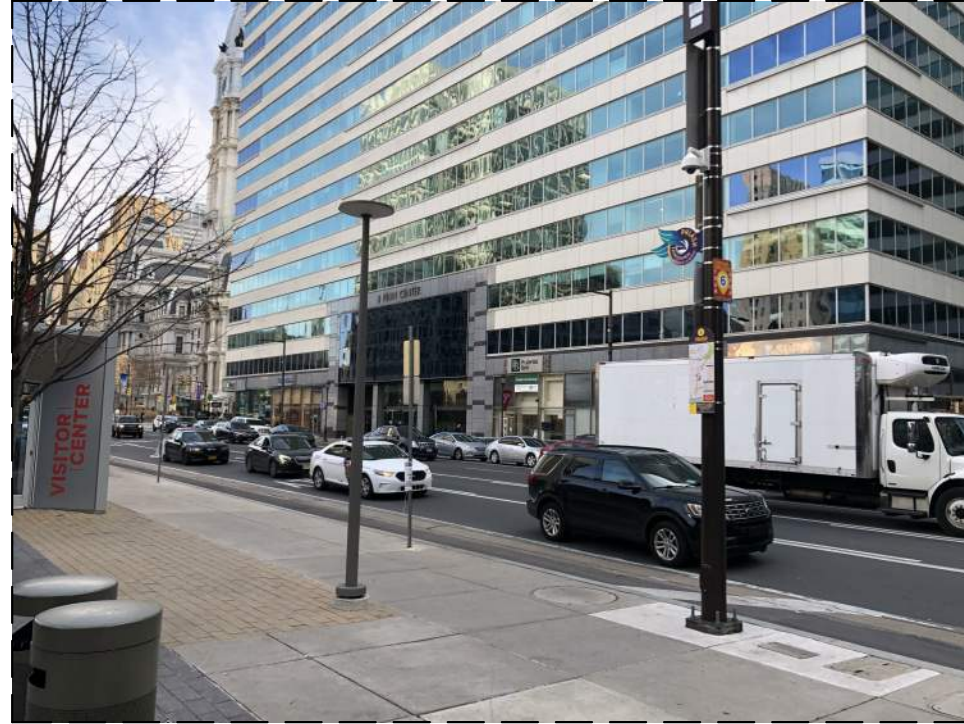
JFK BLVD LOOKING EAST