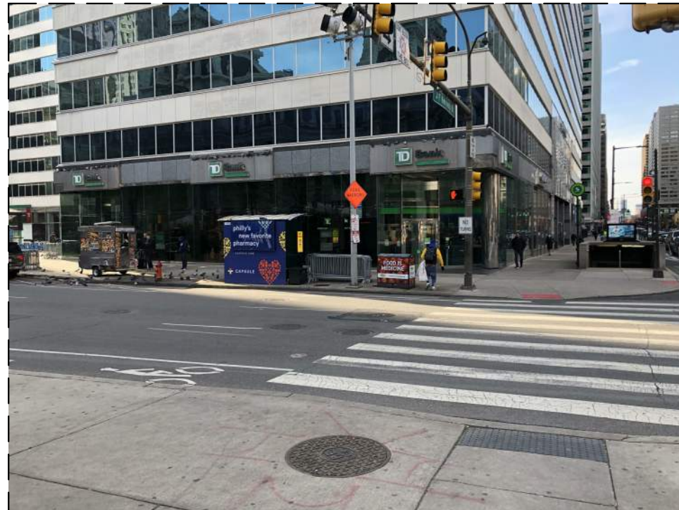
15TH ST LOOKING SOUTHWEST