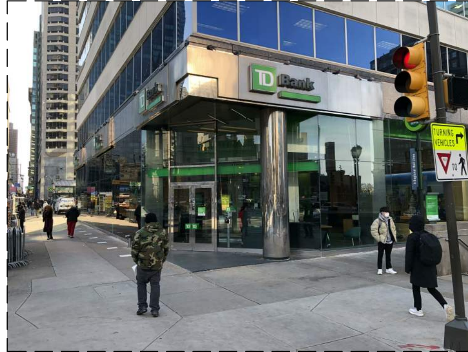
MAIN ENTRANCE SIGNAGE