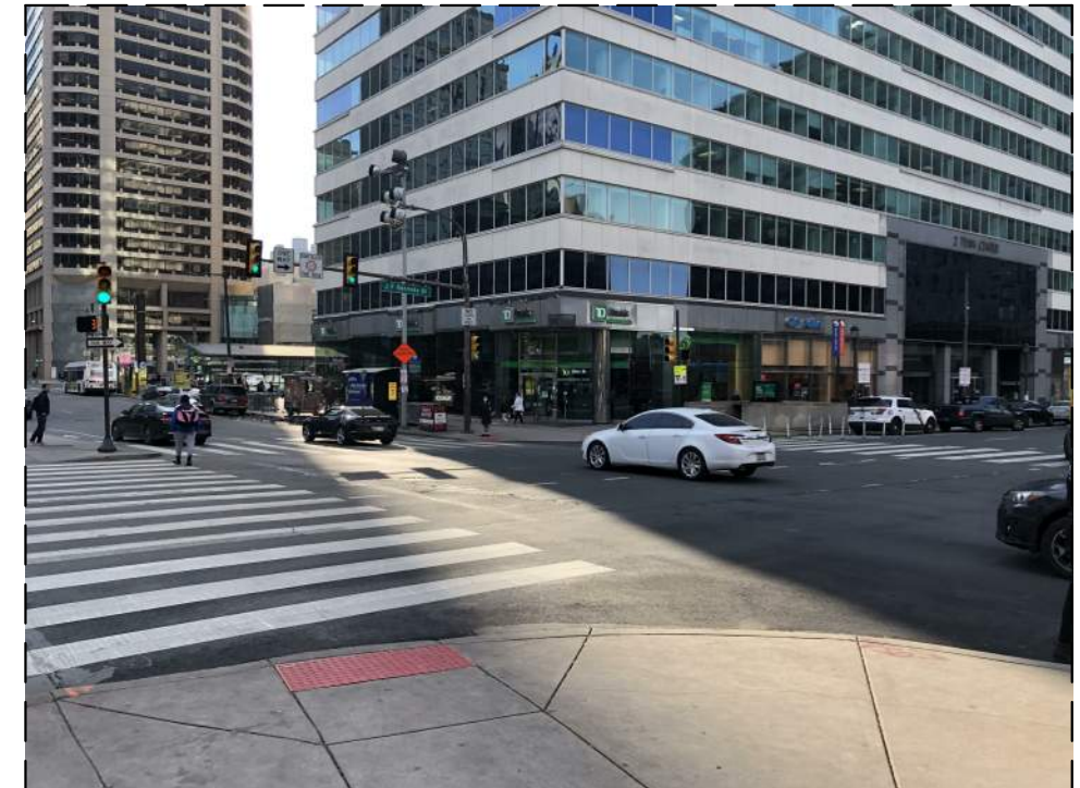
CORNER OF 15TH ST & JFK BLVD