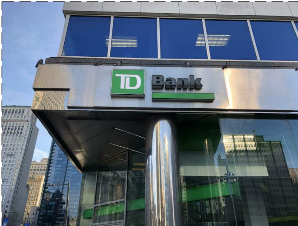
TYPICAL EXISTING BUILDING SIGN