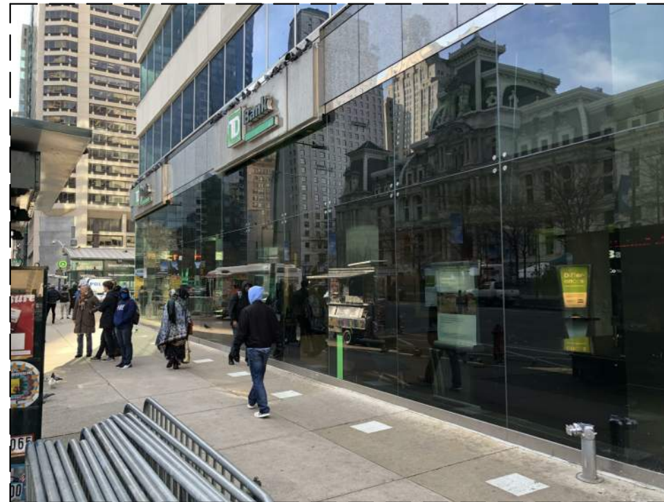
15TH ST FACADE/ELEVATION