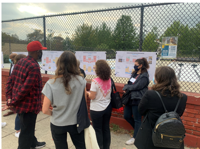
Kingsessing Library Community Event