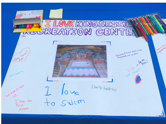
Children show their love for Kingsessing Recreation Center & Library

Rebuild is actively engaging with communities at 42 different sites. The Rebuild process engages the community and empowers their voice during the design of improvements. While these community-led designs are underway, Rebuild also takes care of immediate needs with interim improvements. Rebuild dollars have created renewed playgrounds, sidewalks, windows, lighting, roof replacements, spray grounds, fields and more.