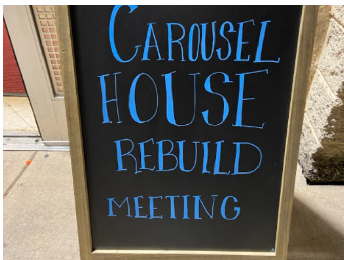
Carousel House Rebuild Community Engagement Event