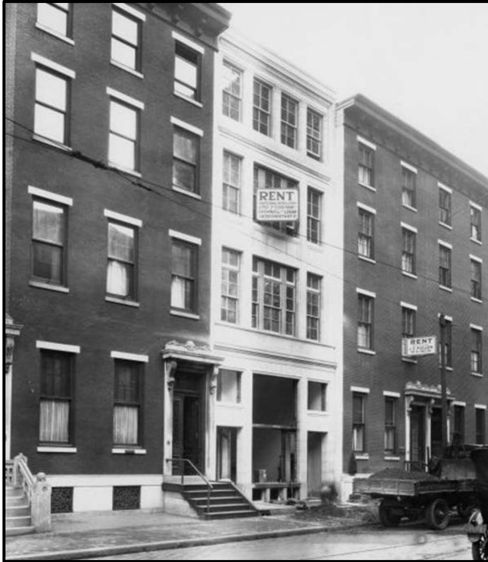
Figure 13. The primary (south) elevation of Shimwell & Logan on December 14, 1921, nearing the time of its completion.