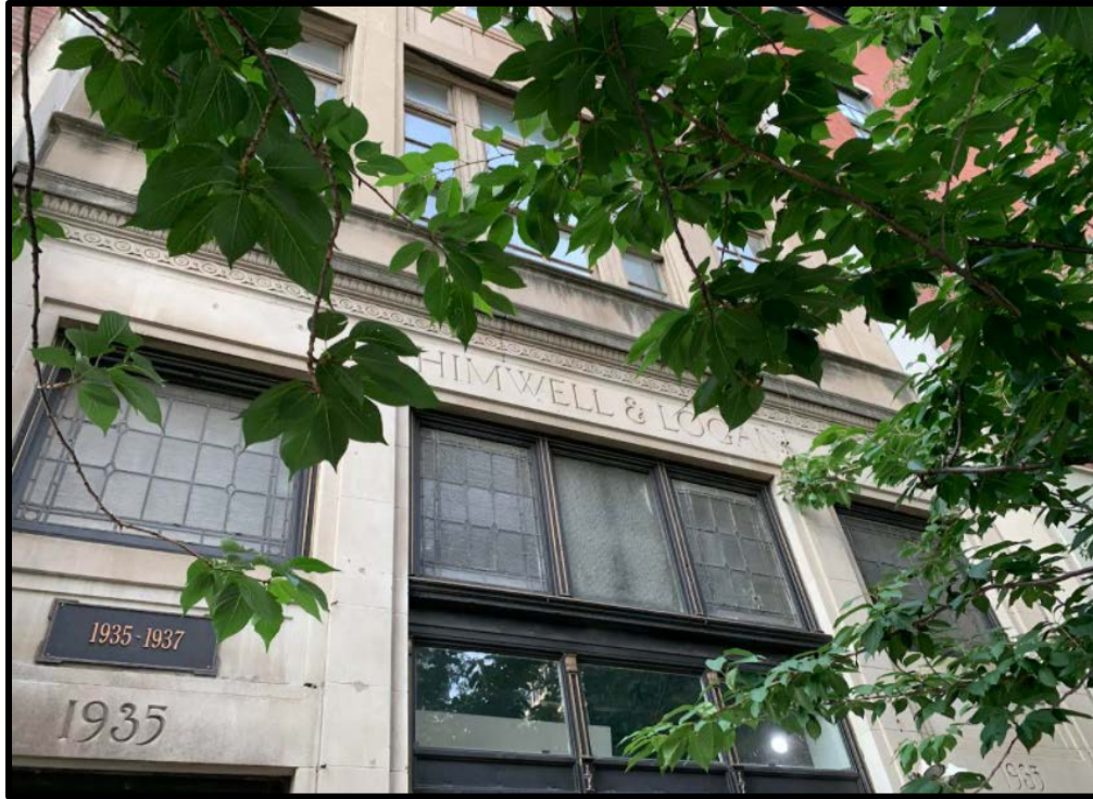
Figure 4. Looking upward at the primary (south) elevation, showing the leaded glass windows in the transom of the first floor and the banner, reading “SHIMWELL & LOGAN.”