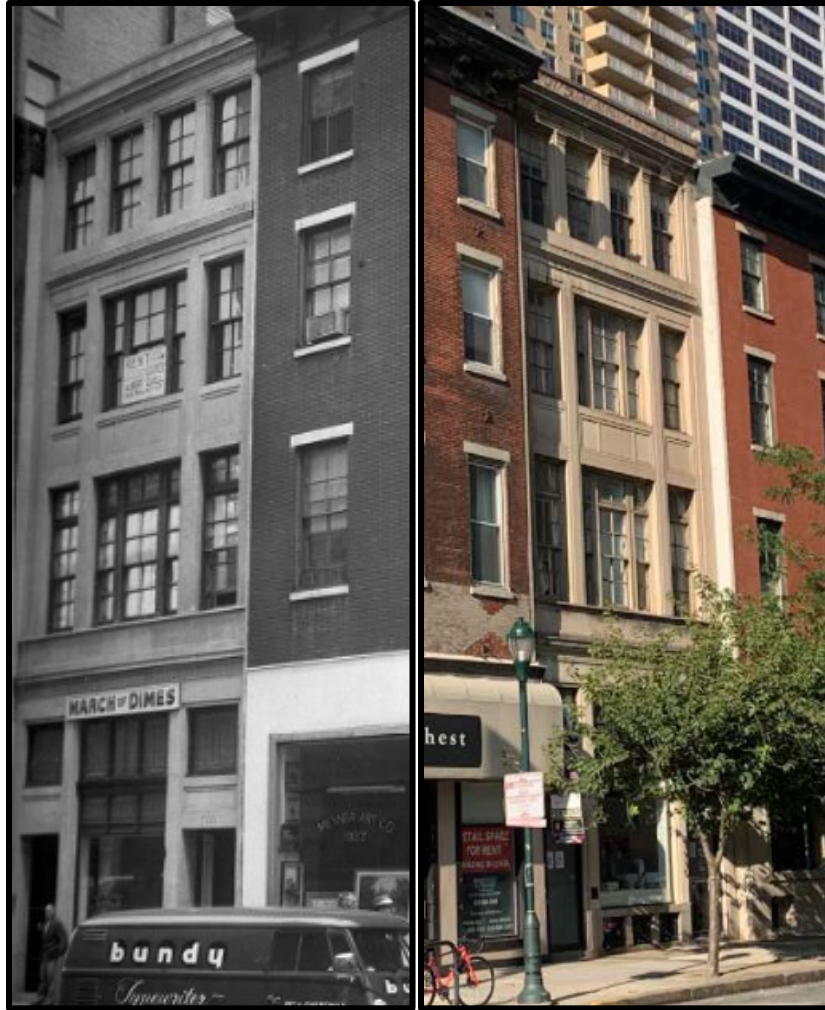
Figure 7. Left: A vintage photograph showing the subject property when it was in use as the March of Dimes. Figure 8. Right: Looking northeast at the subject property.