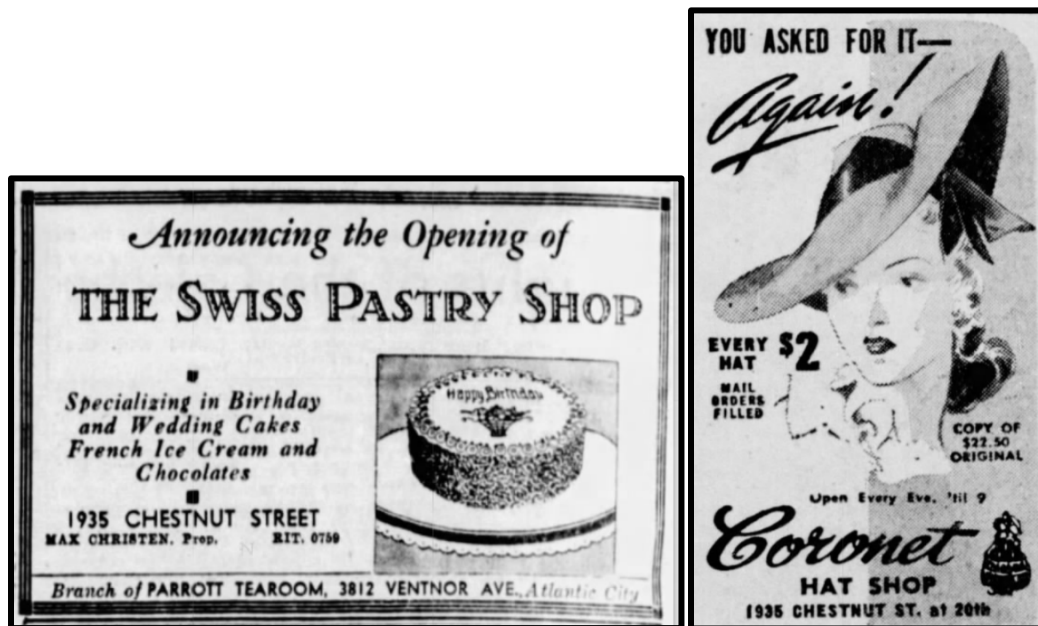
Figure 11. Left: An advertisement for The Swiss Pastry Shop at 1935 Chestnut Street in 1934. Figure 12. Right: An advertisement for the Coronet Hat Shop at 1935 Chestnut Street.

just six years after it was purchased, then being assessed at $105,000. 5 Shimwell & Logan operated for many years afterwards, outliving each of its founders. 6