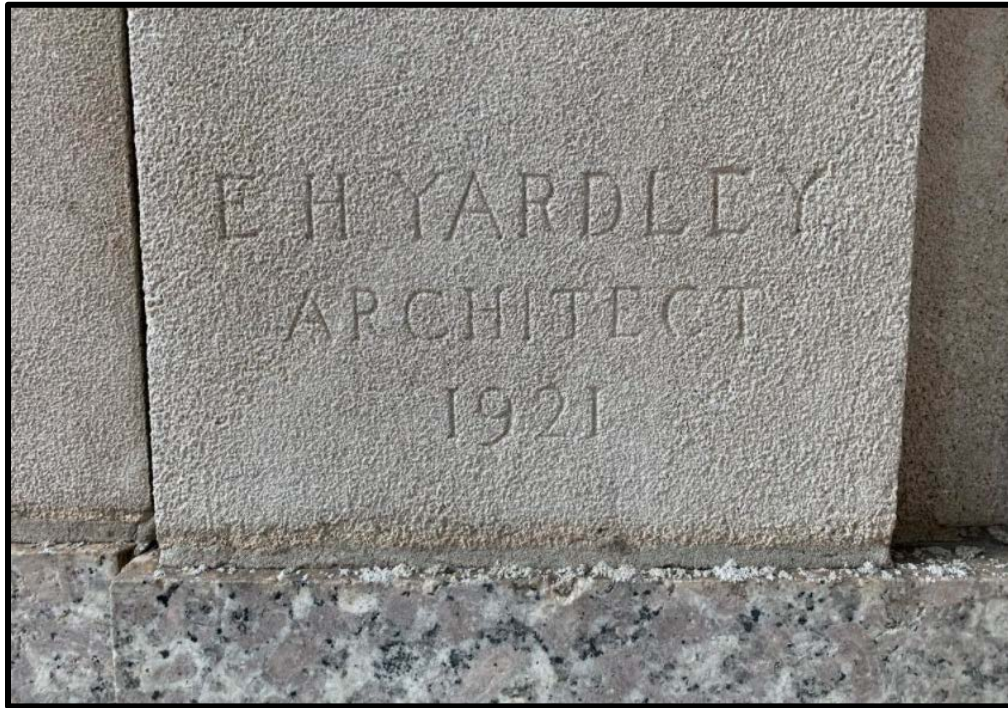
Figure 6. A view of the cornerstone or architect's reference at the base of the building on the easterly side of the primary (south) elevation.

delineated by limestone pilasters with simple capitols. A cornice rises above the fourth floor and is comprised of several traditional, but restrained moldings. The building features a flat roof.