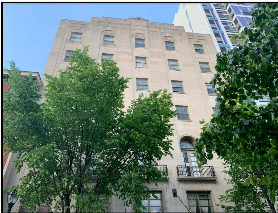
Figure 16. The Modern Classical façade of the Stephen Girard Hotel at 2025-27 Chestnut Street.

unduly influenced by the shift in social norms and expectations. 17 Not far from Freeman's new auction house, The Roosevelt, a large hotel at 2025-29 Chestnut Street, was remodeled, upgraded and became the Stephen Girard Hotel. 18 A definite product of Modern Classicism, the building features a smooth-faced limestone façade, restrained classical details, and other elements of the style. Extant to-date, it speaks to the shift that had occurred in the employment of the Modern Classical style.