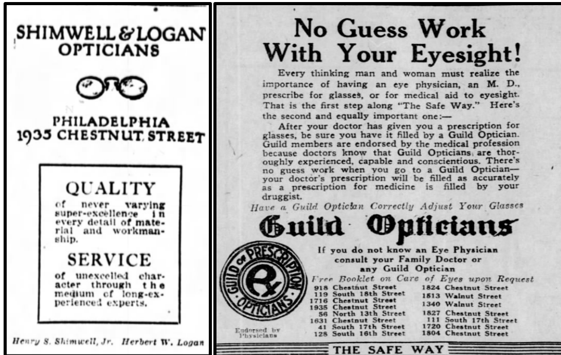
Figure 9. Left: An advertisement for Shimwell & Logan at 1935 Chestnut Street in 1922. Source: Evening Public Ledger , 24 April 1922, 24. Figure 10. Right: Advertisement for Guild Opticians, including 1935 Chestnut Street in 1925. Source: The Philadelphia Inquirer , 23 April 1925, 14.