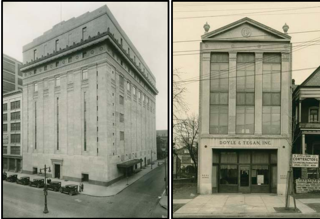
Buildings in Philadelphia with designed influence of Modern Classicism. Figure 19. Left: Built in 1927, The Masonic Temple (Demolished) at Broad and Race Streets in Philadelphia, designed by Horace W. Carter. Figure 20. Right: The Doyle & Tegan Building (1924) at 5909 N. Broad Street in Philadelphia, designed by Architects, Gleeson, Mulrooney & Burke.