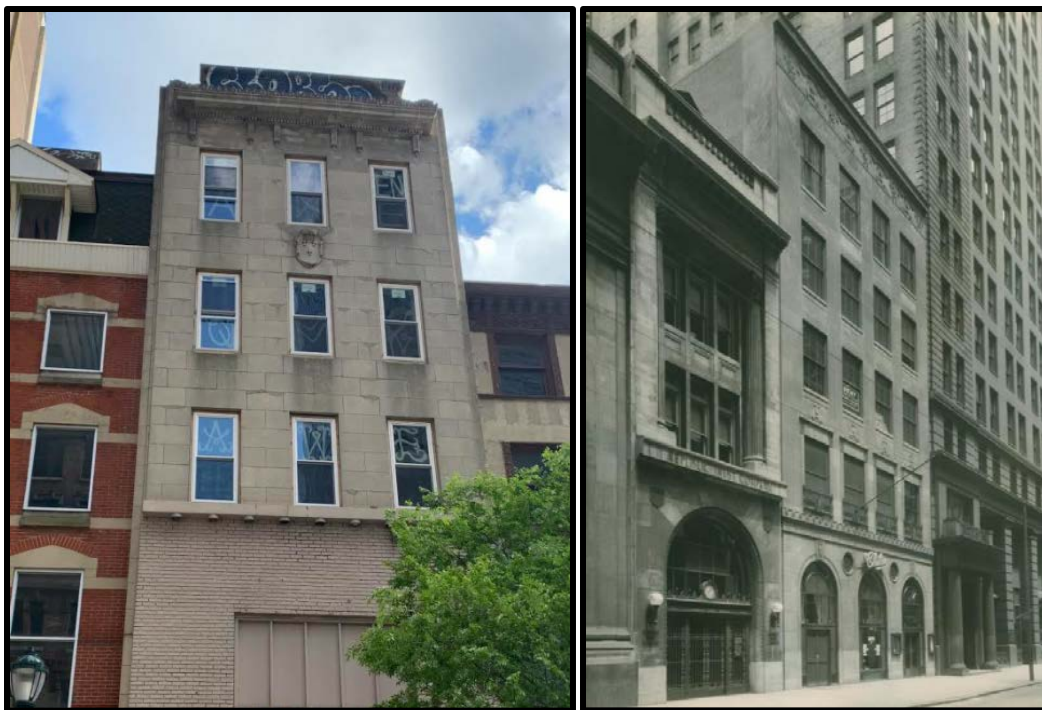
Two examples of Modern Classicism on Chestnut Street. Figure 17. Left: the Becker Store (1929) at 1516 Chestnut Street, designed by Alvin Chester Bieber, Architect. Figure 18. Right: Child's Restaurant Building (Demolished), 1425-27 Chestnut Street (ca.1926/Demolished), designed by Dennison & Hiron, Architects.

The application of Modern Classicism was employed in several other nearby buildings, including the 1425-27 Chestnut Street (ca.1926/Demolished), designed by Dennison & Hiron; the Becker Store (1929) at 1516 Chestnut Street, designed by Alvin Chester Bieber; the building at 1807 Chestnut Street; the Mills Building (ca.1929) at 1909 Chestnut Street, designed by Mills & Van Kirk; The J.E. Limeburner Co. Store (1925) at 1923 Chestnut Street, designed by Heacock & Hokanson; etc. 20