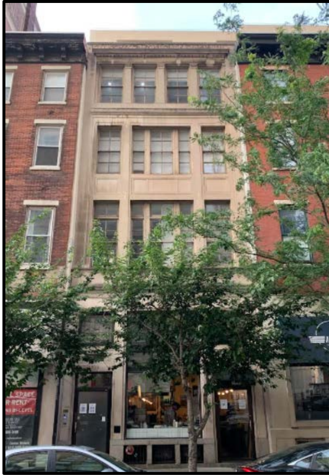
Figure 3. The primary (south) elevation.