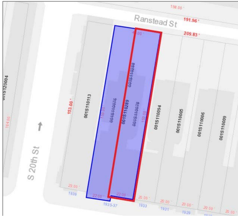
Figure 2. The proposed historic designation is for 1935 Chestnut Street only. The legal parcel is known as 1935-37 Chestnut Street (shown in blue above). The legal parcel includes two buildings: 1935 Chestnut Street and 1937 Chestnut Street. The boundary for the subject property, 1935 Chestnut Street, is delineated by the red line within the larger parcel.