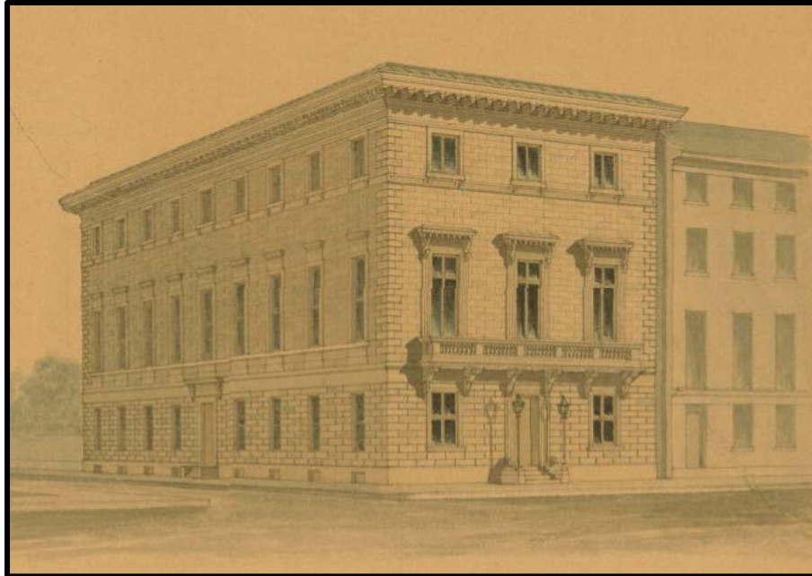
Figure 14. The Athenaeum of Philadelphia.

Commercial, institutional, and public establishments also asserted, reinforced, and/or solidified their integrity and significance through the inherent monumentality of the Classical-inspired buildings that they commissioned. After all, the country's first Palazzo was built between 1845 and 1847 at 219-21 South Sixth Street on Washington Square for the Athenaeum of Philadelphia. Known as "America's oldest subscription library," the National Historic Landmark was designed by the eminent Philadelphia architect John Notman. 14 After hundreds of other buildings were designed and constructed in the Italian Renaissance style all across the city following the Athenaeum of Philadelphia, the Palazzo style culminated in the impressive and striking five-story edifice at 1435-41 Walnut Street, a high style Italianate Renaissance pile commissioned by Drexel & Company in 1925-28. The building was designed by Day & Klauder, Architects, and built by Doyle & Company. 15 Both of these examples are corner buildings, while many more of Philadelphia's Palazzos stood in a row with other attached buildings.