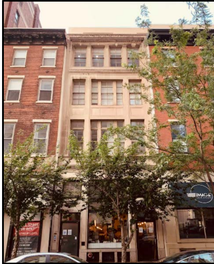
Figure 1. The primary (south) elevation.