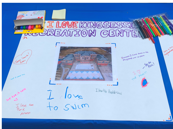
Children show their love for Kingsessing Recreation Center & Library

Rebuild is actively engaging with communities at 42 different sites. The Rebuild process engages the community and empowers their voice during the design of improvements. While these community-led designs are underway, Rebuild also takes care of immediate needs with interim improvements. Rebuild dollars have created renewed playgrounds, sidewalks, windows, lighting, roof replacements, spray grounds, fields and more.