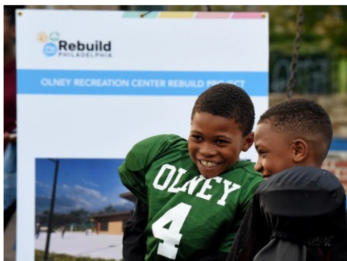
Groundbreaking celebration at Olney Recreation Center