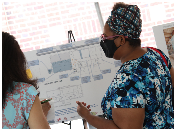
Community Engagement at Paschalville Library