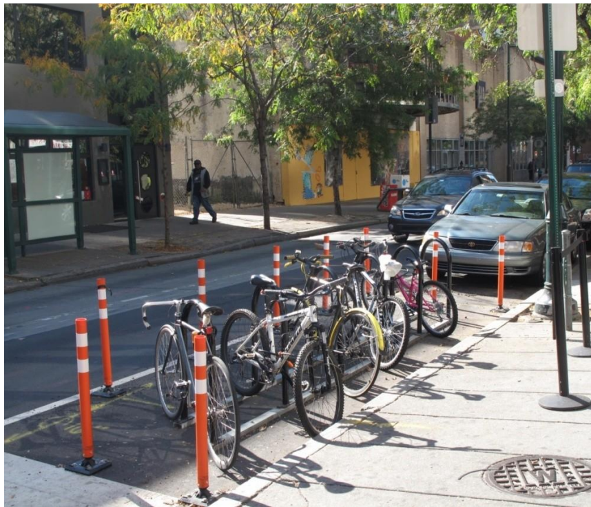
Bicycle corral at 19 th & Chestnut

To receive a Pedestrian Enhancement Permit, submit an application demonstrating consistency with the guidelines established in this document regarding placement, design, maintenance, and operations.