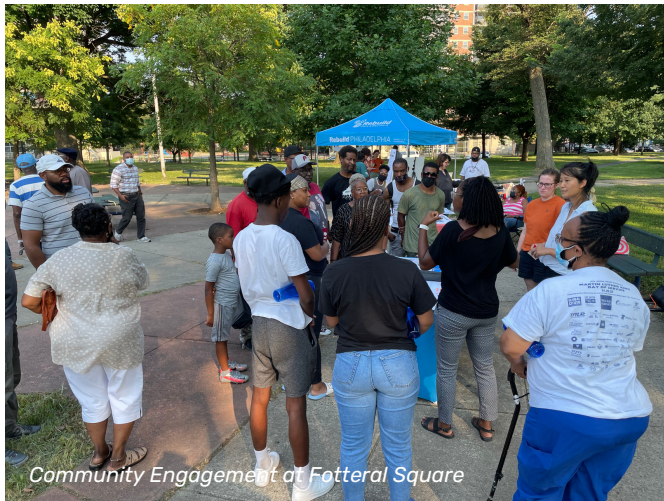
Community Engagement at Fottal Square