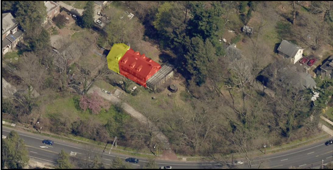
Looking northeast at the primary elevation and grounds of the subject property. The portion of the house highlighted in red appears to have been built in 1902 and the portion highlighted in yellow in 1921.