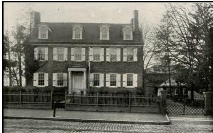
The Wachsmuth-Henry House at 4908-14 Germantown Avenue, Germantown is a historic house that started life c. 1760 and was substantially enlarged over time to appearance shown above. Despite best efforts c. 1819, the house is not quite symmetrical due to its seemingly endless evolution, yet it is where vernacular meets formality. The Nichols-Goehring House has four dormers much like the Wachsmuth-Henry House that are purposely placed, but not quite symmetrical.

Like the Kurtz-Barr House, the “Old Shoemaker Mansion,” formerly located on the east side of Germantown Avenue above E. Penn Street, later Shoemaker Lane, was a large house that was clearly expanded over time. 15 Reflecting a far more vernacular appearance than the subject house, the Old Shoemaker Mansion too justifies these linear Colonial Revival style dwellings that stray somewhat from symmetrical strictures of Georgian architecture. Also built over time, the Wachsmuth-Henry House at 4908 Germantown Avenue is another historic building that is relatable to the Nichols-Goehring House with its side gabled roof, and asymmetrical, yet somehow formal fenestration. Both houses feature four dormers within the primary elevation that are purposely placed, yet asymmetrical.