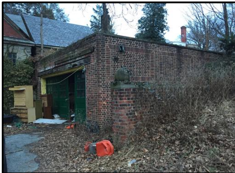
Looking northeast at the garage.

The side elevation at the north was not accessible nor was the rear elevation. However, aerial views shows that a creative Colonial Revival design was used in the design.