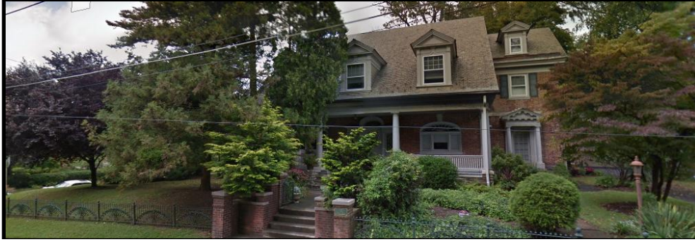
Red brick is less common in the German Township, but is used in the Colonial Revival style house at 6811 Mower Street at the northeast corner of Pelham Road and Mower Street.