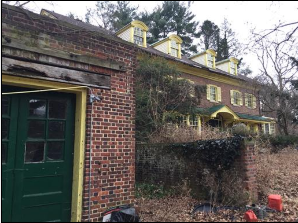
Looking south at the subject garage, a garden wall, and the house.