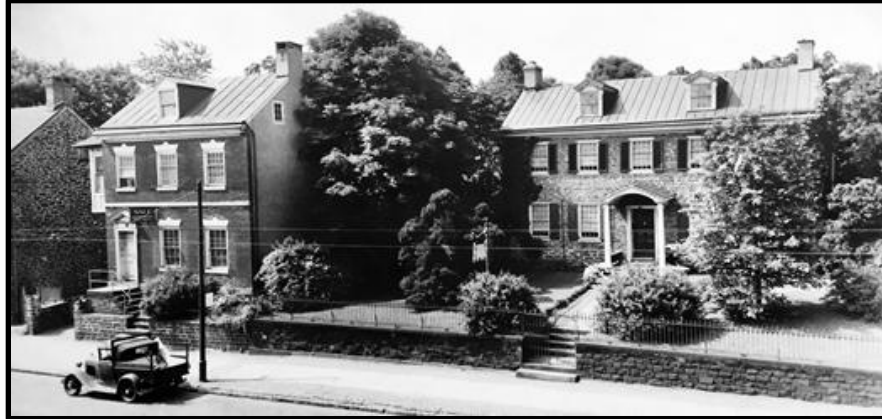
On left, the Baynton House at 5208 Germantown Avenue, c. 1798, features a red brick façade, less commonly seen on Germantown Avenue, while the more traditional Conyngham-Hacker House at 5214 Germantown Avenue features Wissahickon Schist.

The Nichols-Goehring House is a less usual design that exemplifies a period defined and even dominated by the Colonial Revival style in Philadelphia. Shown above, two formal houses, the Baynton House, c. 1798, and the Conyngham-Hacker House, c. 1796, both relate to the subject house. The Baynton House features a red brick façade like the Nichols-Goehring House, while the Conyngham-Hacker House is more relatable in scale, being, obviously, smaller and more symmetrical than the subject house. Both presumably dating to the late eighteenth century, these houses reflect Federal period design and its Georgian antecedents. The Nichols-Goehring House digs slightly deeper. Below is an image of the Barr House, formerly on the west side of Germantown Avenue at the present site of Chelten Avenue. 14 This ancient building, appearing as two houses, is definitely a building that grew over time. Perfect symmetry isn't always common in houses that evolve over time, and there is certainly a component of this in many of the designs used to create "modern Colonial" houses of the early twentieth century. The Philadelphia architect R. Brognard Okie, for example, would illustrate this tradition of evolution in his new Colonial Revival designs.