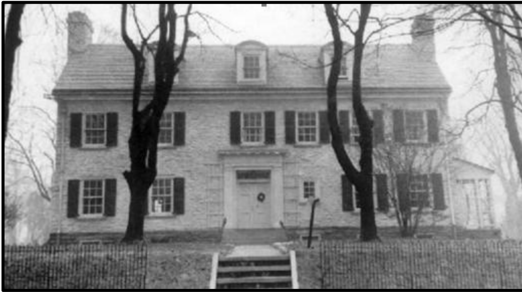
The Charles Wriggins House, Locust Avenue, Germantown, c. 1910s.