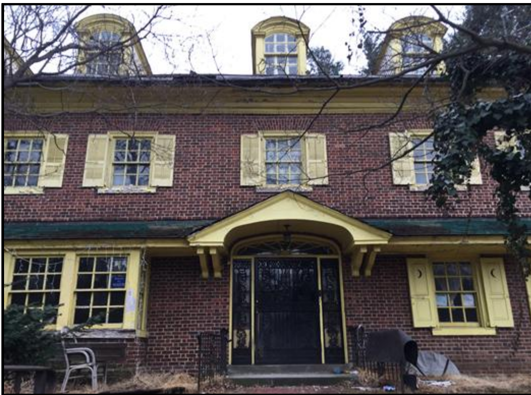
Looking southeast at the details of the primary elevation of the subject house.