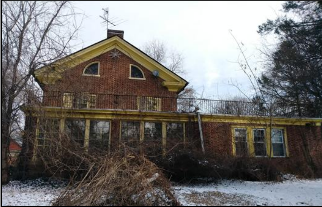
Looking northwest at the side elevation of the main block and the porch wing of the subject house.