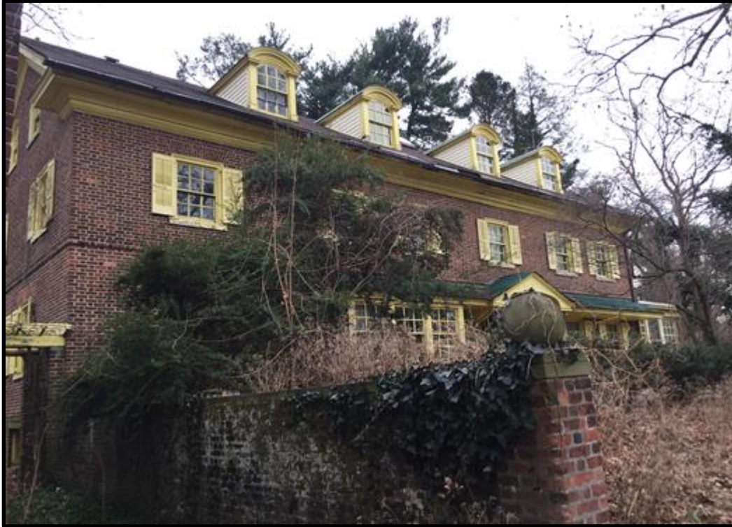
Looking southeast at the subject house.