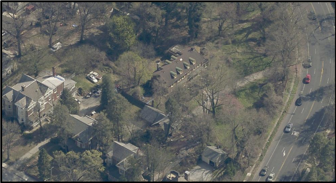
Looking southeast at the subject property.

The Nichols-Goehring House, later known as High Acres, at 6625 Lincoln Drive is a handsome and stately historic site comprised of a commodious Colonial Revival style dwelling; a Colonial Revival style garage; and 1.2-acre park-like setting of matured plantings. Elevated above Lincoln Drive, the buildings on the site are accessed by a gently curving driveway that begins near the center of the property’s Lincoln Drive frontage and is marked by two stone gate posts that anchor iron gates. The northerly post contains the address carved in stone: “6625.”