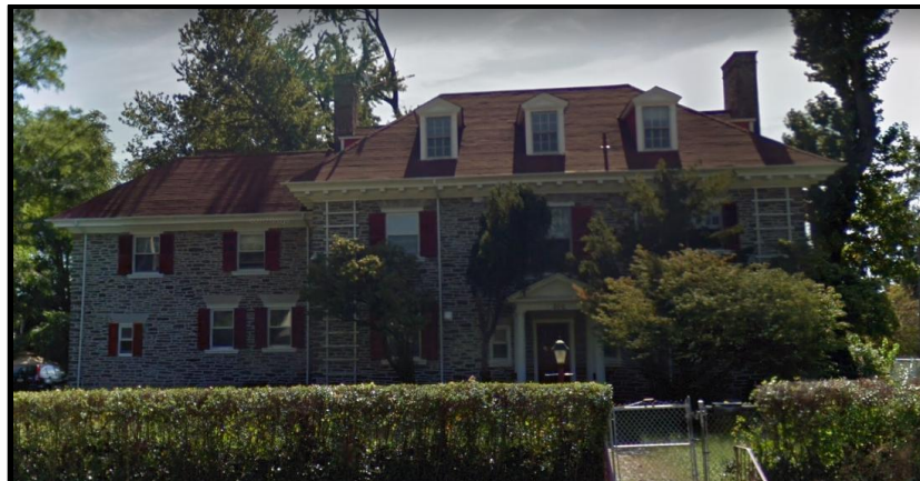
Located at the southeast corner of E. Johnson and Magnolia Streets in Germantown, the Cope House is a large, formal Colonial Revival style dwelling that was historic in inspiration, but distinctly modern at the time it was built.