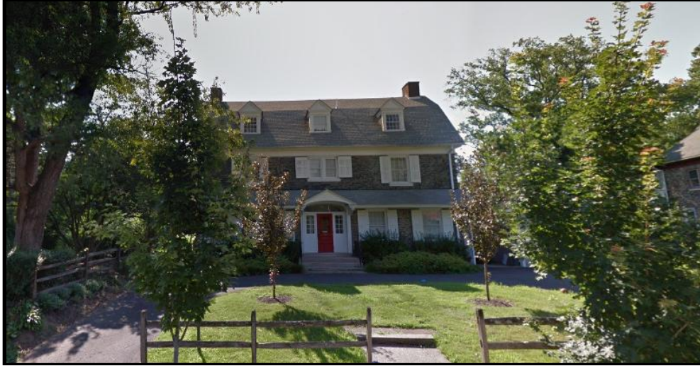
A Colonial Revival style house at 104 E. Cliveden Street, Germantown. Like the Nichols-Goehring House, this building features a similar pent eave and entrance porch, as well as a gracious doorway with an elliptical fanlight.