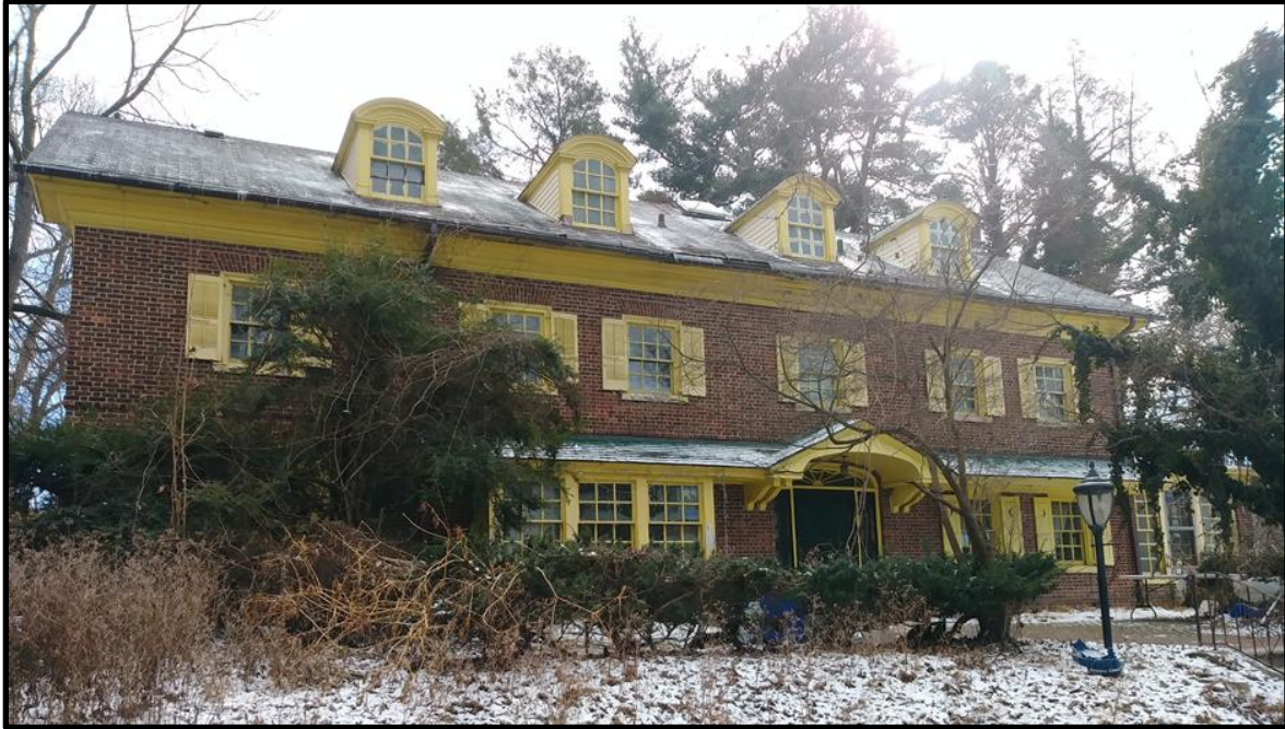
Looking southeast at the primary elevation of the subject house.