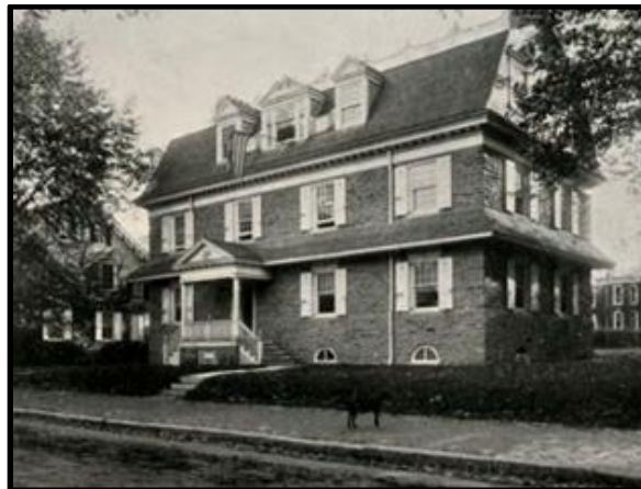
The Colonial Club once stood at the corner of Green Lane and Harvey Street in Germantown. This Colonial Revival style club house was designed as a distinctive building that fit into the suburban context of Germantown and, while it includes many features of the said style, it was a creative, unique work. The Nichols-Goehring House and the Colonial Club both included a pent roof, though the example shown above is more fully articulated.

The Nichols-Goehring House reflects the environment of suburban, residential architecture of the upper classes of Philadelphia in an era characterized by the Colonial Revival style. With innumerable historic, Colonial and Federal period examples that could be stylistically related to the characteristics of the subject house, the design represents a creative period in Colonial Revival design that created the “modern Colonial,” borrowing from the past in both design and material composition, while also creating a distinct and often unique design. Throughout Philadelphia, the larger region and even nationally the taste for the Colonial Revival influenced domestic architecture, and the subject house exemplifies this period of architectural design and its influence on suburban dwellings.