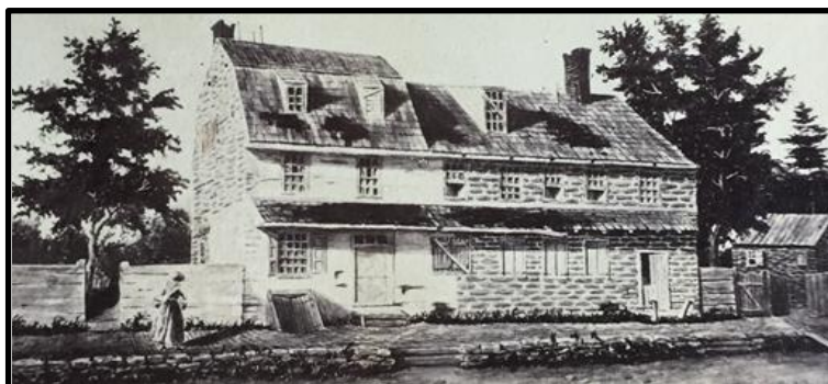
Likely by Charles J. Wister, this drawing shows the Kurtz-Barr House, formerly in the 5700 Block of Germantown Avenue, now the site of W. Chelten Avenue, in Germantown.

The Nichols-Goehring House is a less usual design that exemplifies a period defined and even dominated by the Colonial Revival style in Philadelphia. Shown above, two formal houses, the Baynton House, c. 1798, and the Conyngham-Hacker House, c. 1796, both relate to the subject house. The Baynton House features a red brick façade like the Nichols-Goehring House, while the Conyngham-Hacker House is more relatable in scale, being, obviously, smaller and more symmetrical than the subject house. Both presumably dating to the late eighteenth century, these houses reflect Federal period design and its Georgian antecedents. The Nichols-Goehring House digs slightly deeper. Below is an image of the Barr House, formerly on the west side of Germantown Avenue at the present site of Chelten Avenue. 14 This ancient building, appearing as two houses, is definitely a building that grew over time. Perfect symmetry isn't always common in houses that evolve over time, and there is certainly a component of this in many of the designs used to create "modern Colonial" houses of the early twentieth century. The Philadelphia architect R. Brognard Okie, for example, would illustrate this tradition of evolution in his new Colonial Revival designs.