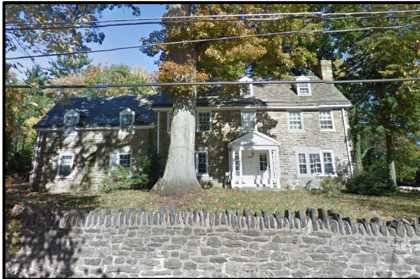
Another large Colonial Revival style in the 5300 block of Magnolia Street shares similarities to the subject property and yet is markedly different. Like the Nichols-Goehring House, this building rambles in a semi-formal fashion.