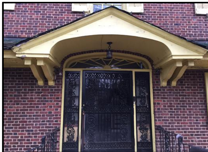
Looking southeast at the entrance to the subject house.

Common Building Type. The style guide also calls out “houses” or residences as a common building type designed in the Colonial Revival style. The subject property is distinctive of an era in Philadelphia and beyond that was defined by large suburban houses like the subject property that were “modern,” but designed in the “Colonial” style, which persisted through the first half of the twentieth century.