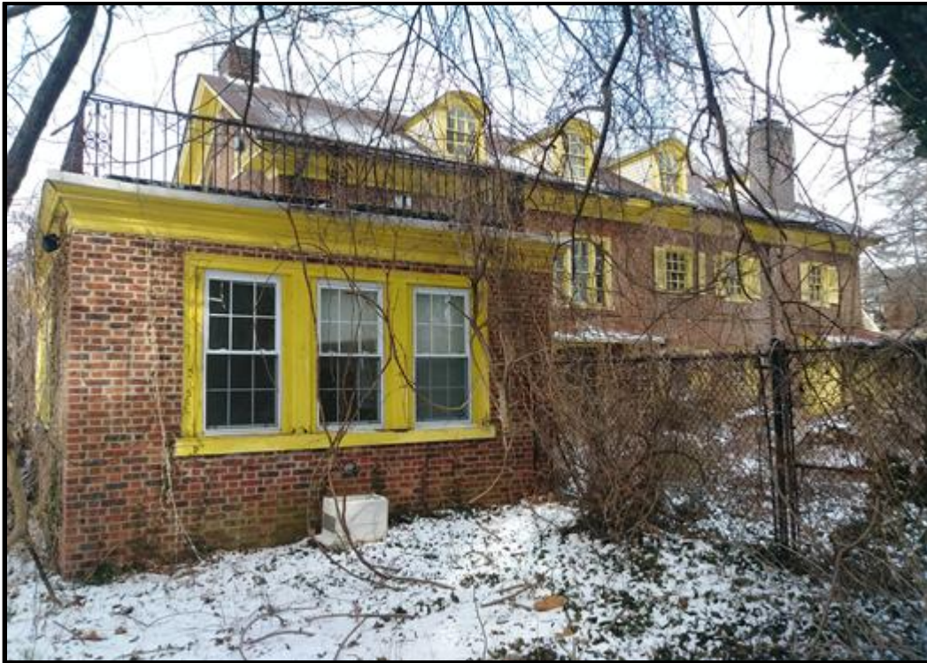
Looking west at the rear elevation of the porch wing and the main block of the subject house.