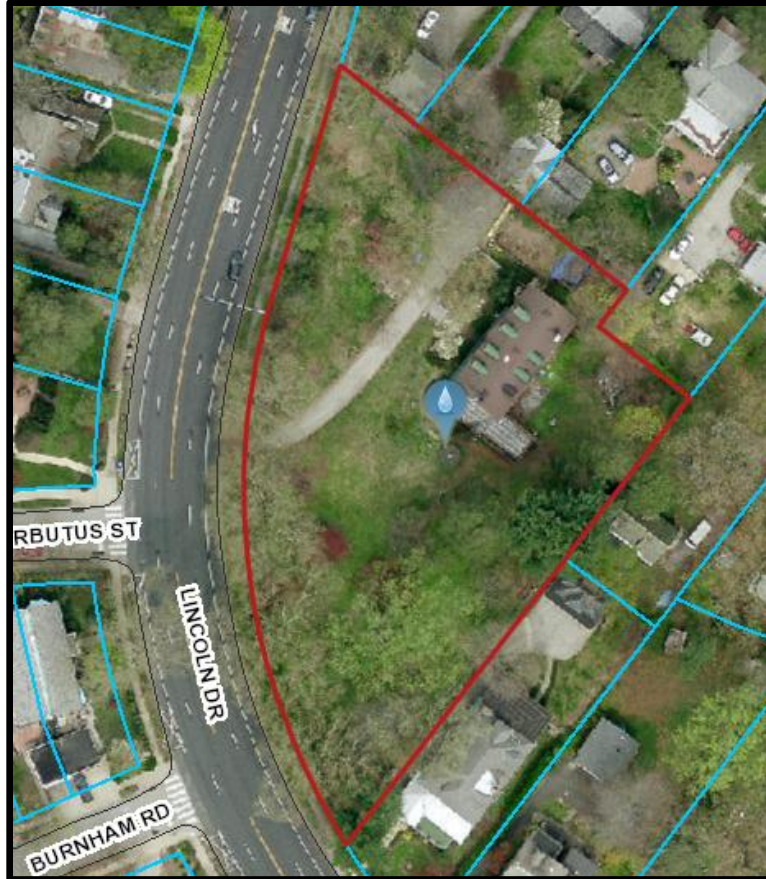
The subject designation is confined to the parcel delineated above in red.

ORIGINAL BOUNDARY AS DESIGNATED BY PHC ON 1/11/2019 (SEE BOUNDARY AMENDMENT, 7/9/2021, ABOVE)