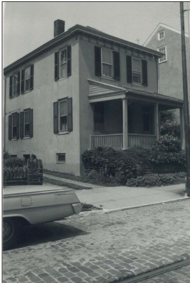
Fig. 13. An undated photograph from the twentieth century showing the house and an altered porch construction but with its shutters intact.

The detached dwelling at 8224 Germantown Avenue was built between 1885 and 1889 by Detweiler (alternatively spelled Detwiler) sisters Harriett and Caroline, ux. Hammond. The two women were born and raised in Chestnut Hill by a family counted among the area's earliest settlers. The modest house reflects a vernacular expression derived from the period's popular picturesque architectural design as exemplified at the highest levels by A.J. Downing that would come to define the early architectural character of the Chestnut Hill neighborhood. After the 1854 Act of Consolidation and the opening of the Germantown Railroad, Chestnut Hill developed into a fashionable nineteenth century suburb. This house and those like it scattered throughout the neighborhood evolved into the defining style of the built environment of Chestnut Hill: sturdily constructed but not overwhelmingly large houses on relatively small lots that have an important visual connection both to the street and to their neighbors. 1