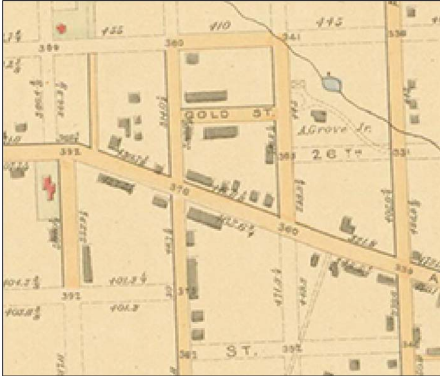
Fig. 19. Detail from the 1888 Baist Atlas of the City of Philadelphia showing the site of the subject property as a contiguous massing seemingly to indicate family ownership.