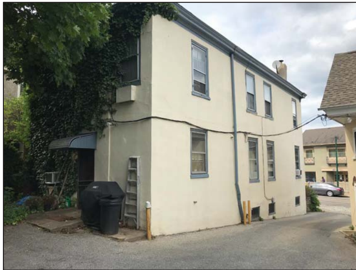
Fig. 7. The rear and south elevations of the dwelling with Germantown Avenue in the background.

level perfectly aligned with each other in the vertical axis. All window openings are the same size except for the rear opening at the first level which may indicate a kitchen or other area with plumbing; there is a water spigot present in the wall under this window further adding to that theory. The windows at the first and second levels seem to have historically been 2/2 and many have contemporary storms. There are three basement windows toward the east side of this elevation, taking advantage of the lower elevation closer to the sidewalk. All windows have simple trim without girth or profile; the sills are painted wood. The roof is indicated by a modest cornice incorporating a gutter; a downspout falls before the final window pairing to the west. There is a stucco chimney penetrating the roof at the south wall toward the front of the house indicating the main parlor likely has a fireplace or stove as a heating element.