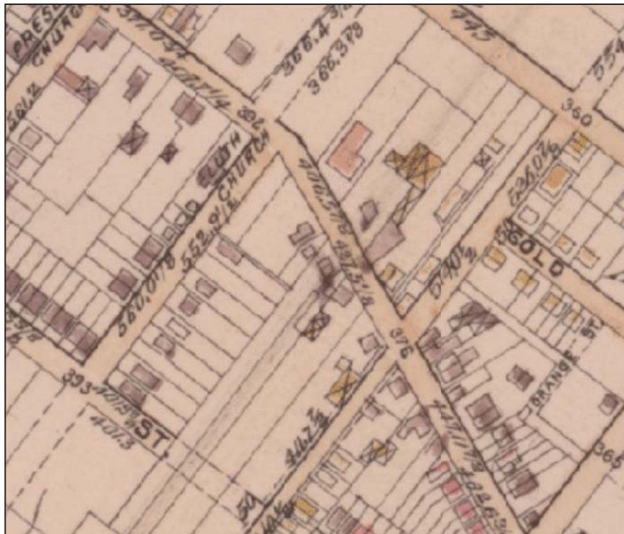
Fig. 20. Detail from the 1895 Bromley Atlas of the City of Philadelphia showing the subject property with lot lines separating it from independent adjacent properties indicating occurrence of family subdivisions.