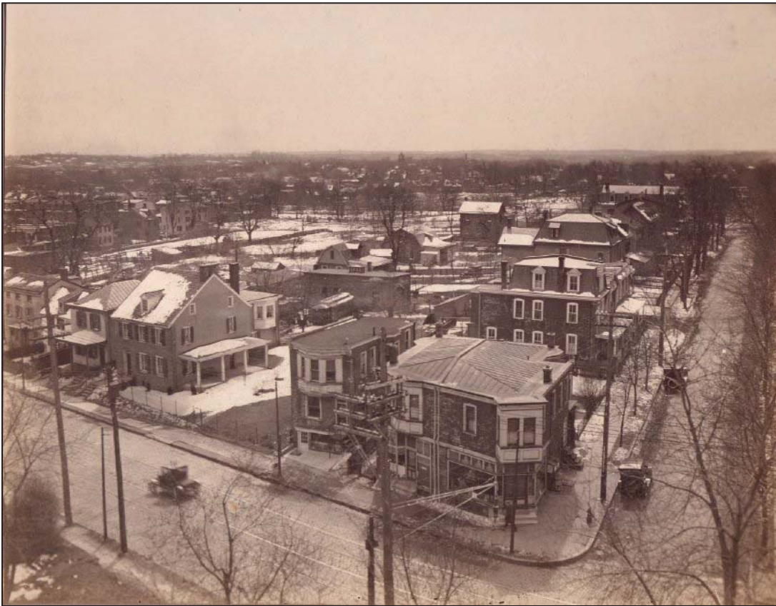
Fig. 12. A 1924 photograph of the 8200 block of Germantown Avenue with the subject property to the left.

The dwelling at 8224 Germantown Avenue is a significant historic resource in Philadelphia and meets Criteria A, H, and J for designation on the Philadelphia Register of Historic Places, as enumerated in Section 14-1004 of the Philadelphia zoning code. The dwelling meets Criterion A as having significant character and value as part of the development of the Chestnut Hill neighborhood of Philadelphia; Criterion H owing to its prominent location along Germantown Avenue, the main thoroughfare of northwest Philadelphia, in its unique eighteenth century configuration; and Criterion J as a reflection of the early mid-nineteenth century character of the emerging suburb of Chestnut Hill and as a residential property associated with an early settler family, the Detweilers.