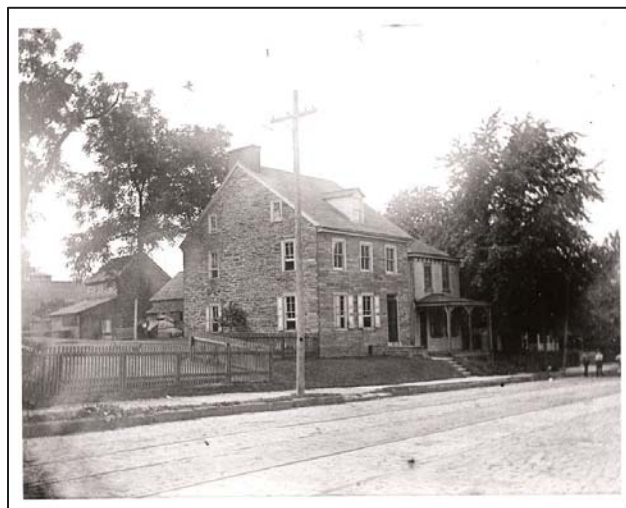
Fig. 14. A photograph (image reversed) from 1900 showing the Harriett and Caroline Detweiler House with its original Italianate porch detailing.

Germantown Avenue’s role as an important regional thoroughfare evolved in the late nineteenth and early twentieth centuries as the neighborhood’s Main Street, with the road serving as the center for all community activities. Housed along the road were hotels, inns, taverns, churches, stores, graveyards, and houses. Unlike many Main Streets, Germantown Avenue has continued to retain a fair amount of mixed usage. The chief importance of the road lies in its role as a commercial artery. Throughout the history of northwest Philadelphia, the road has served as a unifying force in a commercial and an historical sense for Chestnut Hill and the two neighborhoods to the south, Mt. Airy and Germantown.