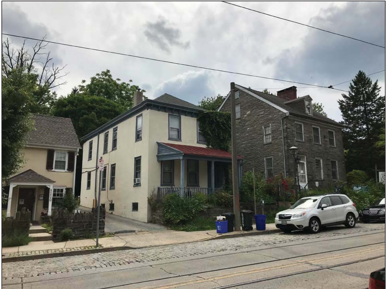
Fig. 2. The Harriett Detweiler and Caroline Detweiler Hammond House at 8224 Germantown Avenue.

The property is known as Parcel No. 128N010053, Office of Property Assessment Account No. 092245100.