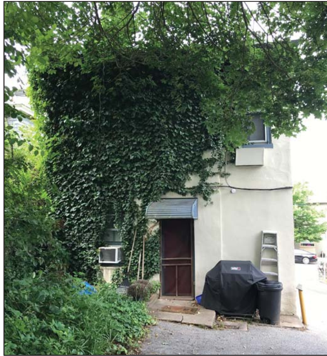
Fig. 9. The west or rear elevation of the property showing the back door and ivy overgrowth. The north lot line is immediately adjacent to the property.