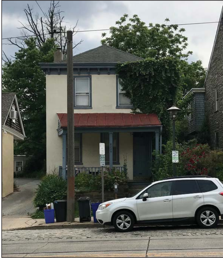
Fig. 6. The primary elevation of the dwelling showing the hipped roof, front porch construction, two bay upper floor and front door to the north of two ground floor windows, all elevated above sidewalk and street level with shared driveway with building to the south.

The building is sited approximately in the middle of the block within a typical narrow lot fronting the main avenue of the neighborhood. Historically, lots fronting Germantown Avenue had this seigneurial format with deep lots and narrow frontage allowing density along the main thoroughfare. It is clad at all elevations (that can be detected since there is a large growth of ivy obscuring the north elevation) in a butter-colored, smooth-coat stucco.