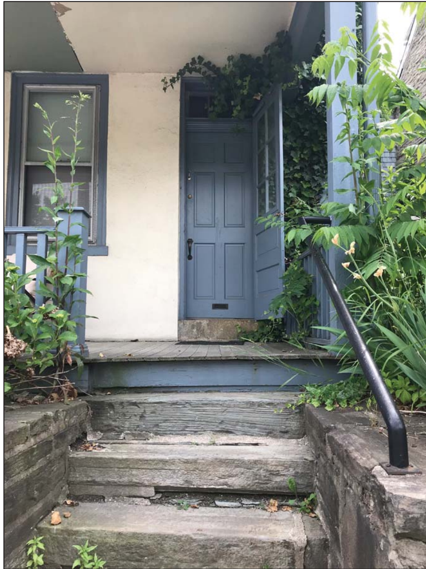
Fig. 11. The front door at the east elevation with the solid, paneled entry door closed and the outer door with glazing in the upper portion open. The floor of the porch is wood, but the steps leading up seem to be of slate while the cheek walls are of schist. The handrail is contemporary.

The rear or west elevation is partially obscured by overgrowth of ivy from the north side of the property. At the first level, there is a back door with insect screen door centered in the wall and within what might be a slight protrusion from the main wall plane that seems to extend to the cornice. To the north of this door is a window opening with an air conditioning unit installed. At the upper level, only the window to the south is visible but it would be expected that there is at least another window at the second level.