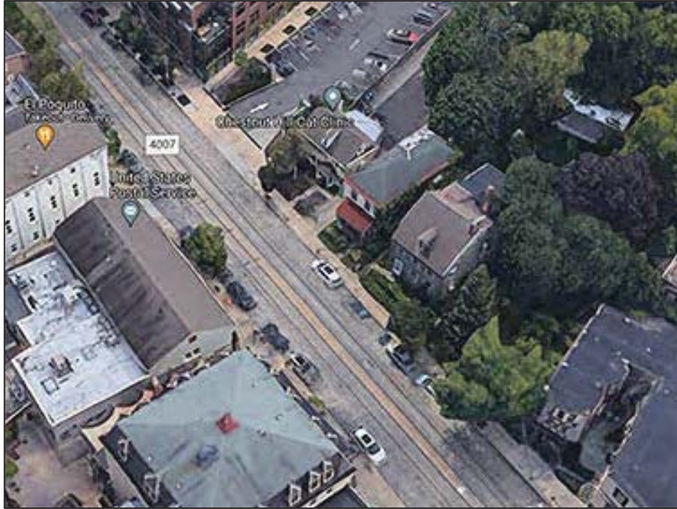
Fig. 3. Perspective of 8224 Germantown Avenue from north.