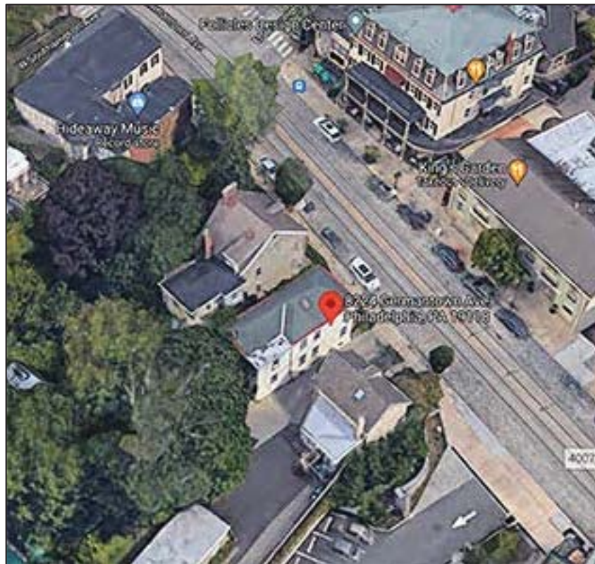
Fig. 4. Perspective of 8224 Germantown Avenue from the south.