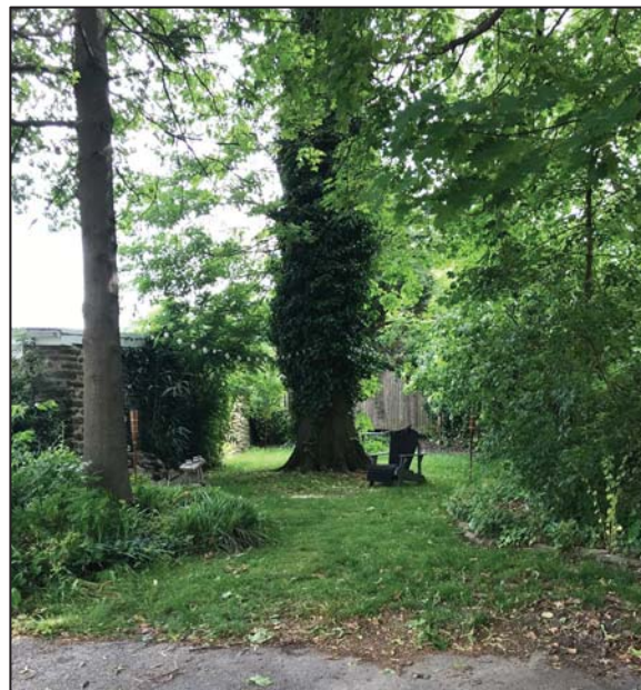
Fig. 8. The lawn in the rear, or far west, of the property.