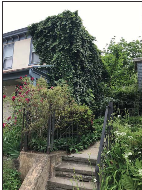
Fig. 10. The north elevation obscured by ivy and showing the front steps of the adjacent property.