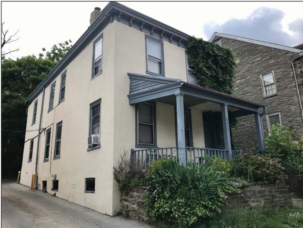
Fig. 5. A recent photograph showing the house and an altered porch construction and without its shutters intact.

**All photographs of the site were taken by the author on Wednesday, June 2, 2021.