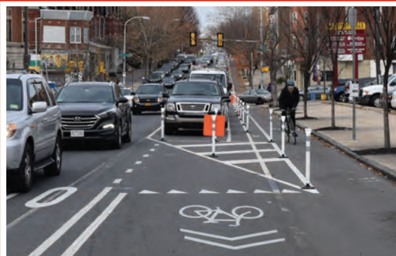
A parking-protected bicycle lane will preserve on-street parking for residents, visitors, and local employees while making sure people on bikes are safe on the road.