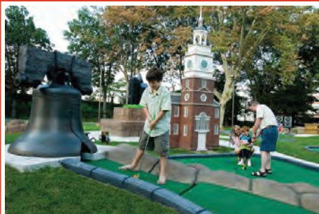
Safer and more convenient pedestrian crossings will improve access to the many resources in Franklin Square and Franklin Square Playground for users of all ages.