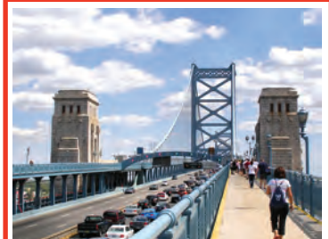
Connections to existing bike lanes and the Ben Franklin Bridge path will enhance the City's bicycle and trail network.