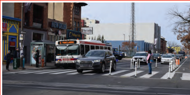
Painted islands with flexible delineator posts at key intersections will shorten the crossing distance for pedestrians.

A new, improved roadway configuration on Race Street between 5th and 8th streets will make the Race Street corridor safer and more comfortable for all travelers using all modes. It will also enhance safe access to Franklin Square for residents and visitors, and improve the connection to the Ben Franklin Bridge Walking and Biking path.