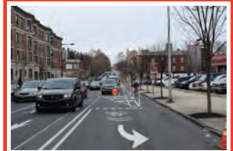
A dedicated turn lane will decrease confusion on the roadway and help keep vehicles moving smoothly.