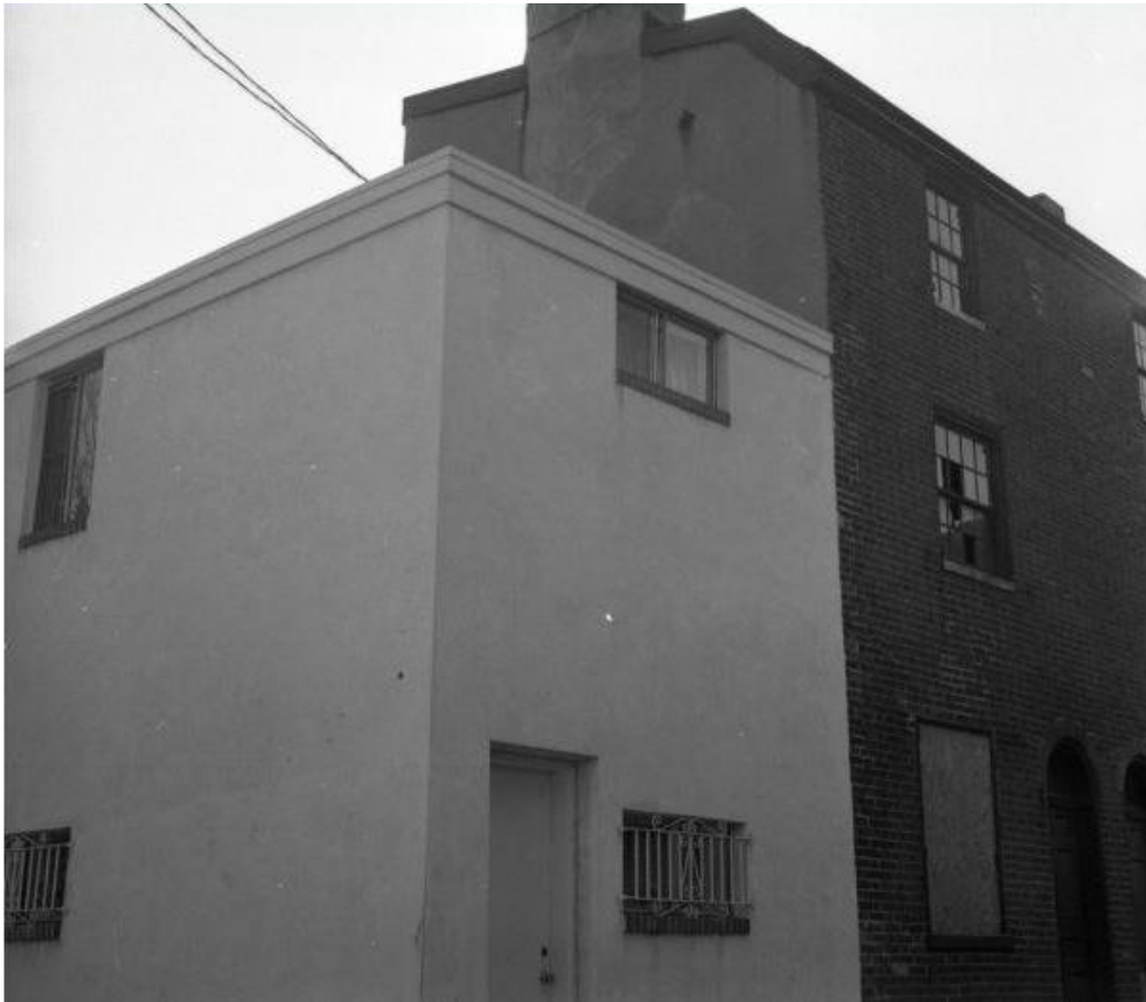
Photograph of 413 S. Perth Street in 1968.