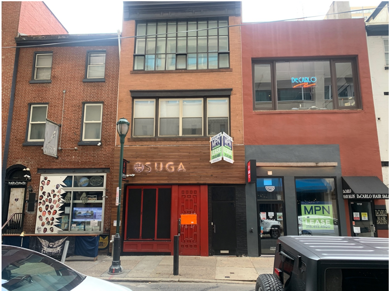
The entire building