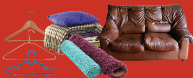
NO CLOTHING, HANGERS, FURNITURE OR CARPET