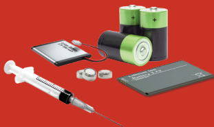
NO BATTERIES OR NEEDLES