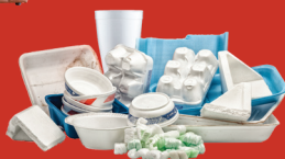
NO FOAM CUPS OR CONTAINERS