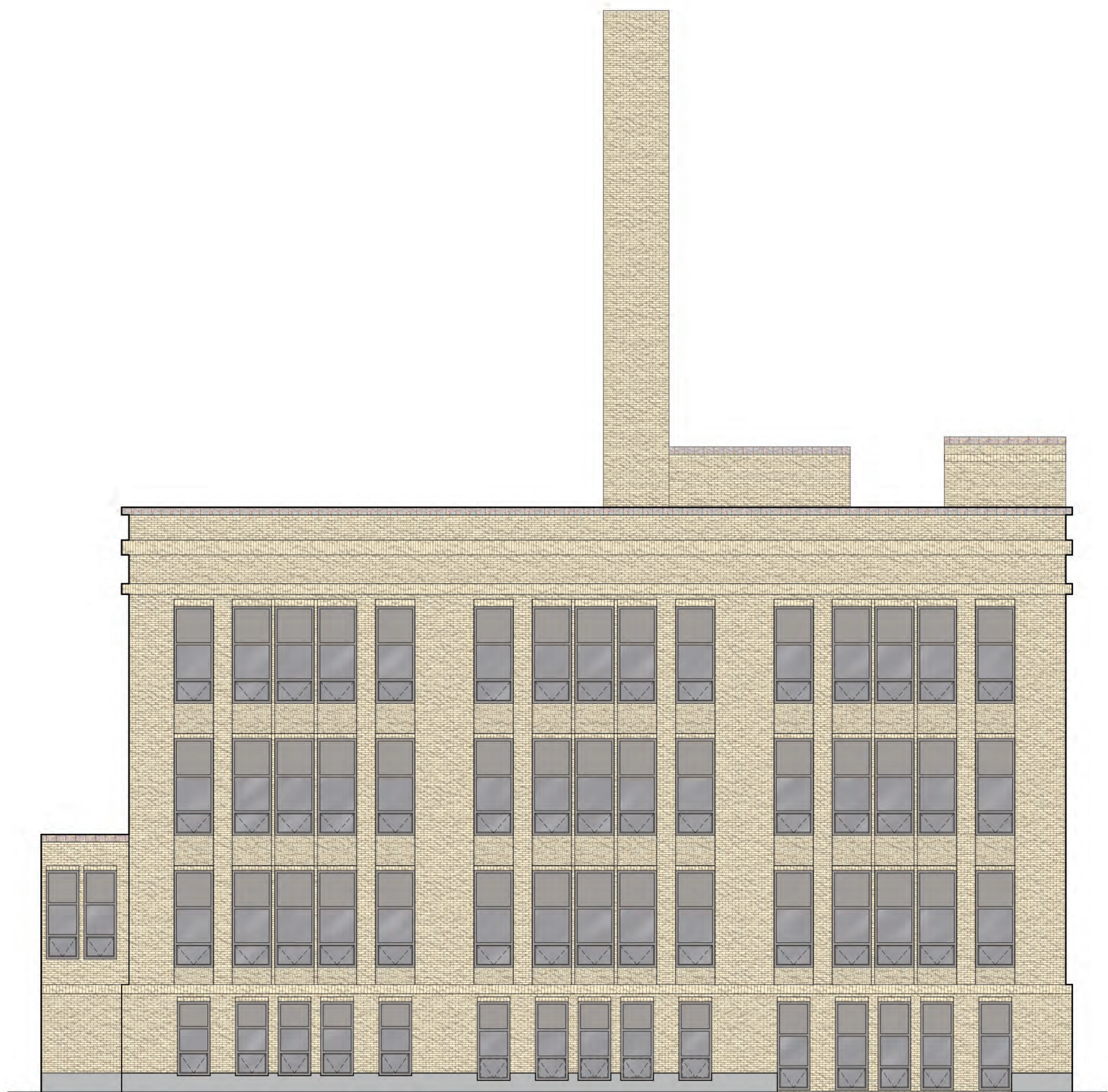
1 EAST ELEVATION SCALE: 1/8" = 1'-0"

S.J.H. ENGINEERING, P.C. 3700 Route 27, Suite 201 Princeton, NJ 08540-9610 Phone: 732-329-0500 Fax: 866-812-1207 Email: SJAY@S.J.HENG.COM Attn: S. Jayakumar