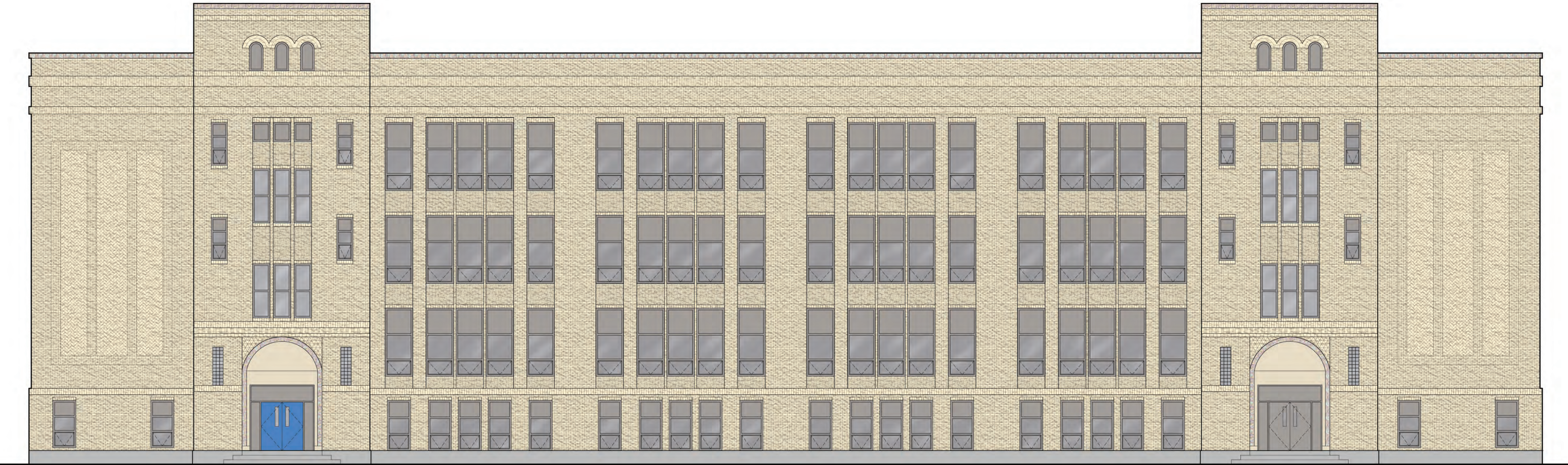
3 NORTH ELEVATION SCALE: 1/8" = 1'-0"

EXISTING TERRA COTTA COPING, TYP EXISTING BRICK, TYP ALUMINUM WINDOWS W/ TINTED GLAZING, INSULATED PANELS, AND INTEGRAL VANDAL SCREENS, TYP EXISTING CONCRETE FOUNDATION, TYP