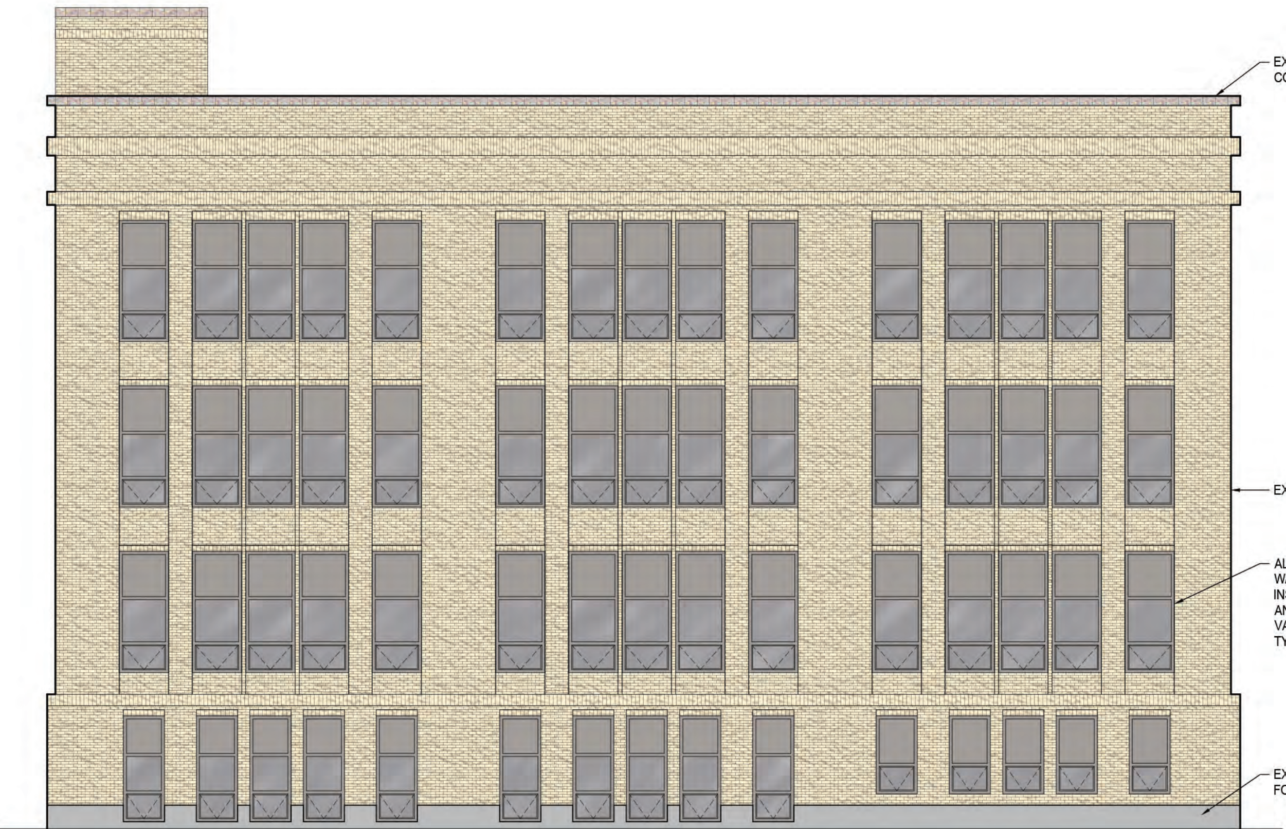
2 WEST ELEVATION SCALE: 1/8" = 1'-0"

EXISTING TERRA COTTA COPING, TYP EXISTING BRICK, TYP ALUMINUM WINDOWS W/ TINTED GLAZING, INSULATED PANELS, AND INTEGRAL VANDAL SCREENS, TYP EXISTING CONCRETE FOUNDATION, TYP