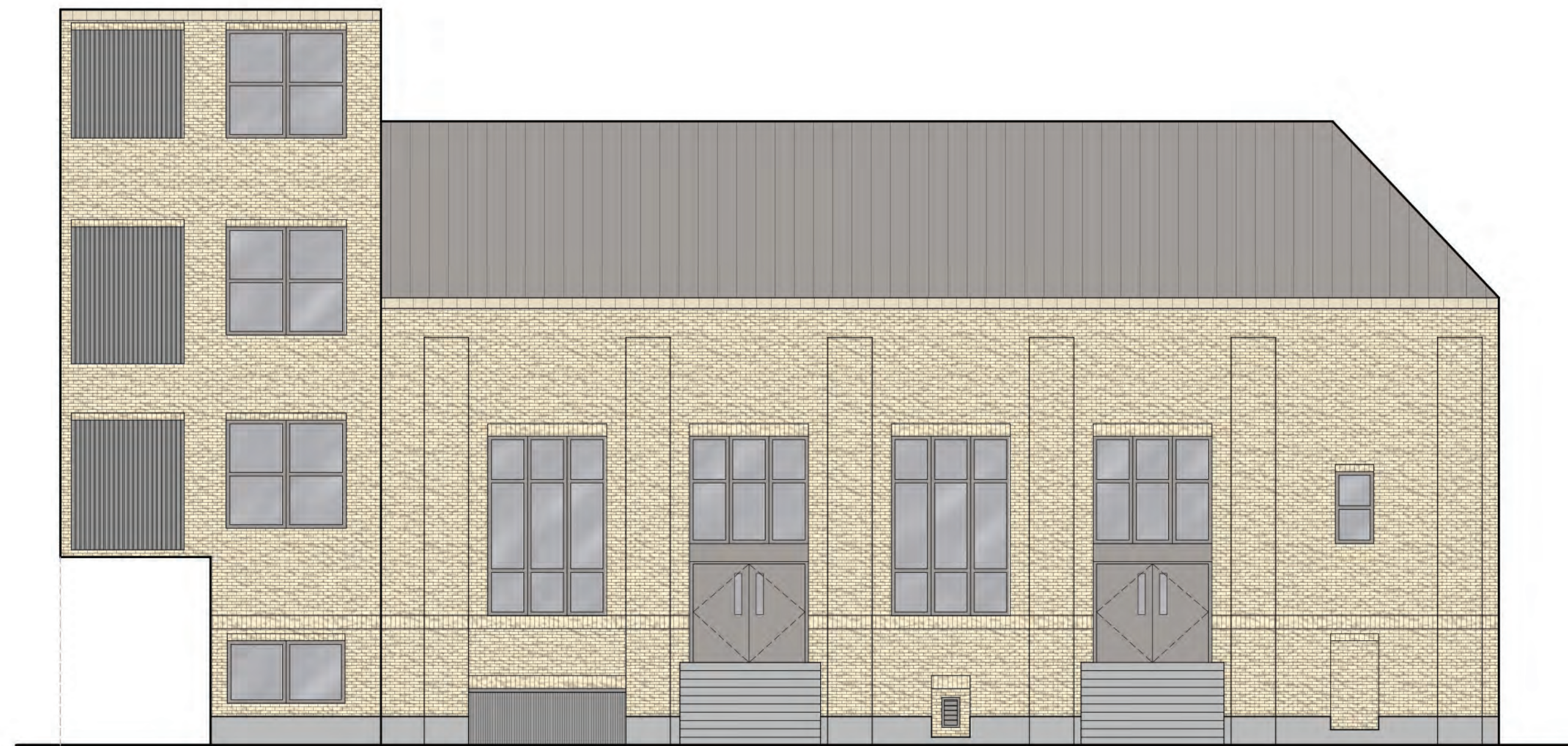
2 WEST ELEVATION SCALE: 1/8" = 1'-0"