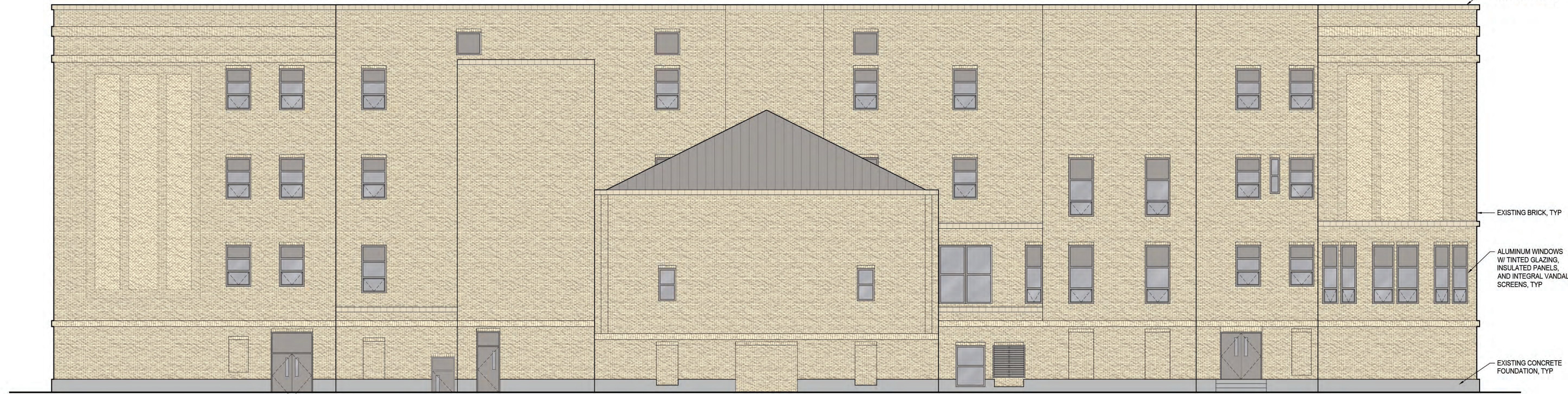
3 SOUTH ELEVATION SCALE: 1/8" = 1'-0"