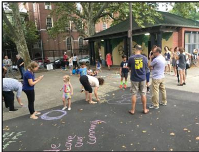
Weccacoe Playground and Bethel Burying Ground