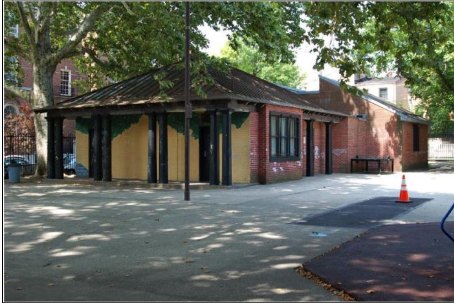
Recreation center building (to be removed by hand), Weccacoe Playground and Bethel Burying Ground