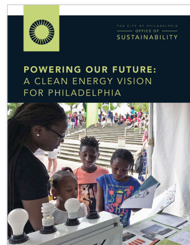
POWERING OUR FUTURE bit.ly/EnergyVisionPHL

To learn more about climate change and what the City of Philadelphia can do about it, check out the reports to the right. Powering Our Future: A Clean Energy Vision for Philadelphia provides a roadmap to achieving Mayor Kenney's goal of reducing carbon emissions 80% by 2050. It highlights actions you can take at the local, state, and federal levels. Growing Stronger: Toward a Climate-Ready Philadelphia identifies the risks and impacts of climate change in Philadelphia and strategies to address them.