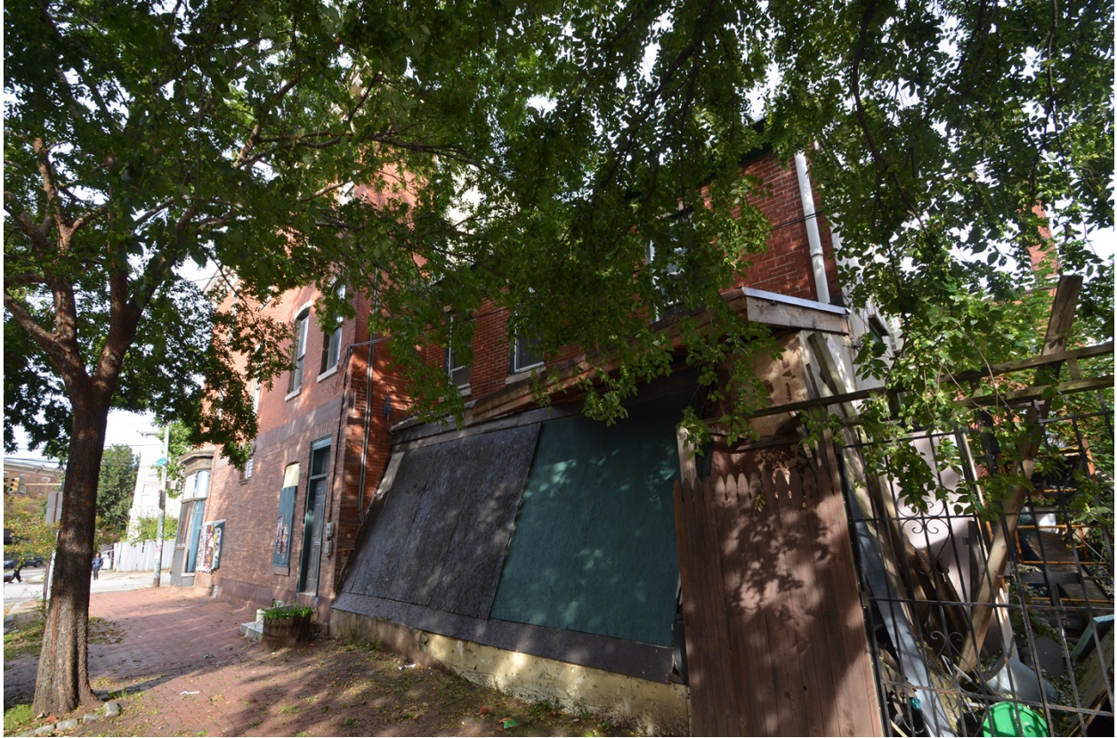
Figure 8: South (Race Street) elevation, rear ell.

porch area currently concealed behind sloping plywood panels [Fig. 8]. The shed roof and porch were added c.1981 and are non-contributing features. 2