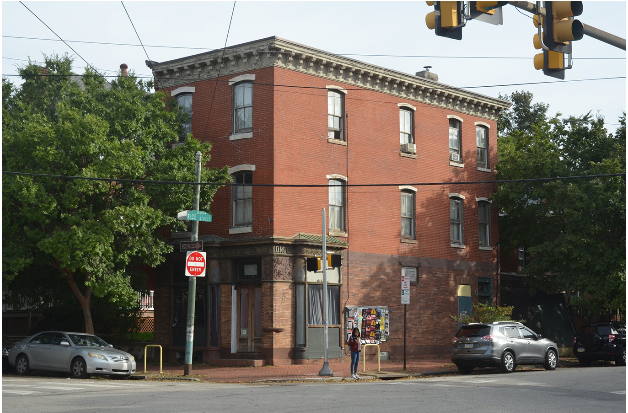
Figure 1: Subject property 201 N. 36 th Street (the northeast corner of 36 th and Race Streets) as viewed across Lancaster Avenue.

The former Simpson's Apothecary at 201 N. 36th Street stands on the northeast corner of 36th and Race Streets, a prominent five-point intersection bisected by Lancaster Avenue in the Powelton Village neighborhood of West Philadelphia [Fig. 1]. The building was constructed in 1876 as a freestanding three-story "store and dwelling" in the Italianate style. It measures 18 feet wide along its two-bay west (36th Street) elevation and 48 feet wide along its four-bay south (Race Street) elevation, with a two-story, three-bay rear ell extending an additional 24 feet to the east. Its rear east elevation faces a short yard area occupying the remainder of the lot. Its north elevation is an unfenestrated, stuccoed party wall facing the side yard of the adjacent parcel [Fig. 3]. Both its 36th and Race Street sidewalks are brick.