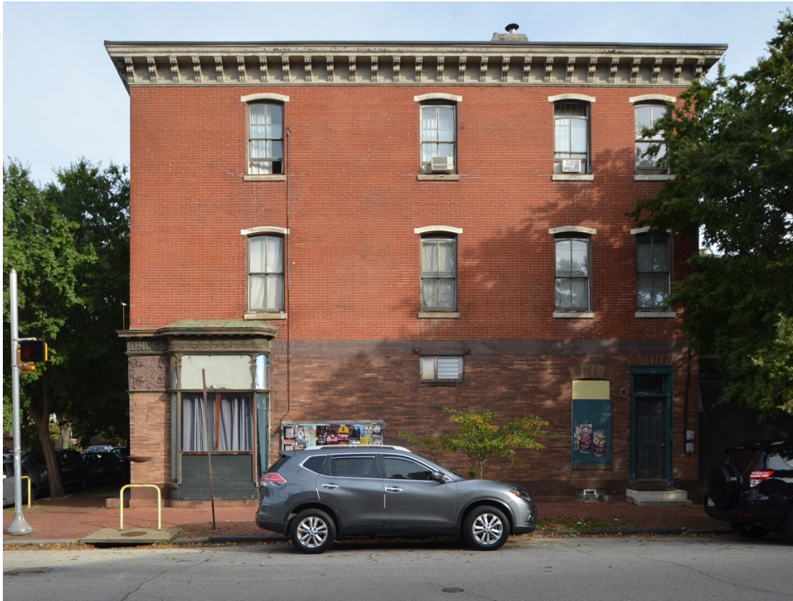
Figure 2: South (Race Street) elevation, main block.