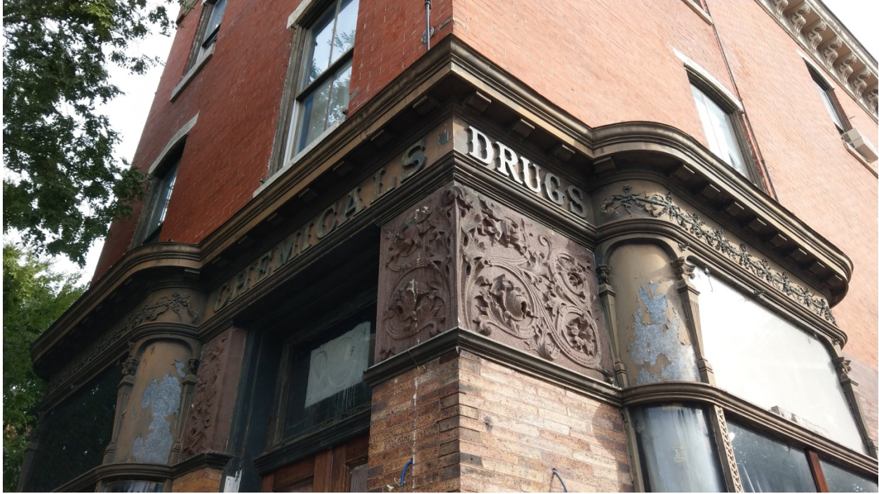
Figure 7: Storefront cornice, fascia signage, brownstone panels, and bay window details.

The building's ground floor, most likely an early-20th-century alteration, is faced with iron-spotted Roman brick and trimmed with brownstone [Figs. 4-7]. 1 A pair of projecting display windows-- one along 36th Street, one along Race Street-- bracket a double-leaf wood and glass store entrance facing 36th Street. The display windows are round-cornered, full-height bays on stone bulkheads and capped with bracketed copper cornices. Both bays feature engaged Corinthian piers, disc-patterned mullions, and fascia bands with dimensional festoons. The 36th Street bay retains a leaded glass transom. The bracketed cornice wraps the building's corner with dimensional fascia signage reading "CHEMICALS" along 36th Street and "DRUGS" along Race Street. Brownstone foliate relief panels cap a brick corner pier and flank each display bay. The Roman brick continues the length of the Race Street ground floor elevation [Fig. 2]. A high-set masonry opening with decorative brownstone lintel blocks and a curved sill is located at the center of the elevation. A secondary single-leaf wood door and flanking window (currently boarded) are located at its eastern end; both are capped by brick arch lintels. A two-story rear ell stands to the east of the main volume, with a shallow shed roof projecting over a ground floor