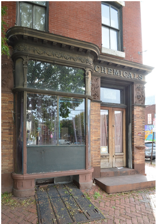
Figure 5 (left): 36 th Street storefront detail