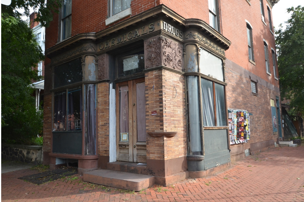
Figure 4: Storefront detail, 36 th Street (left) and Race Street (right)