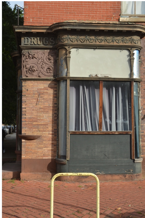
Figure 6 (right): Race Street storefront detail