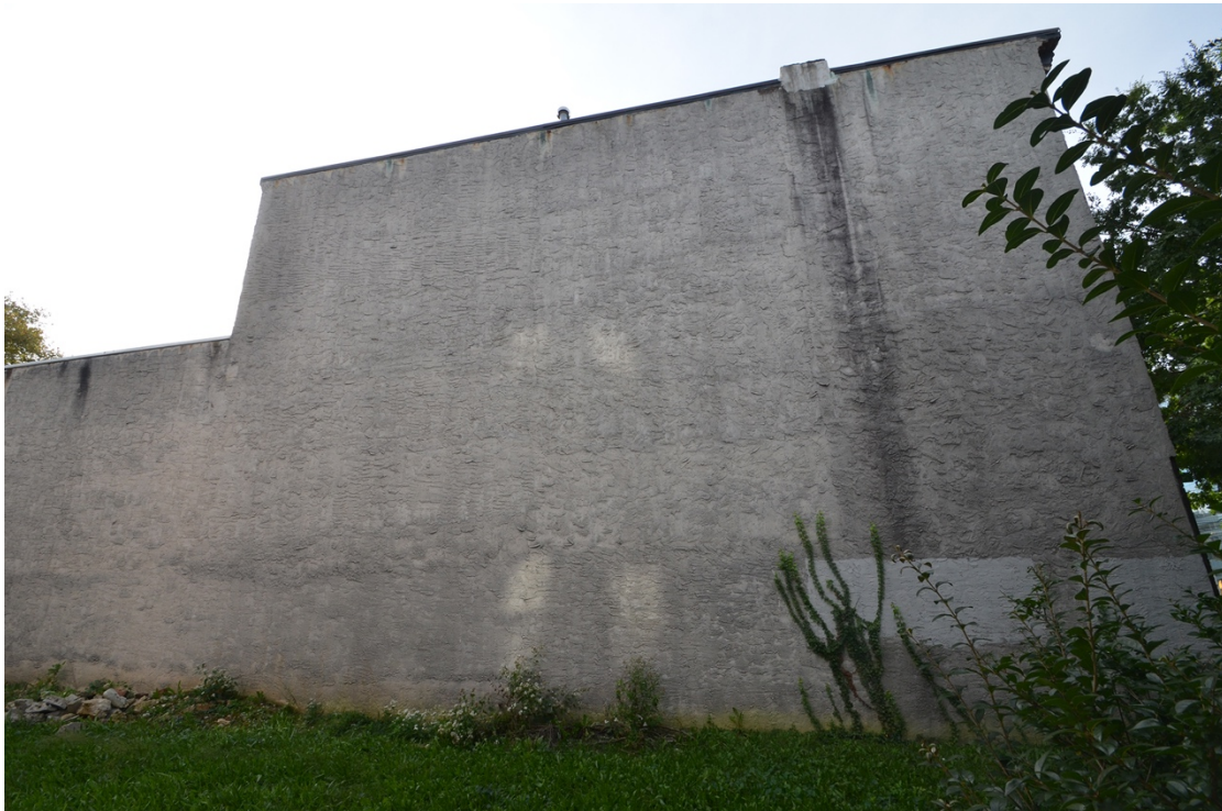
Figure 3: North elevation