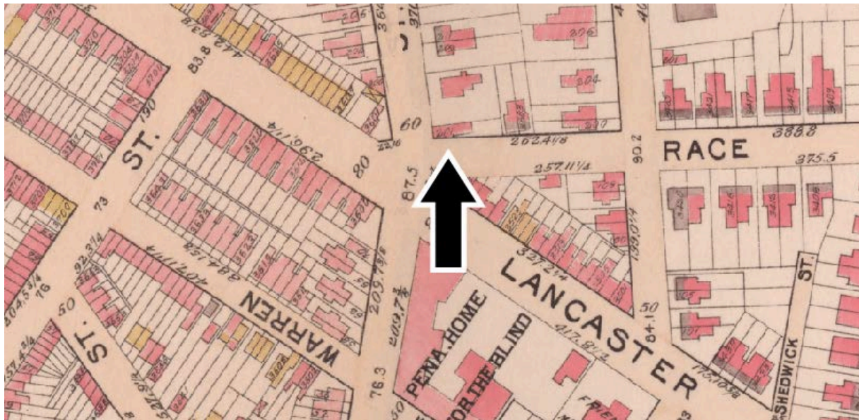
Figure 10: Property and surroundings in 1895. Atlas of the City of Philadelphia, G.W. Bromley & Co, 1895.

neighborhoods of Powelton to the north and Greenville to the south. Between 1870 and 1880, the adjacent 3600 block of Lancaster Avenue developed as a contiguous row of nearly identical three and four-story Italianate store-and-dwelling units; the row was listed on the Philadelphia Register of Historic Places in 2015 based in part on the significance of its Italianate character. 8